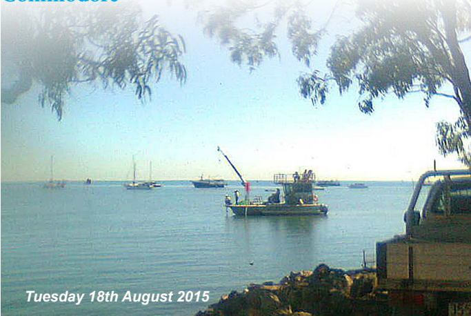
Little Ship Club (Queensland Squadron)

Fly your burgee with pride. Lyle Watkins Commodore