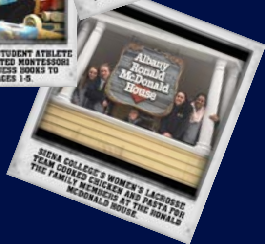
SIENA COLLEGE'S WOMEN'S LACROSSE TEAM COOKED CHICKEN AND PASTA FOR THE FAMILY MEMBERS AT THE RONALD MCDONALD HOUSE.