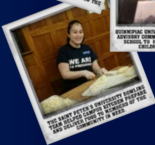
THE SAINT PETER'S UNIVERSITY BOWLING TEAM HELPED CAMPUS KITCHENS PREPARE AND DELIVER FOOD TO MEMBERS OF THE COMMUNITY IN NEED.