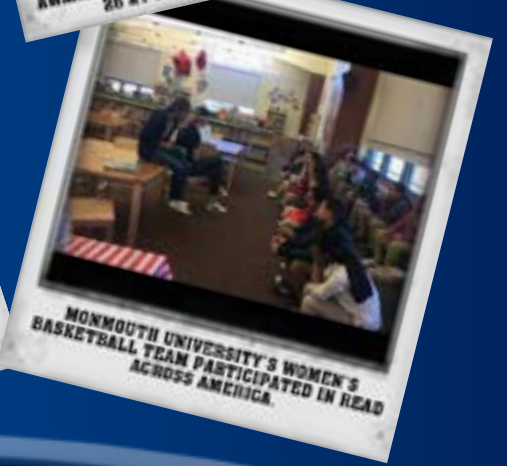
MONMOUTH UNIVERSITY'S WOMEN'S BASKETBALL TEAM PARTICIPATED IN ROAD ACROSS AMERICA.

Under the Geico GoodWorks Program structure, MAAC member schools who have completed community service projects will be featured each month throughout the academic year. Monthly releases will be published and archived on MAACSports.com that highlight the volunteer efforts of MAAC schools during that month.