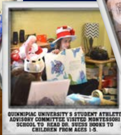
QUINNIPIAC UNIVERSITY'S STUDENT ATHLETIC ADVISORY COMMITTEE VISITED MONTESSORI SCHOOL TO READ DR. SEUSS BOOKS TO CHILDREN FROM AGES 1-5.