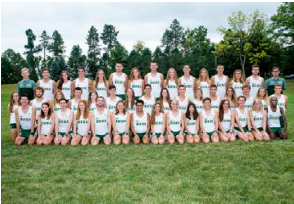
2017 MEN'S ROSTER