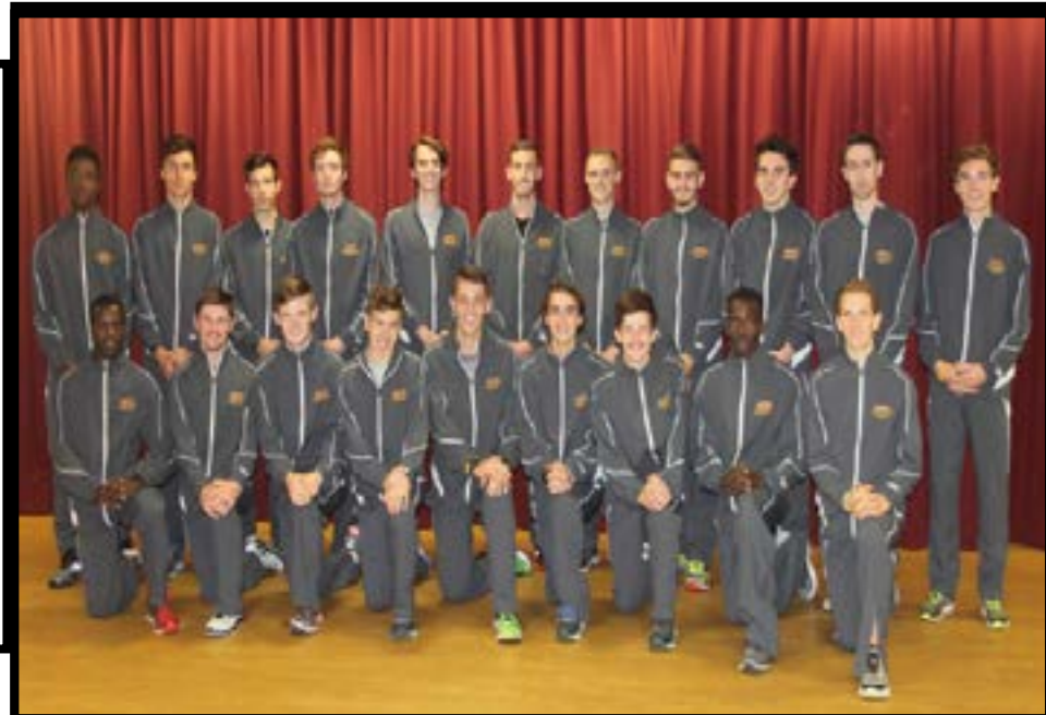
2017 MEN'S ROSTER