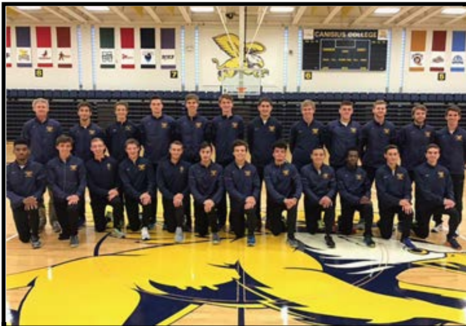
2017 MEN'S ROSTER