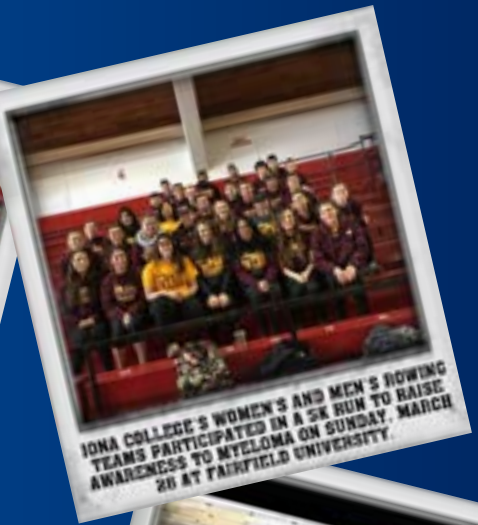
IONA COLLEGE'S WOMEN'S AND MEN'S ROWING TEAMS PARTICIPATED IN A 5K RUN TO RAISE AWARENESS TO MYELOMA ON SUNDAY, MARCH 20 AT FAIRFIELD UNIVERSITY.