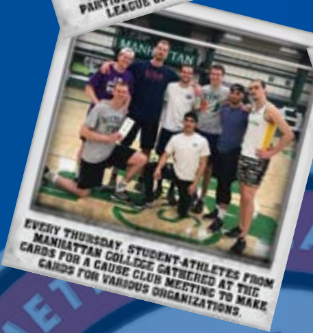
EVERY THURSDAY, STUDENT-ATHLETES FROM MANHATTAN COLLEGE GATHERED AT THE CARDS FOR A CAUSE CLUB MEETING TO MAKE CARDS FOR VARIOUS ORGANIZATIONS.