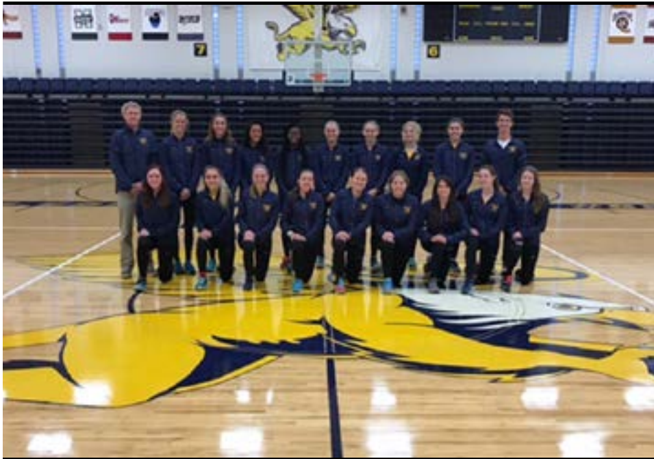
2017 WOMEN'S ROSTER