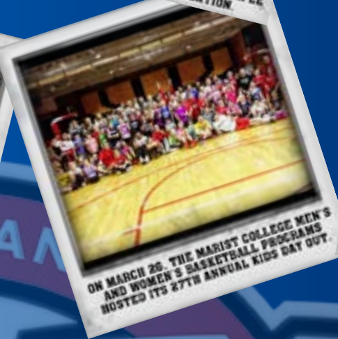
ON MARCH 26, THE MARIST COLLEGE MEN'S AND WOMEN'S BASKETBALL PROGRAMS HOSTED ITS 27TH ANNUAL KIDS DAY OUT.