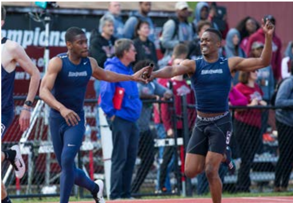
2017 MEN'S ROSTER