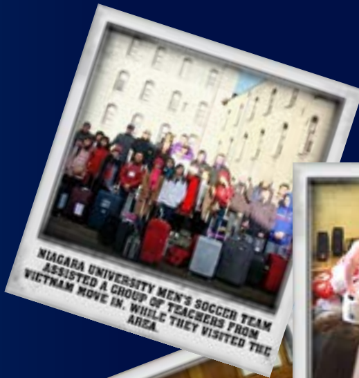
NIAGARA UNIVERSITY MEN'S SOCCER TEAM ASSISTED A GROUP OF TEACHERS FROM VIETNAM MOVE IN. WHILE THEY VISITED THE AREA.