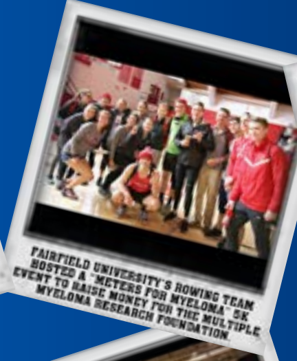
FAIRFIELD UNIVERSITY'S ROWING TEAM HOSTED A "METERS FOR MYELOMA" 5K EVENT TO RAISE MONEY FOR THE MULTIPLE MYELOMA RESEARCH FOUNDATION.