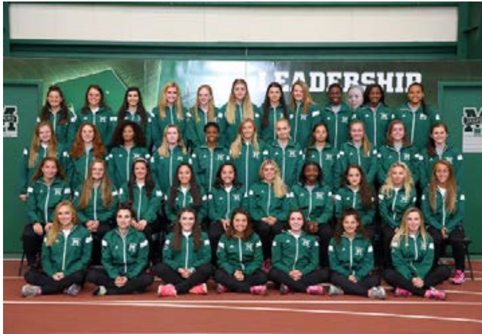
2017 WOMEN'S ROSTER