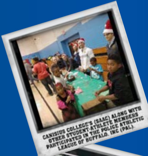
CANISIUS COLLEGE'S (SAAC) ALONG WITH OTHER STUDENT-ATHLETE MEMBERS PARTICIPATED IN THE POLICE ATHLETIC LEAGUE OF BUFFALO, INC. (PAL).