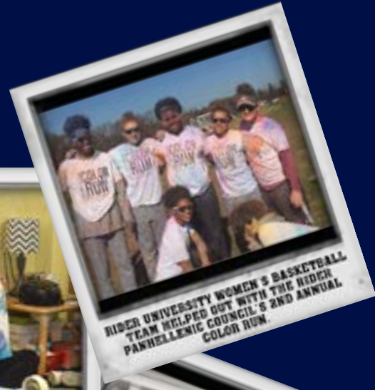
RIDER UNIVERSITY WOMEN'S BASKETBALL TEAM HELPED OUT WITH THE RIDER PANHELLENIC COUNCIL'S 2ND ANNUAL COLOR RUN.