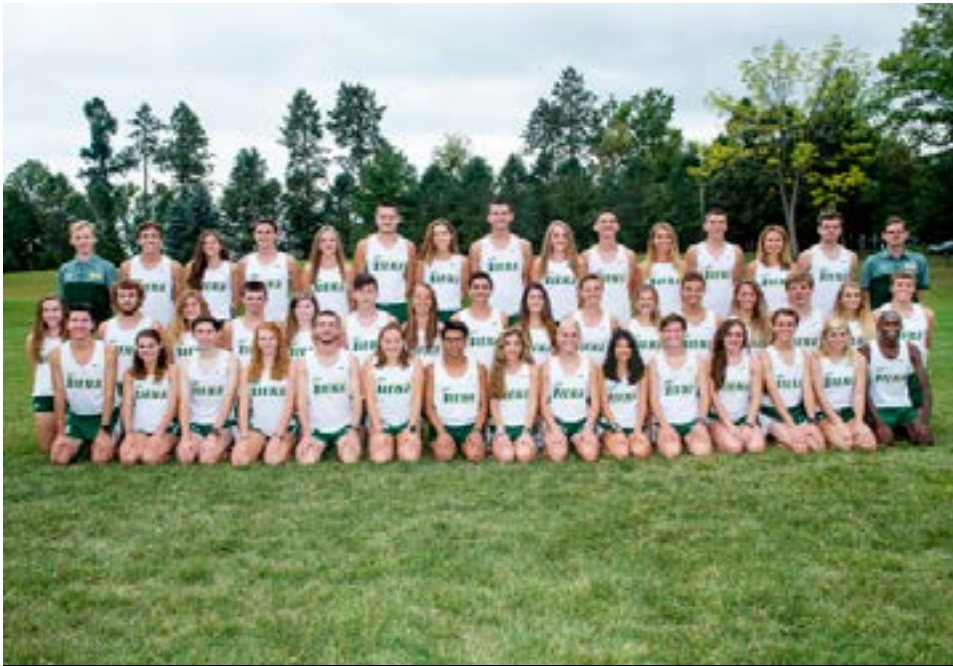
2017 WOMEN'S ROSTER