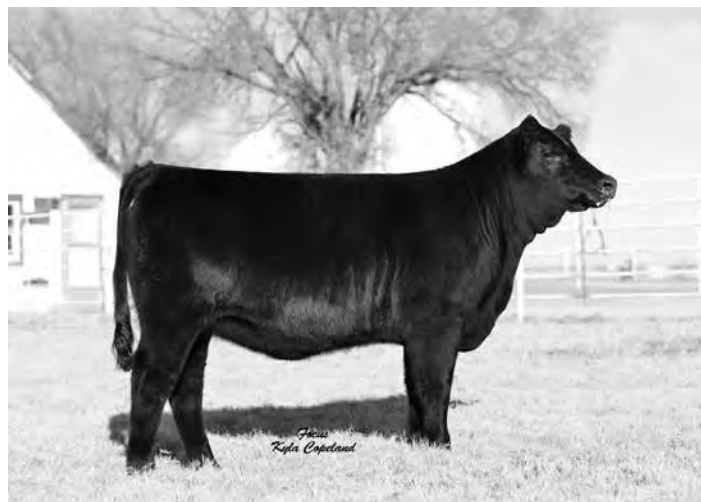
KEEGAN'S HEIFER Maternal sister of Lot #2