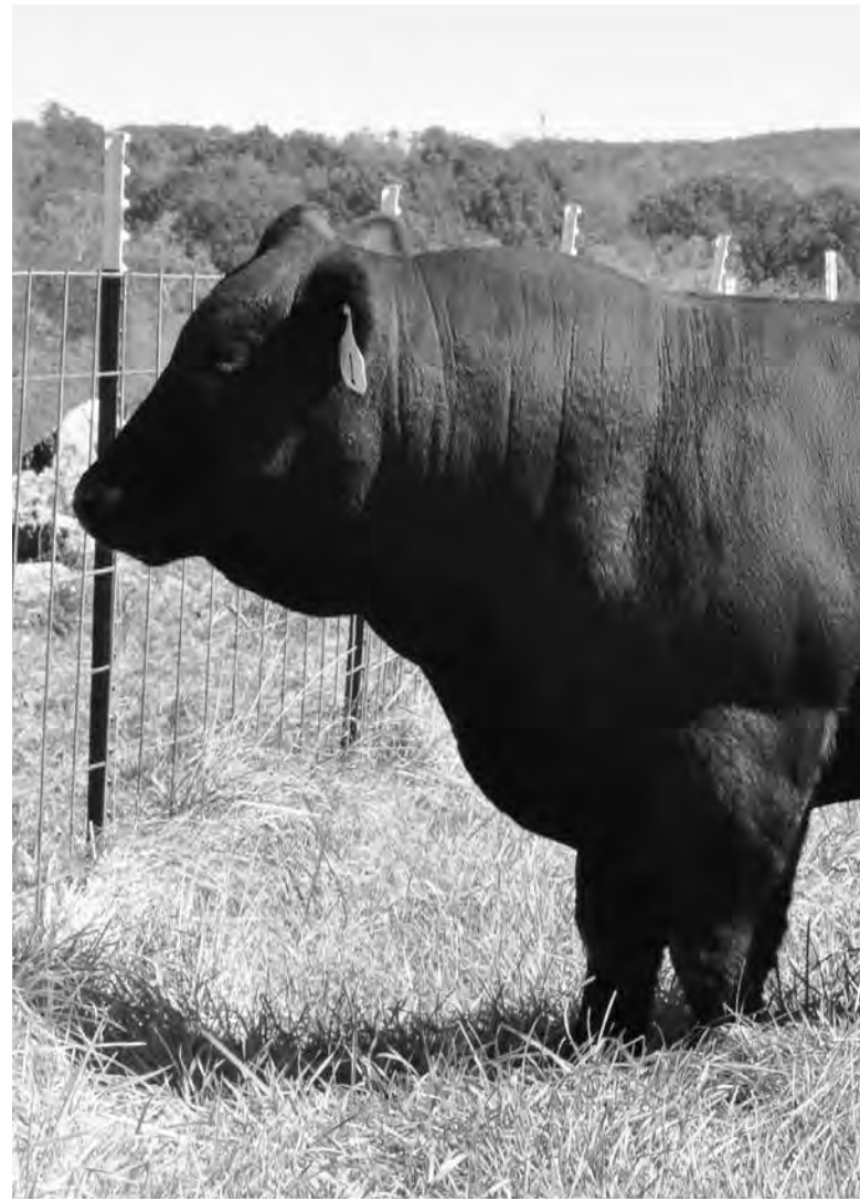
Lot 1: LWHF JKGF C353