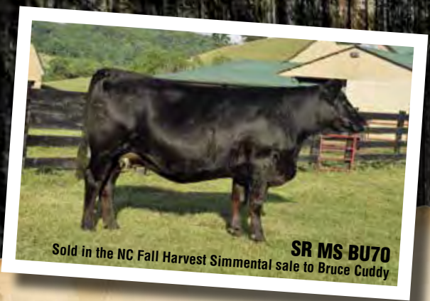
SR MS BU70 Sold in the NC Fall Harvest Simmental sale to Bruce Cuddy