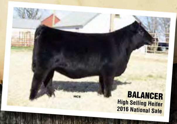
BALANCER High Selling Heifer 2016 National Sale