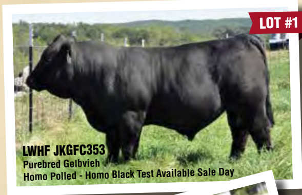
LWHF JKGFC353 Purebred Gelbvieh Homo Polled - Homo Black Test Available Sale Day