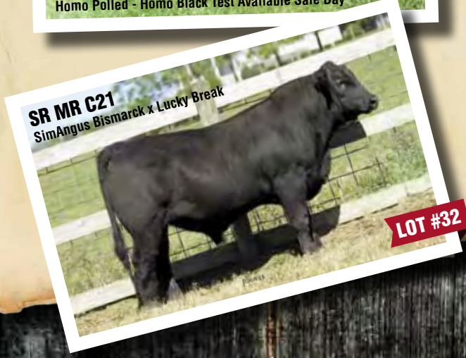
SR MR C21 SimAngus Bismarck x Lucky Break