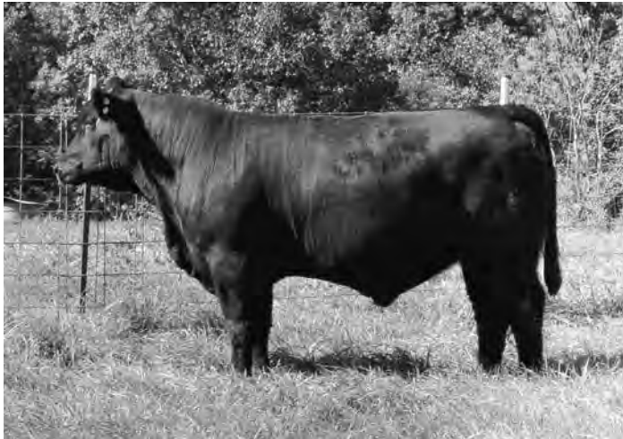
Lot 2: LWHF 112C ET

Oldest bull in the sale, stout, moderate and correct in his make up. Sired by the C-Cross Leverage Bull. Could work anywhere in the country.