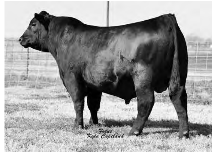
PF BROADVIEW LWHF Junior Angus Herd Sire

We really like this cow, she always has a big stout calf every year at weaning. Due around 11/01/16 to PCC Witten.