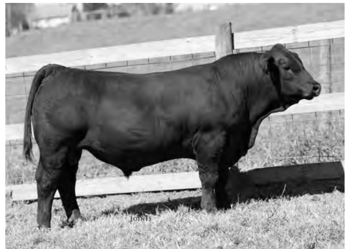
LOT 46: SR MR C60

A very moderate framed, good muscled bull with big testicles. His dam is a steady producer and always does a good job.