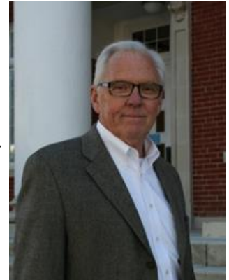
Honorable John C. Emerson, CFA

Hernando County is 589 square miles located on the West coast of central Florida in the highly-regarded Tampa Bay region. It offers the perfect blend of opportunity for business relocation, expansion and lifestyle. We are all about availability, affordability, accessibility and community. The area's geographic features include rolling terrain, lush forests, miles of trails, and approximately 200,000 acres of protected parklands. About 20% of the county is water, including springs, rivers and lakes. The area has two incorporated cities – Brooksville in the center and Weeki Wachee to the west.