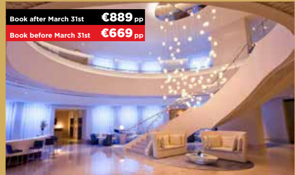
JA Ocean View Hotel Dubai****