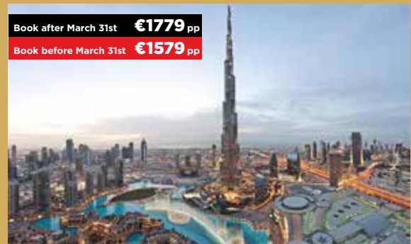
5* Armani Dubai - Downtown