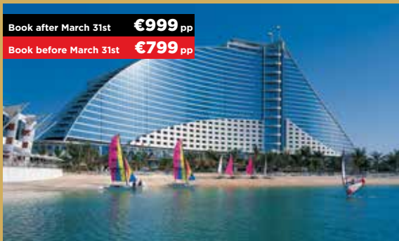
5* Jumeirah Beach Hotel – Jumeirah