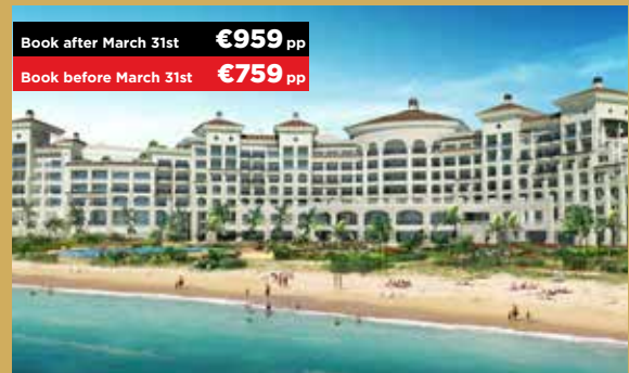
5* Waldorf Astoria – The Palm Dubai