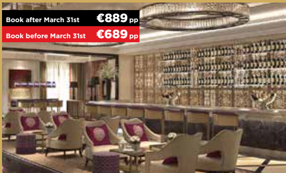
5* Taj Dubai Hotel - Downtown