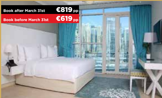
5* Jannah Marina Suites – Dubai Marina