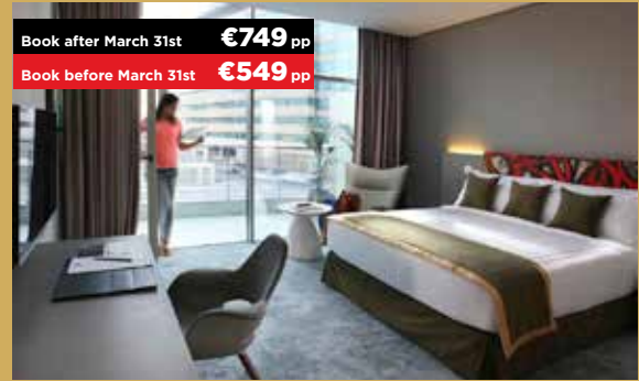
3* Ibis Styles - Jumeirah