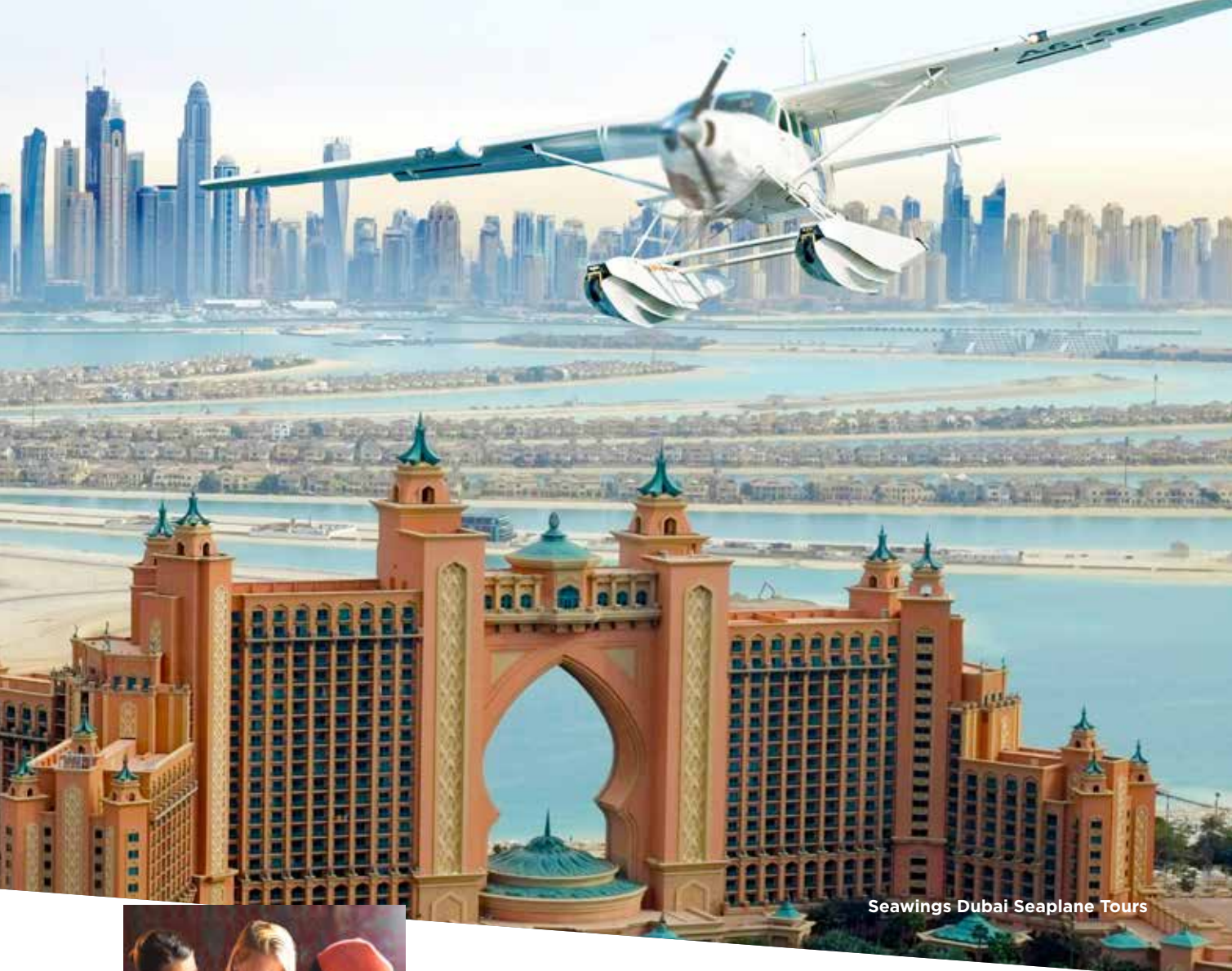
Seawings Dubai Seaplane Tours