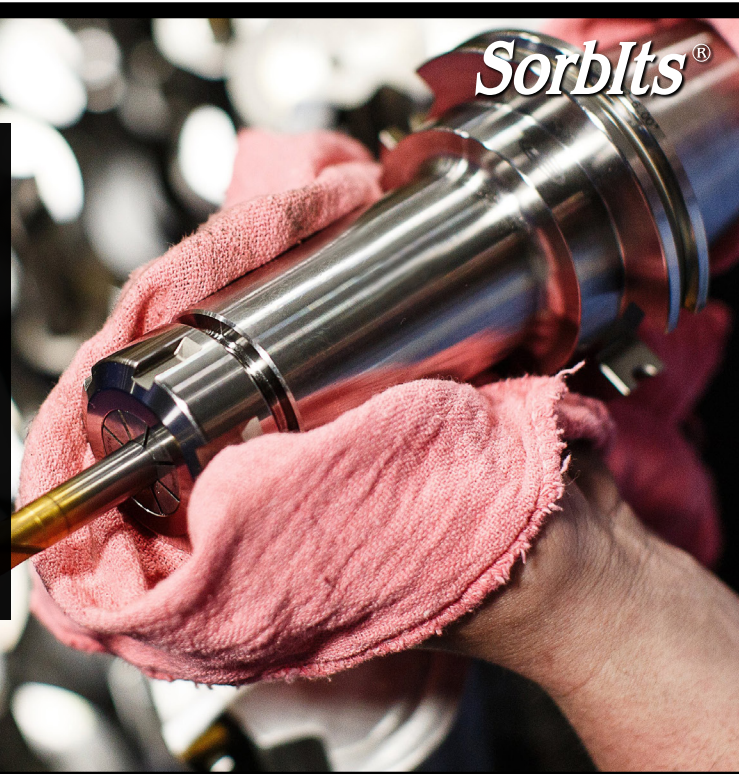
Pictured: Ultra™ Red Shop Towels