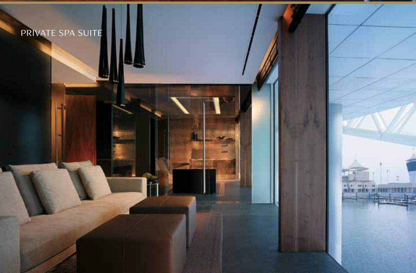
PRIVATE SPA SUITE

Grab an invigorating workout at our world-class gym, featuring state-of-the-art weight and cardio equipment and low-impact building materials, then relax in the sauna and steam room. Or take a plunge in one of the two rooftop pools, featuring excellent sunset views.