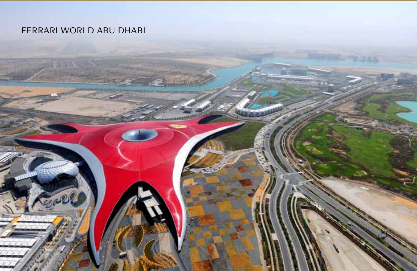
FERRARI WORLD ABU DHABI

Yas Island is located just 10 minutes from Abu Dhabi International Airport, 25 minutes from the centre of Abu Dhabi and 50 minutes from Dubai. Easily accessible via the ten-lane Sheikh Khalifa bin Zayed (Shahama-Saadiyat) Highway, Yas Island is set beyond the vibrant metropolis yet conveniently close for business and recreational visits.