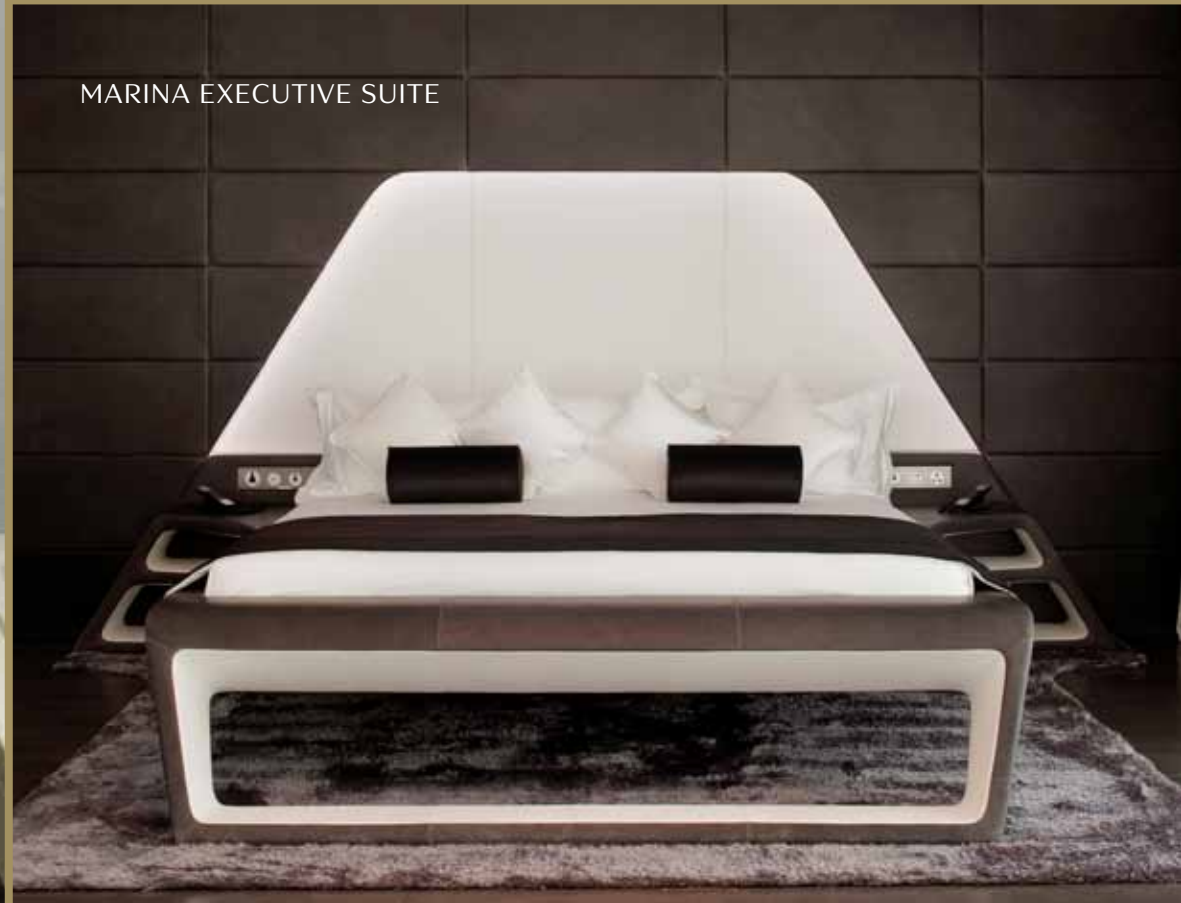
MARINA EXECUTIVE SUITE