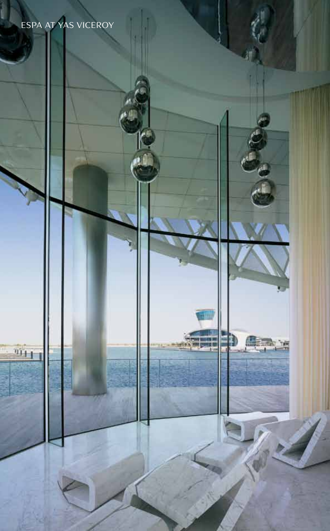
ESPA AT YAS VICEROY