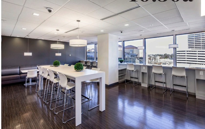
THE LOUNGE The perfect spot for your mid-morning mental break, the tenant lounge is a modern, light filled space with high-end decor and finishes to lighten any mood.