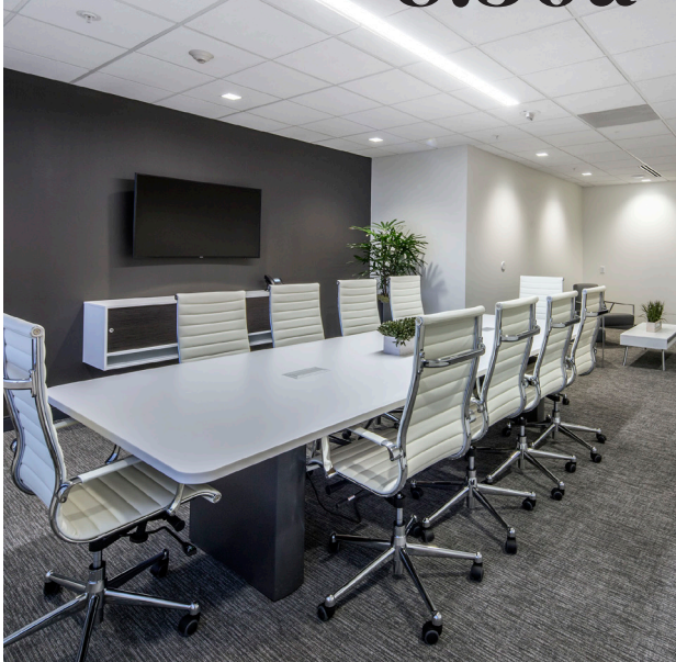
THE CONFERENCE CENTER The new on-site conference center is ideal for hosting the quintessential client meeting.