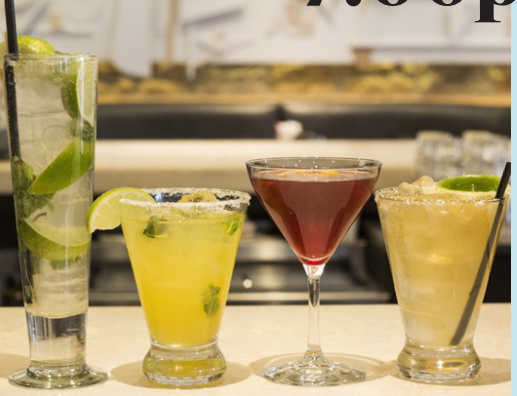
MARGARITAS AT CANTINA Wind down from the workday with a margarita on Cantina's vibrant patio.