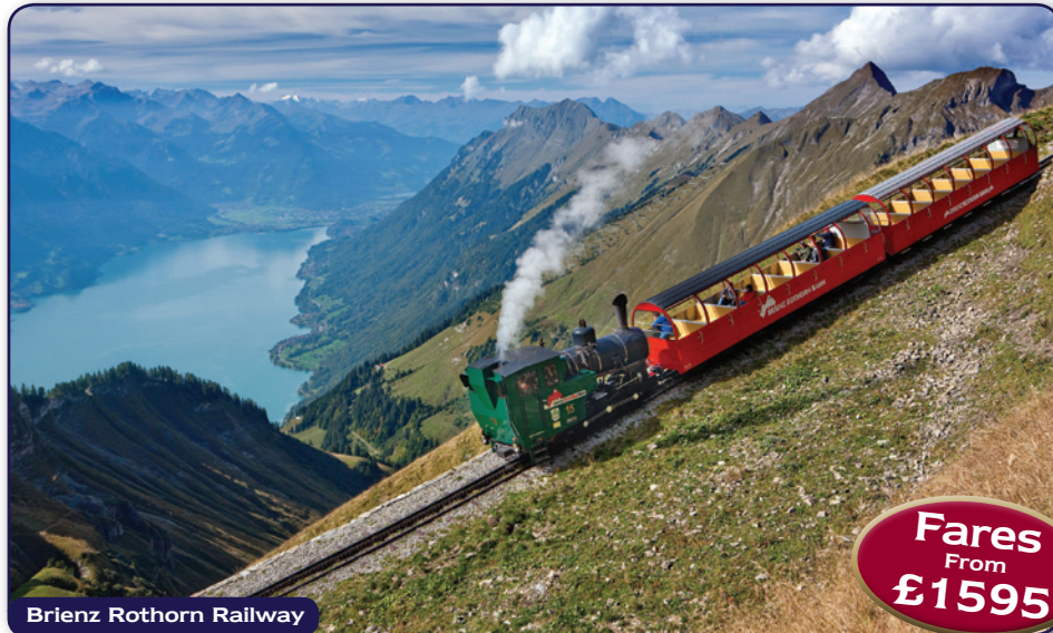
Brienz Rothorn Railway

Switzerland and steam trains - a delightful combination as we take you to the heart of this beautiful country to experience some amazing mountain rail journeys and glorious lake steamer cruises.