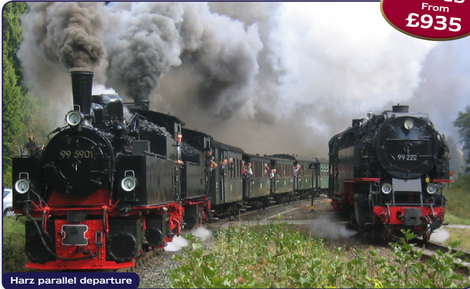
Harz parallel departure