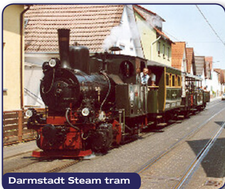
Darmstadt Steam tram

A wonderful late summer break of great German steam in a variety of gauges! Amazing steam-hauled railway journeys, great photo opportunities and the best Railway Works steam show in Europe!