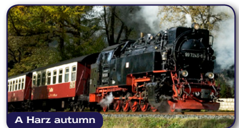
A Harz autumn