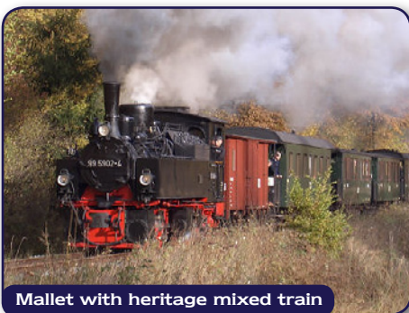
Mallet with heritage mixed train

Incredible value on the wonderful Harz with a private steam charter packed combination of unusual steam workings with passenger, freight and mixed trains using heritage locomotives. Together with the beautiful golden autumn scenery and historic towns and villages, this holiday will appeal to enthusiast and non-enthusiast partners alike.