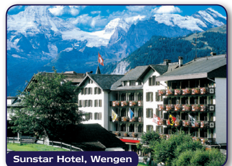
Sunstar Hotel, Wengen