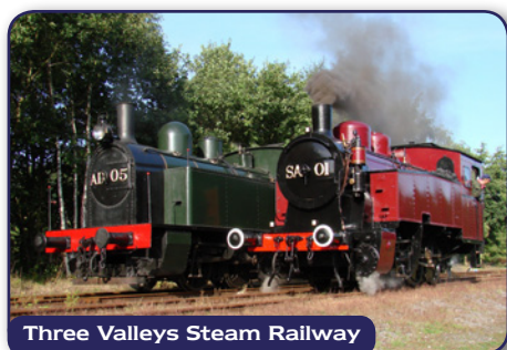
Three Valleys Steam Railway

The Ibis Hotel is situated opposite Charleroi Sud railway station, close to the centre of the town. Rooms feature satellite television, air-conditioning and bathrooms with either a tub or shower.