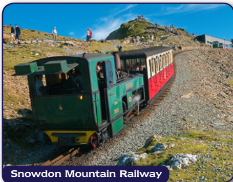
Snowdon Mountain Railway

If you've always promised yourself to 'do' all these famous railways, but never got round to it - then this is a unique opportunity to bag them all in one go. Plus enjoy fantastic lineside photo opportunities during the tour with our private coach.