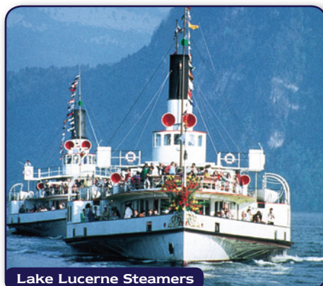
Lake Lucerne Steamers