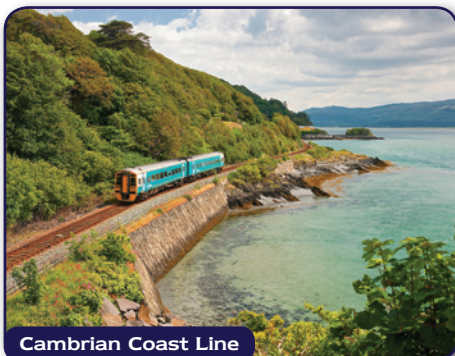
Cambrian Coast Line

The Tour Fare is exceptional value as we include Half-Board accommodation and by using University accommodation, there is no single room supplement to pay if travelling on your own. We also offer Fares ALL INCLUSIVE of rail travel from your UK 'home' station, giving you great value connecting travel too. So, book now for a wonderful 8 day 'bash' with great camaraderie!