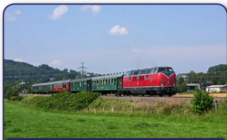
Enjoy the roar of diesel hydraulic V200-116