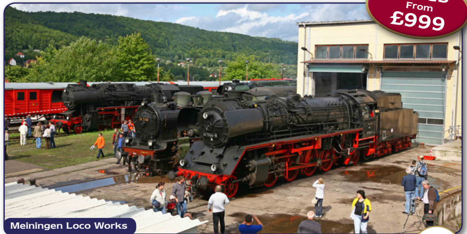
Meiningen Loco Works

A wonderful late summer break of great German steam in a variety of gauges! Amazing steam-hauled railway journeys, great photo opportunities and the best Railway Works steam show in Europe!