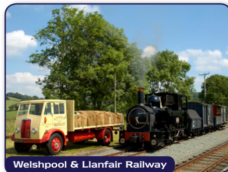
Welshpool & Llanfair Railway