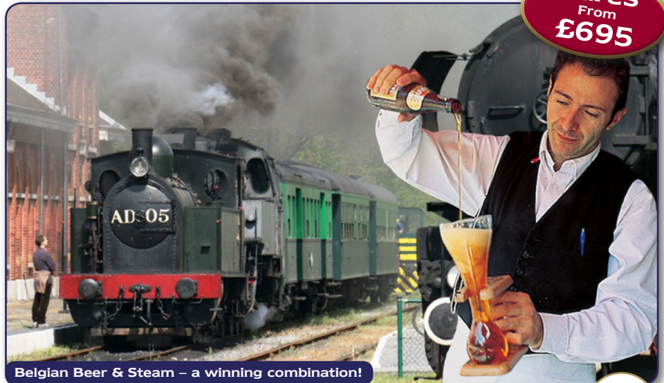
Belgian Beer & Steam – a winning combination!

An action-packed Belgian tour featuring two days at the 3 Valleys Steam Festival and much more – vintage trams, the "Little Train of Happiness", visits to a distillery and three Belgian breweries!