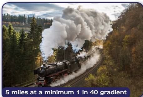
5 miles at a minimum 1 in 40 gradient