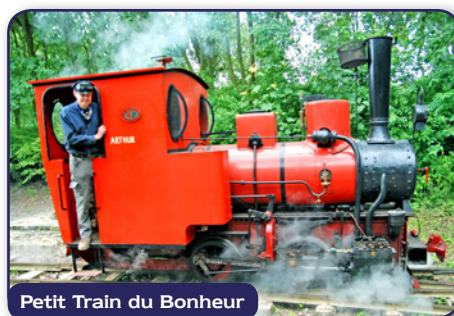
Petit Train du Bonheur