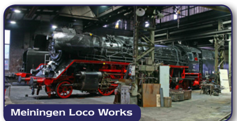
Meiningen Loco Works

Situated a short distance from the railway station, city centre and river bank, the hotel has a bar and bistro restaurant and offers bright modern en-suite bedrooms with air conditioning, TV, safe, internet access and hairdryer