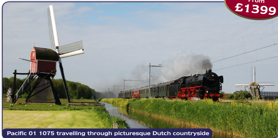
Pacific 01 1075 travelling through picturesque Dutch countryside

A very special, one-off continental rail holiday, by heritage steam & diesel locomotives from Rotterdam through Holland to Bayreuth in a First Class heritage carriage on a great railway adventure. The journey, including the scenic Rhine Gorge route, is shared by two Pacific locomotives 01 1075 from Rotterdam and 01 150 from Würzburg with heritage diesel hydraulic V200 116 hauling the middle section. We then have three days at the superb Neuenmarkt-Wirsberg Steam Festival featuring steam hauled excursions around the picturesque Northern Bavaria area as well as the fabulous festival itself plus a brewery tour! At the end of the festival we have the excitement of returning to Rotterdam again hauled by heritage locomotives in first class style.