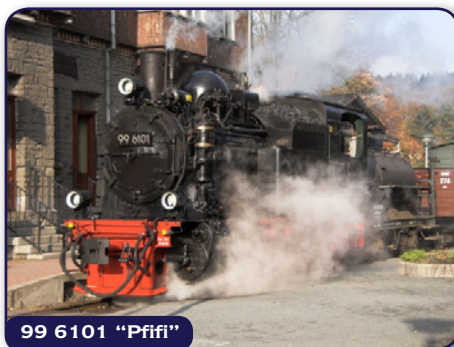
99 6101 "Pffifi"