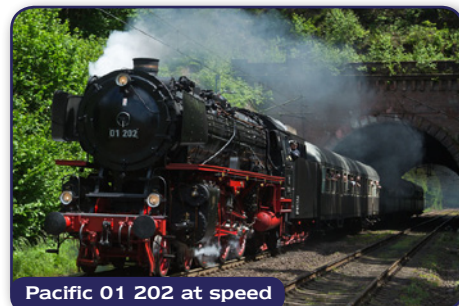
Pacific 01 202 at speed