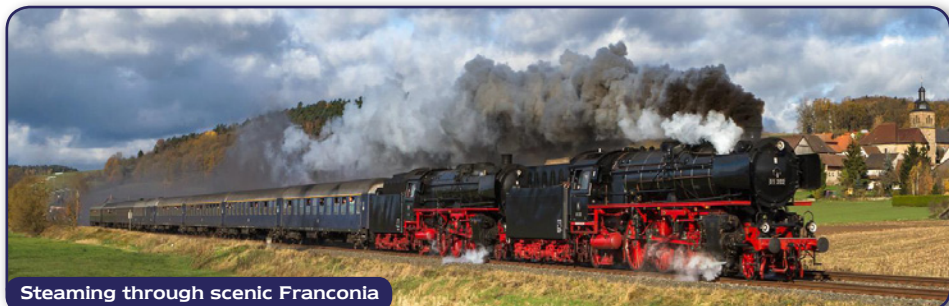
Steaming through scenic Franconia

A very special, one-off continental rail holiday, by heritage steam & diesel locomotives from Rotterdam through Holland to Bayreuth in a First Class heritage carriage on a great railway adventure. The journey, including the scenic Rhine Gorge route, is shared by two Pacific locomotives 01 1075 from Rotterdam and 01 150 from Würzburg with heritage diesel hydraulic V200 116 hauling the middle section. We then have three days at the superb Neuenmarkt-Wirsberg Steam Festival featuring steam hauled excursions around the picturesque Northern Bavaria area as well as the fabulous festival itself plus a brewery tour! At the end of the festival we have the excitement of returning to Rotterdam again hauled by heritage locomotives in first class style.