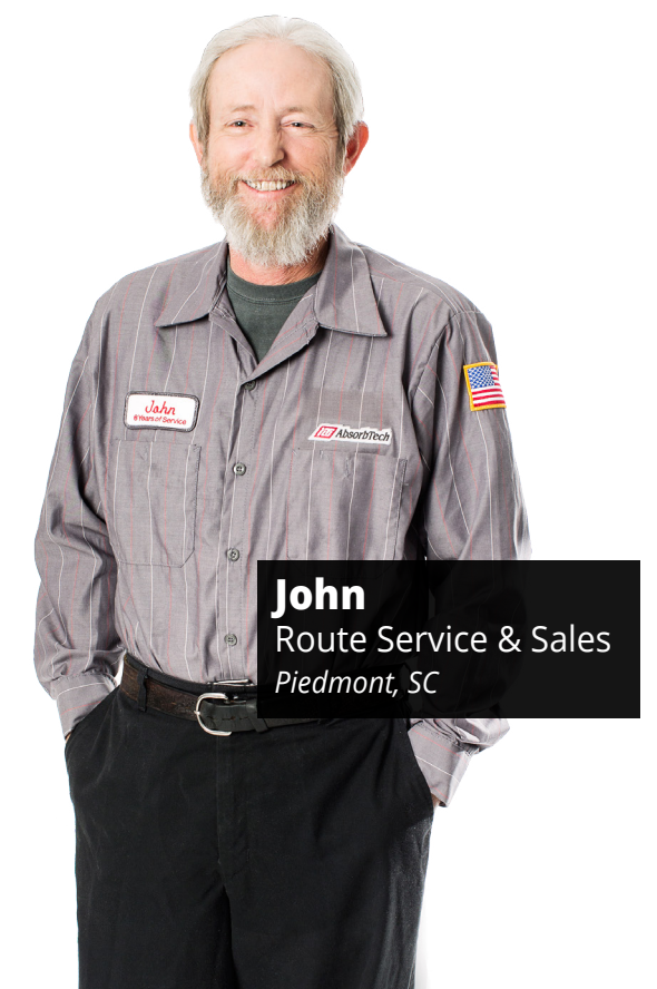
John Route Service & Sales Piedmont, SC