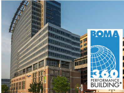
750 East Pratt Street Baltimore