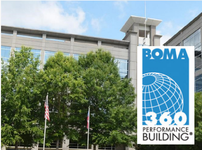
UPS Supply Chain Solutions Atlanta