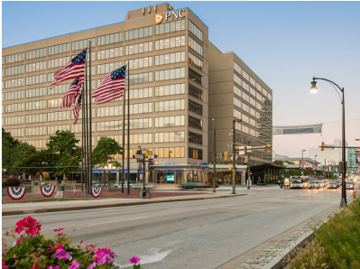
One East Pratt Street Baltimore