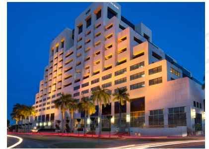
550 Biltmore Florida