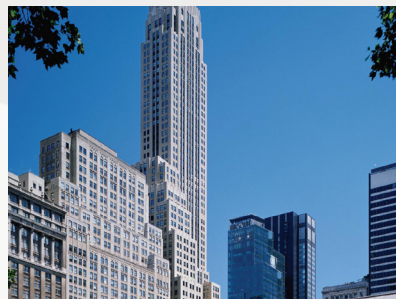
500 Fifth Avenue New York