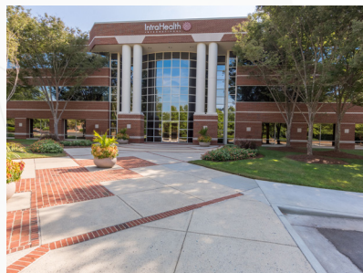
Quadrangle Four Raleigh