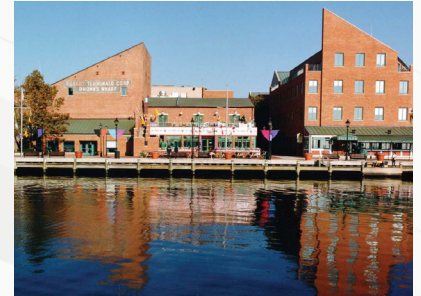
Brown's Wharf Baltimore