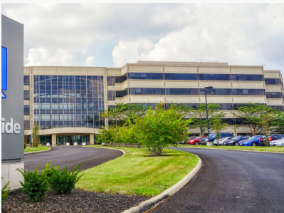
Atrium I Columbus