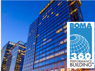
171 17 th Street Atlanta