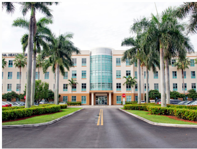
Westside Plaza Florida