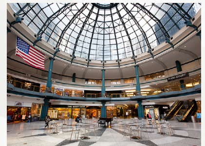
The Shops at Liberty Place Philadelphia