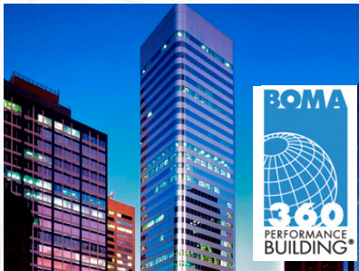
1670 Broadway Denver