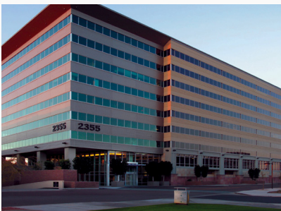
2355 Camelback Center Phoenix