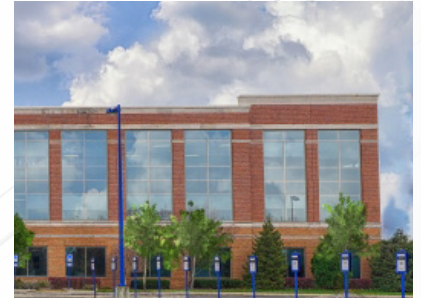
Easton III Columbus