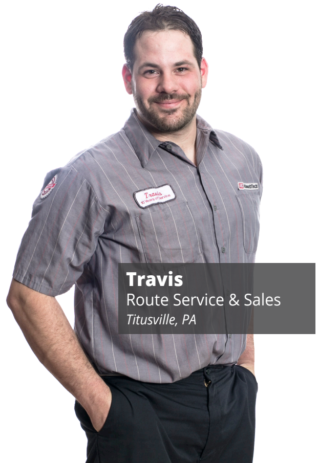
Travis Route Service & Sales Titusville, PA

How likely are you to renew your service agreement with ITU AbsorbTech?