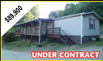
MLS# 61381 BARREN SPRINGS 3BD/2BA singlewide on 3.03 ac. Open Floor Plan. New flooring, fixtures, custom cabinets, gutters, vinyl siding.