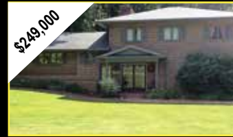
$249,000 MLS# 60651 HILLSVILLE 4BD/2 full & 2 half bath 3,542 sq.ft. brick home on 0.71 ac. 4 FP throughout. Great room, large den, partially finished bsmt, attached 2 car garage, 2 balconies & patio area. Fenced in back yard.