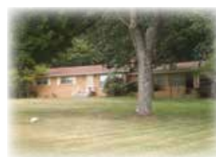
MLS# 4 DRAPER VALLEY RD. 3 bedrooms, 2.5 baths, 2616 SF on 1.01 acres.....$159,900