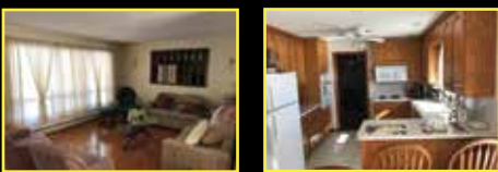
MLS# 62869 WYTHEVILLE Immaculate Brick ranch home located on a large lot. This well cared for 3Bd/1.5 Ba home has large rooms, hardwood floors & tons of natural light. Home is located in a convenient location near restaurants, 177 & 181.