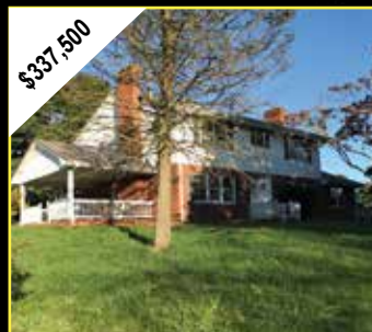
MLS# 62140 Pulaski 4BD/3BA 2-story home on 10 ac. Updated kitchen, large rooms, Large formal dining room, mature trees, paved drive. Large covered patio.