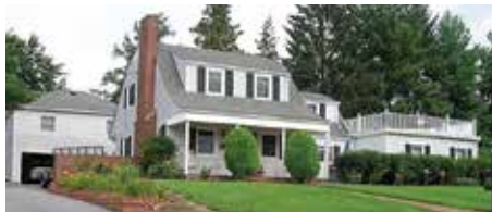
MLS# 62762 - WYTHEVILLE 4 BR, 3 BA, 3188 SF, hw/tile floors, newer paint, walk-in closets, ceiling fans, lg. master suite on main floor, chef's kitchen, 3 heat pumps, 2 water heaters, 2 car detached garage w/ furnished apartment, large corner lot. $259,000