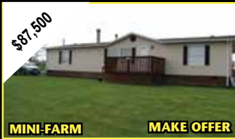
MLS# 55040 MAX MEADOWS 3 BR 2 BA home on 5 fenced acres. LR, kitchen, and DR are centrally located, 10x13 bonus room, FP, covered back porch.