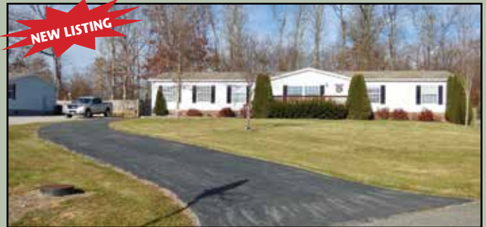
$132,500 - MLS# 62780

THIS CHARMING COTTAGE OFFERS CURB APPEAL, BEAUTIFUL HARDWOOD FLOORS, A SPACIOUS LIVING AREA, AND A WONDERFUL FENCED IN BACKYARD.