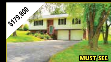
$179,900 MUST SEE MLS 61005 WYTHEVILLE 3BD/2BA immaculate home in quiet cul-de-sac. Home has been recently remodeled and has an open concept with kitchen and dining area leading into the large living room.