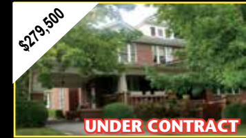
$279,500 UNDER CONTRACT MLS# 49369 RURAL RETREAT Immaculate 1925 built 5 BR 3 BA brick home on .99 acre corner lot. Carport, garage gazebo & enclosed back porch.