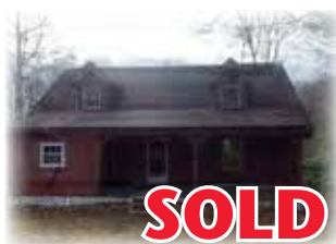
MLS# 59192 LAUREL LANE 6 bedrooms, 3 baths, 3091 SF on 4.12 acres.....$59,900