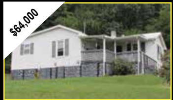
MLS# 61417 FORT CHISWELL 2BD/1BA home on 2 ac. with a great view. New windows, instant hot water, new electric and plumbing. Gas log fireplace.