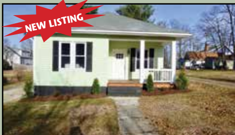
$128,000 - MLS# 62898

WELL MAINTAINED THREE BEDROOM ONE AND A HALF BATH HOME ON A CORNER LOT IN WYTHEVILLE! THE SPACIOUS LIVING ROOM BOASTS A CORNER FIREPLACE AND HUGE BAY WINDOWS.