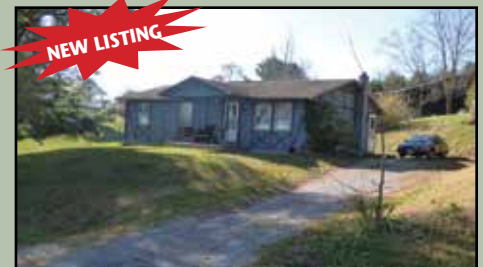
$69,900 - MLS# 62649

2BR 1 BA, COMPLETELY REMODELED, IN THE HISTORIC DISTRICT! HARDWOOD AND TILE FLOORS THROUGHOUT, HIGH CEILINGS AND AN EXPOSED BRICK CHIMNEY!