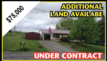
MLS# 60079 AUSTINVILLE 3BD/2BA doublewide on 0.34 ac. Full bsmt w/ 1 finished room that could be 4th BR if needed. Metal roof, attached 1 car garage, outbuilding. (Joins MLS 60078)