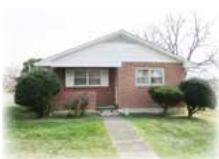
MLS# 57981 W. RIDGE RD 3 bedrooms, 2 baths, 1803 SF on 0.13 acres.....$95,400