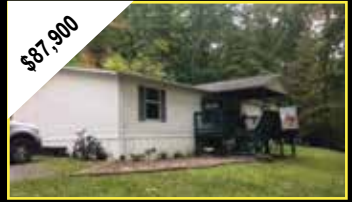
MLS# 61910 CROCKETT 3BD/2BA doublewide on 5.4 ac. Home is over 1,300 sq. ft. and it well maintained. Living room with fireplace, dining room, laundry room, split bedrooms.