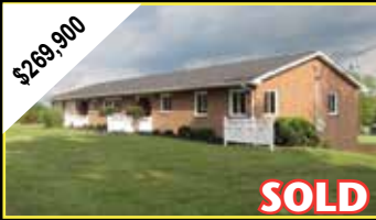
$269,900 SOLD MLS# 61715 GRAHAMS FORGE 4BD/3BA w/ almost 4000 SF on just under an acre. 2 kitchens, living, dining, 2 car garage, and more. HW floors, new heat pump, new windows.