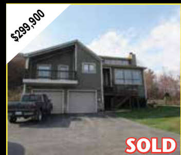
MLS# 58003 DRAPER 3BR/2.5 BA on 55 ac. with beautiful views and a great stream. Lots of space with a beautiful rock fireplace. Privacy, view, and wildlife to enjoy.