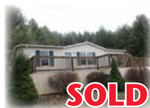
MLS# 58908 PHILLIPS RD. 3 bedroom, 2 bath, 1080 SF on 1.92 acres.....$55,900