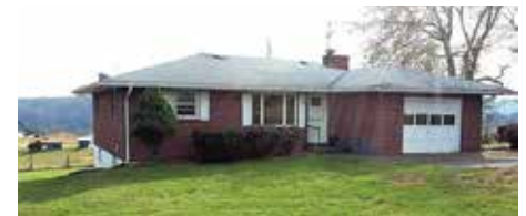
MLS# 62759 - DRAPER 2 BR, 1 BA, 1026 SF, 1.04 acre level lot, hw/tile floors, attached garage, within minutes of the New River, beautiful setting, priced below tax assessment.