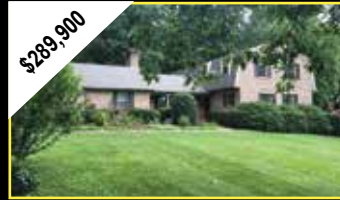
$289,900 MLS# 56422 WYTHEVILLE 4BR/2.5BA with huge updated kitchen. Full basement and 2 car garage. Private street with paved driveway