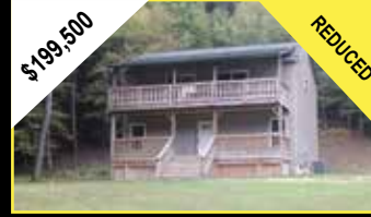
$199,500 REDUCED MLS# 61895 Dublin 3BD/2.5BA cabin on 5 ac. joining Little Creek and Jefferson NF. Master has Jacuzzi and tiled shower. 1 car detached garage and RV hookup.