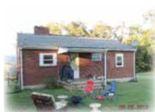
MLS# 57807 PEPPERS FERRY RD. 2 bedrooms, 1 bath, 972 SF on 0.64 acre.....$96,500