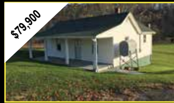
MLS# 62505 FORT CHISWELL 1BR/1BA Cottage on 3.25 ac. 686 SF, built in 1949 & completely remodeled. Close to The New River Trail & has plenty of room for expansion.