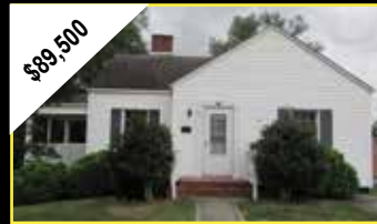
MLS# 61272 WYTHEVILLE 2BD/1BA Home on 0.23 ac. Newer kitchen, newer heat pump, new tilt windows, basement.