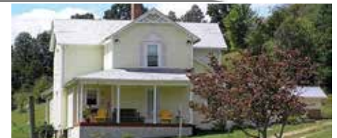
MLS# 62650 - CROCKETT 4 BR, 2.5 BA, 2417 SF, remodeled farm house, hw/tile flooring, master suite on both levels, lg open fam room, on 49 acres w/ multiple fenced pastures, horse stalls, private setting. $569,000