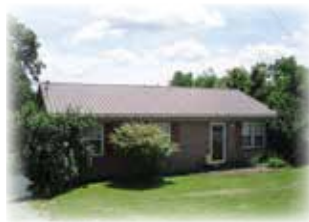
MLS# 56339 HOLSTON RD. 3 BR, 1 BA, 1000 SF on 0.50 acres.....$127,400