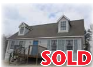
MLS# 58817 LAUREN KNOB DR. 2 bedroom, 1 bath, 988 SF on 6.09 acres.....$60,000