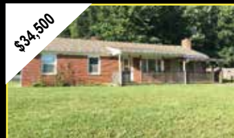
MLS# 56921 FRIES 3 BR, 1 BA brick ranch w/ newer roof and heat pump. Open deck & multiple outbuildings. Near NR & NR Trail. Below tax assessment!

The house you looked at today and wanted to think about until tomorrow may be the same house someone looked at yesterday and will buy today. - Peter Altieri