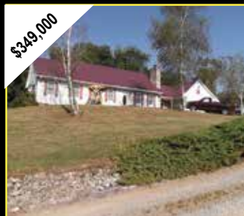
MLS# 57298/57216 SALTVILLE 6 or 12 acres. HW floors, 2 stone FPs, 2 wood stoves. Jacuzzi tub. 5 BR, 4.5 BA. Pool, deck, pool house, 2 car garage. 2 add'l homes. Price of all 12 acres is $449,000