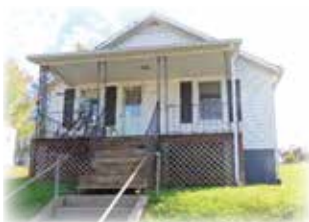
MLS# 63547 ELIZABETH STREET 2 bedroom, 1 bath, 960 SF.....$26,400