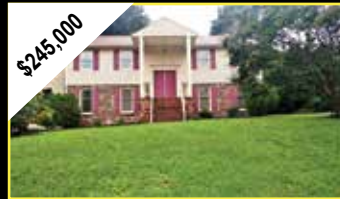
$245,000 MLS# 61791 CHESTER 5BD/3BA tri-level home on 0.45 ac. 2,500+ SF of finished living space with mudroom, office, and a pool out back with deck area surround.