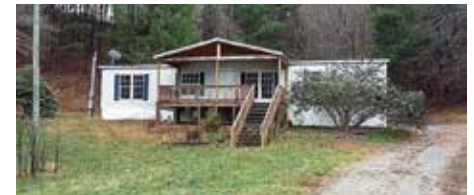
MLS# 62832 - FRIES 3 BR, 2 BA, Doublewide, 1104 SF, 1 acre mostly wooded lot, covered porch, wood burning fireplace, heat pump. $19,900