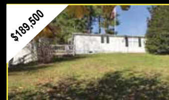
$189,500 MLS# 62478 BLAND 3BR/2.5BA home with open, split floor plan. Home has 2520 SF, sits on 1 acre of land & has a 2 car garage. This is a must see if you want privacy & space.