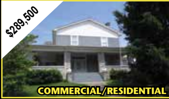
$289,500 COMMERCIAL/RESIDENTIAL MLS# 61360 WYTHEVILLE 5BR/3.5BA colonial on 0.9 ac. Would make a great bed & breakfast. 2 family rooms, dens, sunroom, kitchen, dining, mudroom.