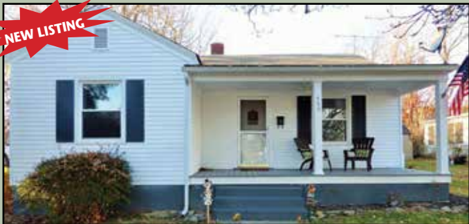
$134,950 - MLS# 62801

IF YOU ARE READY TO ENJOY COUNTRY LIVING, THEN THIS HOME HAS IT ALL! THIS 3 BEDROOM 2 BATH LOG HOME HAS PLENTY OF ROOM FOR YOU AND YOUR FAMILY INSIDE AND OUT.