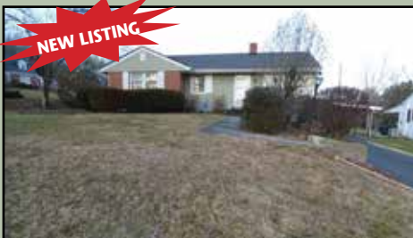
$129,000 - MLS# 62880

OVER 2000 SQ. ST. OF LIVING SPACE, 4BR/2 BATH, BEING OFFERED AT A REDUCED PRICE. DOUBLEWIDE ON A PERMANENT FOUNDATION FEATURES A SEPARATE LIVING ROOM AND FAMILY ROOM.