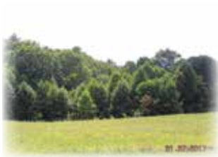
MLS# 61302, 62303, 61305 STONE RIDGE RD. 0.52 acre lot, 0.53 acre lot, 0.51 acre lot.....$11,000 EACH