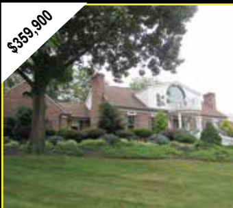
MLS# 61366 WYTHEVILLE 4BD/3.5BA on 1.24 ac. joining the Golf Course. Corian counter tops, newer appliances, very open kitchen, foyer, & living.