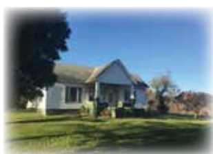
MLS# 62453 LEE HWY 3 bedroom, 1.5 baths, 1737 SF on 2.25 acres.....$26,400