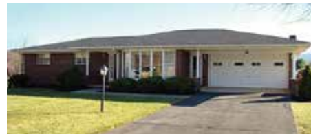
MLS# 62763 - WYTHEVILLE 3 BR, 1 Full BA, 2 Half BA, 1838 SF, 1 level living, newer paint, walk-in closets, laminated wood floors, bsmt w/ workshop & ½ bath can be finished for add'l living space, sun room, large private back yard. $215,000