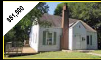
MLS# 61287 RURAL RETREAT 2BD/1BA cottage on 0.4 ac. Upstairs plumbed and ready for 3rd BR & BA. Newer tilt windows, arched doorways, side deck.