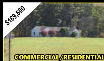
$189,500 COMMERCIAL/RESIDENTIAL MLS# 57945 WYTHEVILLE 2BD/1BA home on 6.08 ac. All on one level, can be used for residential or commercial. Minutes from I-81/I-77 corridor.