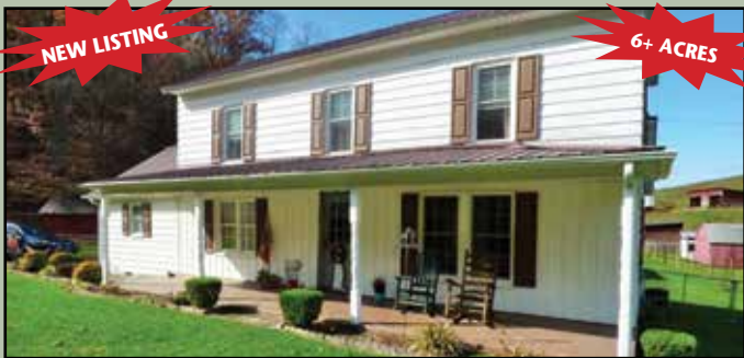
$192,500 - MLS# 62676

HERE'S YOUR CHANCE AT A GREAT MINI-FARM IN SMYTH COUNTY. BEAUTIFUL HARDWOOD FLOORS, SIZEABLE ROOMS AND TILED BATHROOMS. LAUNDRY IS LOCATED ON THE MAIN LEVEL.