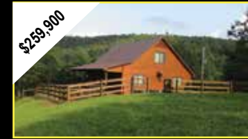
$259,900 MLS# 62305 GRAYSON 2BR/1BA Log home on 2 acres on a private setting. Home has lots of character throughout, 2 large hay stalls, located at Virginia Highlands Horse Trail. Property also joins Jefferson NF on 3 sides.