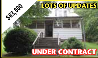
MLS# 56674 IVANHOE RD 4 BR w/ HW floors, 4 acres partially fenced. Multiple outbuildings & separate home that needs some TLC. Located near Horse Trails!