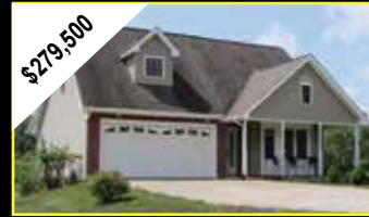
$279,500 MLS# 61006 WYTHEVILLE 3BD/2.5BA 3,243 sq.ft. home on 3.53 ac. which has been zoned AG in town! Custom kitchen with granite counters and center island. Full finished basement.