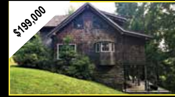
$199,000 MLS# 61098 WOODLAWN Custom Log Cabin in the woods, garden area. 2BD/2.5BA home on 3.1 ac. Overlooking a brook and small pond on the property.