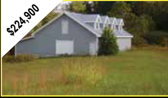
$224,900 MLS# 57728 - IVANHOE 20.34 acres of land with an immaculate barn on site. Land is mostly cleared and has beautiful panoramic views. Barn could be converted to living quarters.