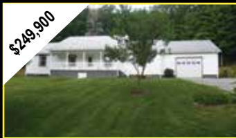
$249,900 MLS# 61737 FORT CHISWELL 3BD/2BA ranch on 8.5 ac. w/ farmhouse style kitchen. Metal roof and pool out back. Oversized garage. Heat pump and gas logs.