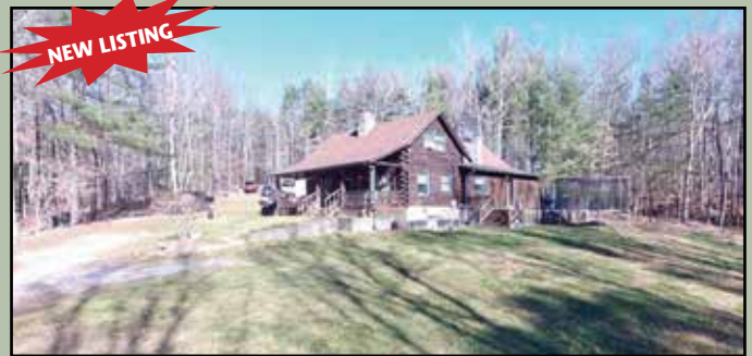
$174,500 - MLS# 62842

HERE'S YOUR CHANCE AT A GREAT MINI-FARM IN SMYTH COUNTY. BEAUTIFUL HARDWOOD FLOORS, SIZEABLE ROOMS AND TILED BATHROOMS. LAUNDRY IS LOCATED ON THE MAIN LEVEL.