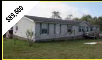
MLS# 62123 MAX MEADOWS 4BD/2BA doublewide on 5.07 ac. Living and family room with fireplace. 20x12 Building, and 10x10 Outbuilding and chicken coop.