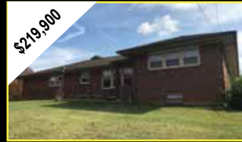
$219,900 MLS# 62483 WYTHEVILLE 3BR/3BA home located on a large lot in town limits. Close to grocery store, restaurants, & local high school. Large LR, large DR, a formal DR & a large MBR.