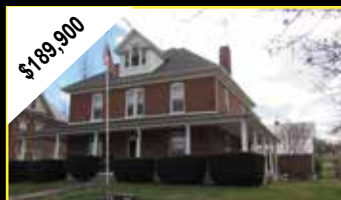
$189,900 MLS# 53654 RURAL RETREAT 5 BR, 2 BA brick colonial w/ over 4200 SF of living space, library, & sunroom. 2 car detached garage & possible inlaw area.