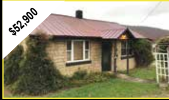
MLS# 62524 FORT CHISWELL 2BR/1BA Ranch style home on 0.4 acres. Great starter home/investment property. Some remodeling done, needs some TLC.