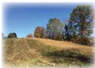
MLS# 62455 OLD 52 1.5 acre commercial, just seconds from I-77.....$239,000