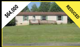
MLS# 60916 GALAX 3BD/2BA doublewide on 2.88 ac. Level yard. Large living room with wood burning FP. MBA has garden tub and large vanity. Eat in kitchen with lots of room and character.