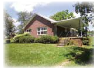
MLS# 60637 W. LEE HWY 3 bedrooms, 2 bath, 1315 SF on 1.6 acre.....$114,000