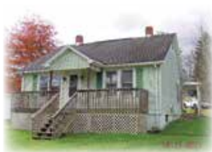
MLS# 62576 FORT CHISWELL ROAD 3 bedrooms, 1.5 baths, 1460 SF on 0.60 acres.....$90,000