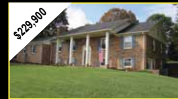
$229,900 MLS# 62257 Wytheville 5bd/3ba Split foyer on 2 building lots (1.16ac) & is in the Country Club. Updated kitchen with center island. Living room & family room with fireplace. 2 car garage.