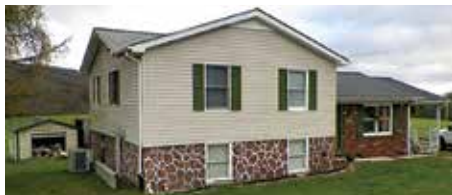
MLS# 62667 - WYTHEVILLE 2 BR, 2 full BA, 1 half BA, 1688 SF, 3 acres, newer paint & floor covering, laminated wood floors, walk-in closets, spacious LR, large deck, side porch, outbuildings, detached garage. $215,000