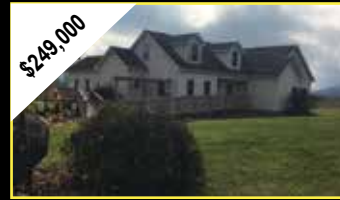
$249,000 MLS# 62418 RURAL RETREAT Large 4BR/4.5BA home with full bsmt ready to be finished for even more living space. This home sits on 1.24 acres & has 3389 SF. Priced well below tax assessment.