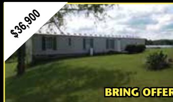
MLS# 60080 MAX MEADOWS 3BD/1.5BA singlewide on 2.35 ac. Open concept. Newer laminate in part of the home. New back deck. Heat pump and propane backup.