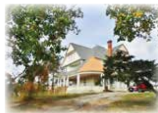
MLS# 58041 4TH ST. 5 bedrooms, 2.5 bath, 3492 SF on 0.95 acre.....$144,200