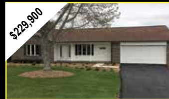
$229,900 MLS# 58567 WYTHEVILLE 3 BR/2 BA brick/vinyl ranch 0.72 ac. In Wytheview subdivision. Full finished bsmt has an option for 4th BR, or add'l living space. Deck w/ immaculate mtn views, outbuilding, and attached garage.