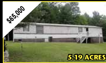
MLS# 60366 MAX MEADOWS 2BD/2BA singlewide on 5.19 ac. Heat pump, 2 full BA, lots of cabinetry, large kitchen, master with glamour bath. Detached building and 2 car carport.