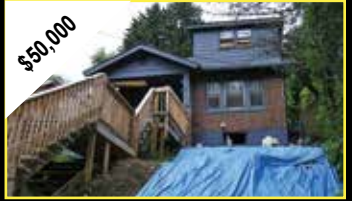
MLS# 60655 PULASKI 4 BR/1 BA 1598 SF home in town.