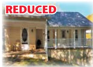
MLS# 60125 EASTVIEW ST. 2 BR, 1.5 baths, 858 SF on 1.01 acres.....$87,700