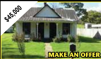
MLS# 59979 CRIPPLE CREEK 3BD/1BA home on 0.75 ac. with a creek. Near horse trails and National Forest. Outbuilding.