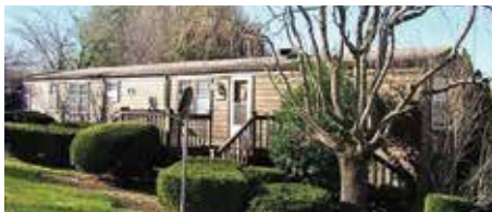
MLS# 62621 - WYTHEVILLE 2 BR, 2 BA, 1064 SF, Singlewide, move-in ready, laminated wood floors, permanent foundation, ¼ ac. lot, country setting, storage bldg w/ built-in studio, lg decks. $59,900