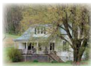
MLS# 46239 FELTS LANE 2 BR, 1.5 BA, 1260 SF on 12.07 acres.....$144,000