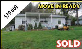
MLS 59875 HILLSVILLE 3BD/1.5BA home on 0.36 acres 1 mile from downtown. New metal roof, 2 outbuildings, Master suite with 1/2 bath and walk in closets in every BR. Huge pantry, and formal dining room.