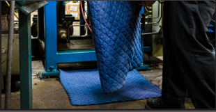
Sorbblts® Oil Absorbents