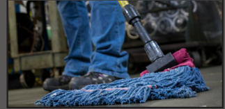
Wet & Dust Mops