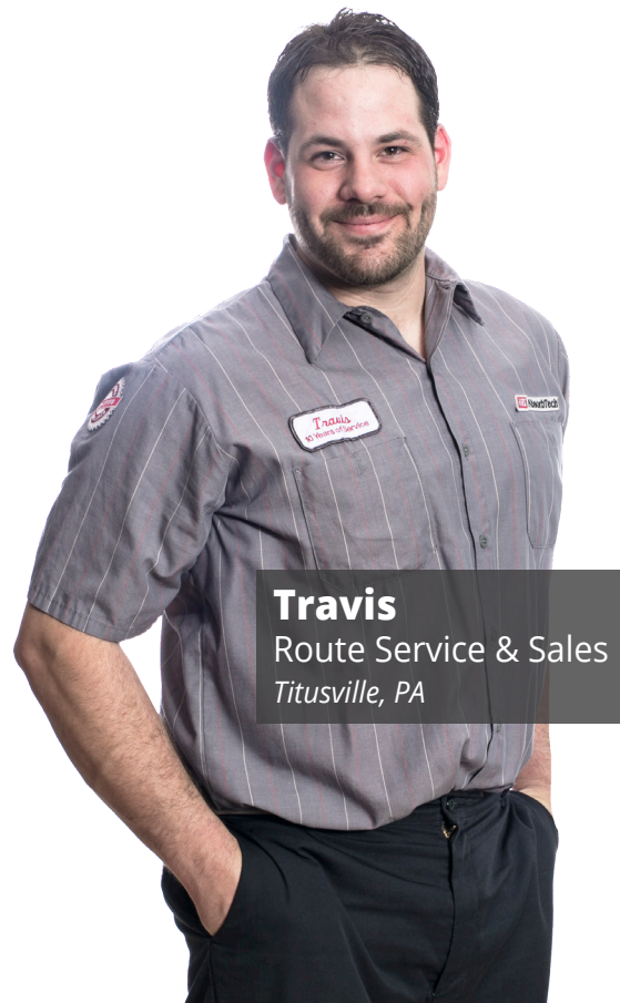
Travis Route Service & Sales Titusville, PA

How likely are you to renew your service agreement with ITU AbsorbTech?