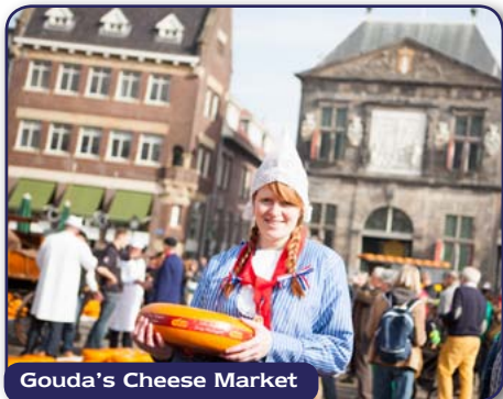
Gouda's Cheese Market

We journey to Keukenhof , "the most beautiful spring garden in the world", open just a few weeks each year, where awesome swaths of tulips, crocuses and daffodils burst out of the rolling countryside. Huge rivers of colour beneath great avenues of trees: some of the world's greatest collection of bulbs including