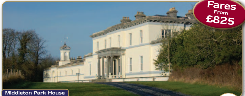
Middleton Park House