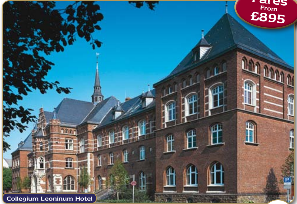
Collegium Leoninum Hotel