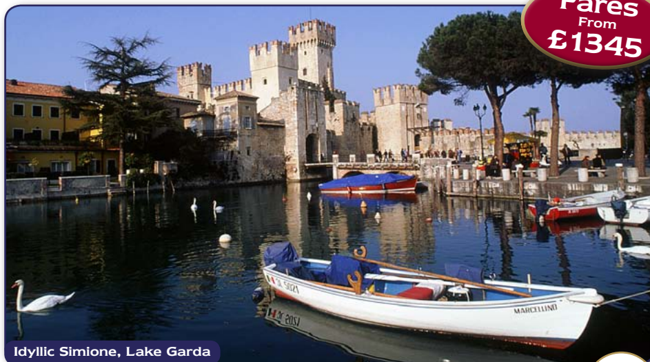
Idyllic Sirmione, Lake Garda

the head of a narrow peninsula. Surrounded on three sides by Lake Garda's tranquil waters, Sirmione's fortified walls protect an Old Town of medieval streets and squares, with the lakeside never far away. A perfect place to sample an ice cream and watch the world go by. (B,D)