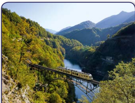
Centovalli... The railway of a hundred valleys

A day at leisure in Belgirate allows you to explore the attractive village and lakeside promenade. Alternatively, travel the short distance to Stresa to take the cable car high up above the town to Mottarone for great views of the region. (B,D)