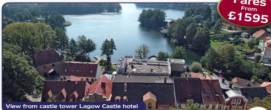
View from castle tower Lagow Castle hotel

A completely new tour looking at Poland and Berlin today and yesteryear based in central Berlin and an idyllic castle in Poland. View the great sites of Berlin and also tour World War II venues such as POW camp Stalag Luft III – Treat yourself to a Great Escape!