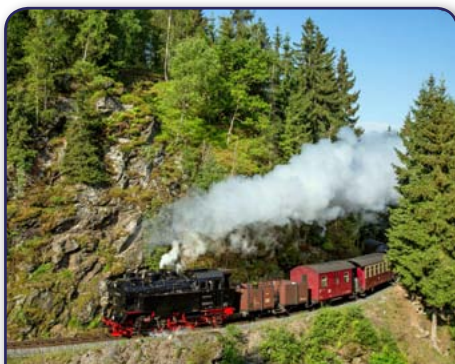
Steaming through the idyllic Selkethal valley

The sound of the powerful steam locomotive reverberates around the valley sides as we climb steeply, through deep forests, to the summit of Brocken Mountain formerly occupied by 2,000 Russian soldiers and spy cameras overlooking the border to the west.