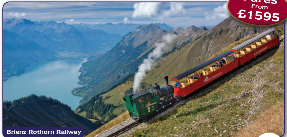
Brienz Rothorn Railway

Switzerland and steam trains - a delightful combination as we take you to the heart of this beautiful country to experience some amazing mountain rail journeys and glorious lake steamer cruises.