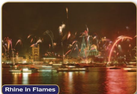
Rhine in Flames

A day at leisure to explore Bonn further. Alternatively, a short train ride northwards takes you to Cologne, with its masterpiece