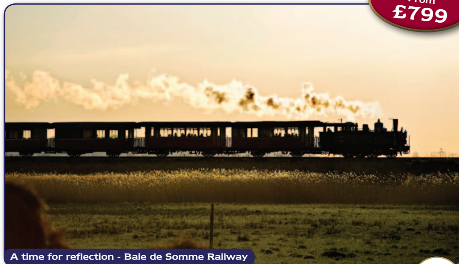
A time for reflection - Baie de Somme Railway

Explore rural and coastal northern France on the region's superb preserved narrow gauge steam railways, combined with a day in Paris, a tour of the cathedral city of Amiens and visits to the poignant battlefields of World War I.