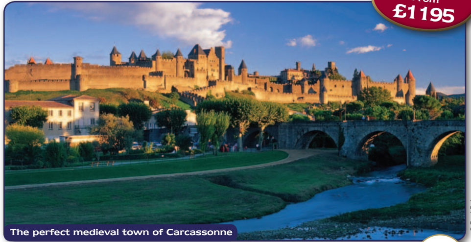
The perfect medieval town of Carcassonne

Travel in First Class style to the South of France. Relax in a beachside hotel, explore the rocky coves of the Catalan Coast, tasting local specialities, visit colourful Barcelona, the Pyrenees and the perfect medieval walled city of Carcassonne.