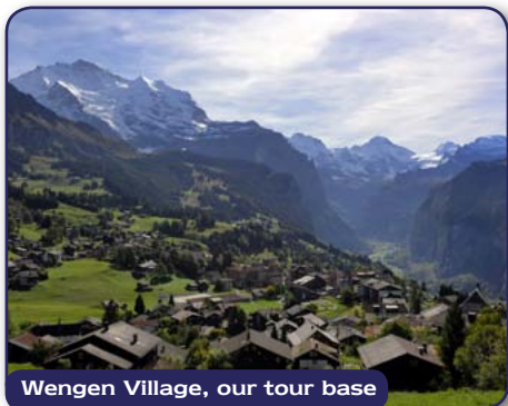
Wengen Village, our tour base

Joining a train to Thun, we set sail on Lake Thun towards Interlaken. On arrival we catch