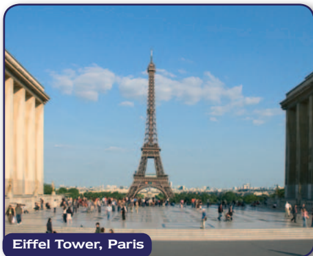
Eiffel Tower, Paris

After breakfast we travel to Noyelles to enjoy the entire length of the Baie de la Somme Railway . We steam around the bay to the resort of Le Crotoy , with free time to stroll along the harbour and promenade, or enjoy