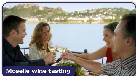
Moselle wine tasting

Today we make the short journey around the headland along the Rhine to Rudesheim , arguably the most famous village in the Rhine Valley. Here you will have free time to explore the beautiful quaint Drosselgasse, where you will find enticing speciality shops featuring the locally produced Riesling wine, and maybe visit Siegfried's Mechanical Music Museum, which houses 350 self-playing musical instruments spanning three centuries. We meet for a rustic-style lunch in a local wine cellar , where we also enjoy a tour and tasting of three local wines . (B,L,D)