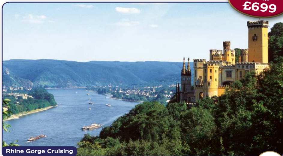
Rhine Gorge Cruising

Stay in a wine village at the heart of the Rhine Gorge, exploring the romantic Rhine and Moselle Valleys by rail and riverboat, and visiting a wide variety of winemakers to discover the region's wealth of wine culture.