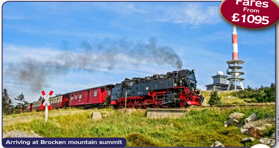
Arriving at Brocken mountain summit

A First Class rail holiday to enjoy picturesque towns and villages surrounded by a panoramic range of rocky crags romantic valleys, and fairytale woods - full of folklore, witches and steam trains.