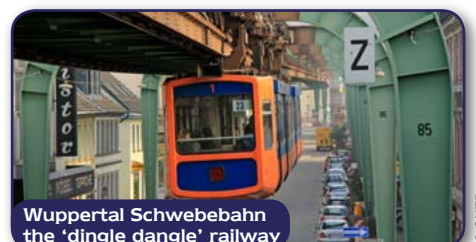
Wuppertal Schwebebahn the 'dingle dangle' railway

This stylish, English-speaking, 4 star hotel is close by the historic Old Town, and features modern, comfortable en-suite rooms. Enjoy culinary delights in the buffet restaurant and relax in the Berliner Ziller bar or Top Fit Club.