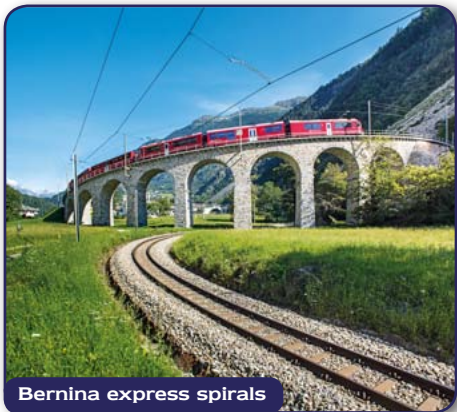
Bernina express spirals

One of the great railway journeys of the world awaits today. First we leave Lake Geneva,