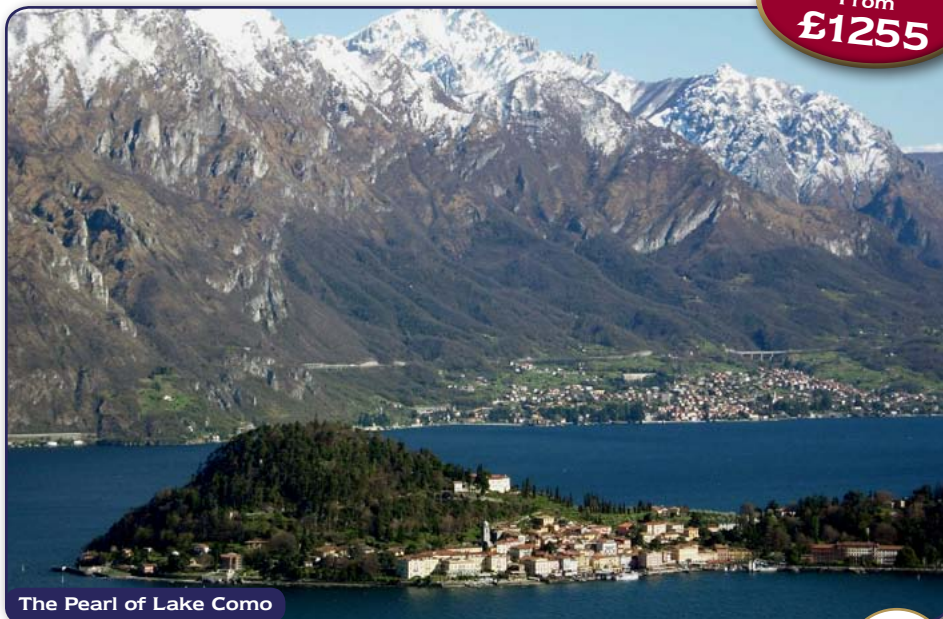
The Pearl of Lake Como