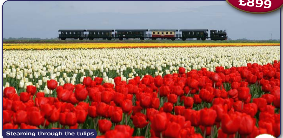
Steaming through the tulips