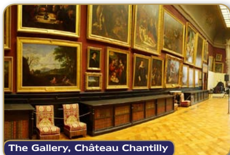
The Gallery, Château Chantilly