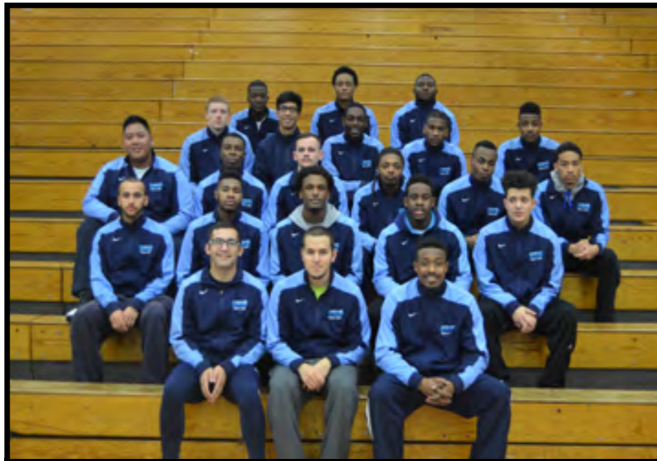
2016 MEN'S ROSTER

TWITTER: @PEACOCKNATION FACEBOOK: /SAINTPETERSATHLETICS