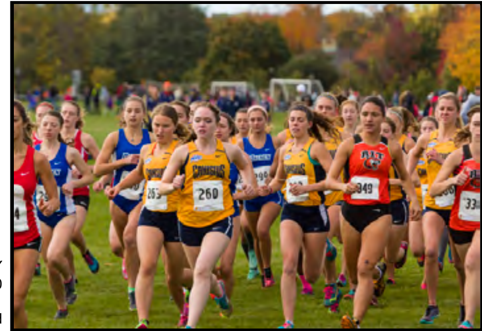
2016 WOMEN'S ROSTER