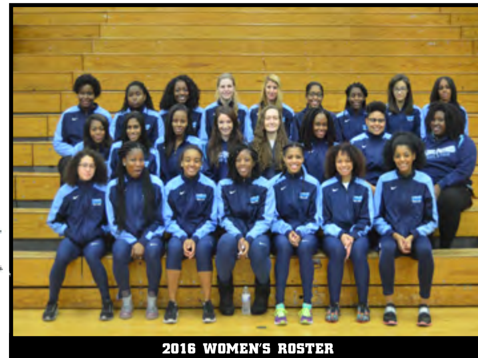
2016 WOMEN'S ROSTER

TWITTER: @PEACOCKNATION FACEBOOK: /SAINTPETERSATHLETICS