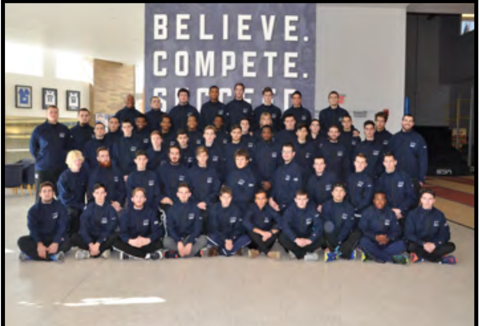
2016 MEN'S ROSTER