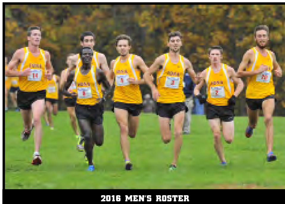
2016 MEN'S ROSTER