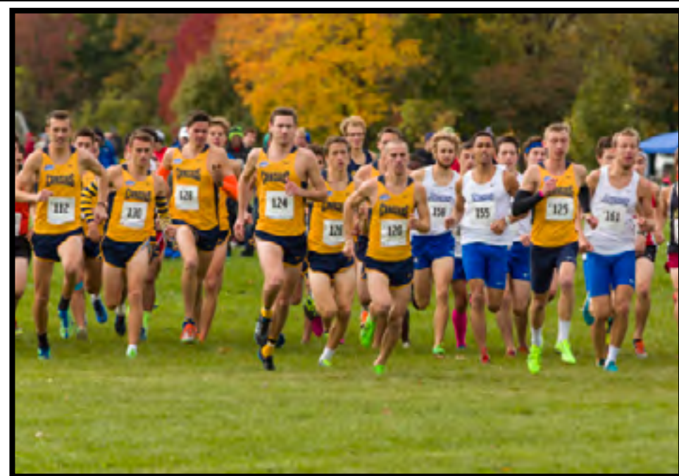
2016 MEN'S ROSTER