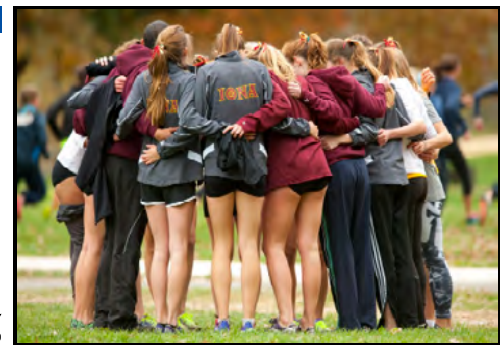
2016 WOMEN'S ROSTER