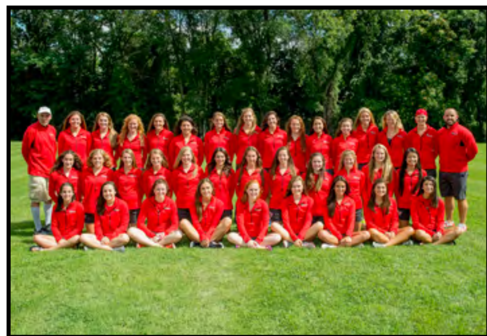
2016 WOMEN'S ROSTER