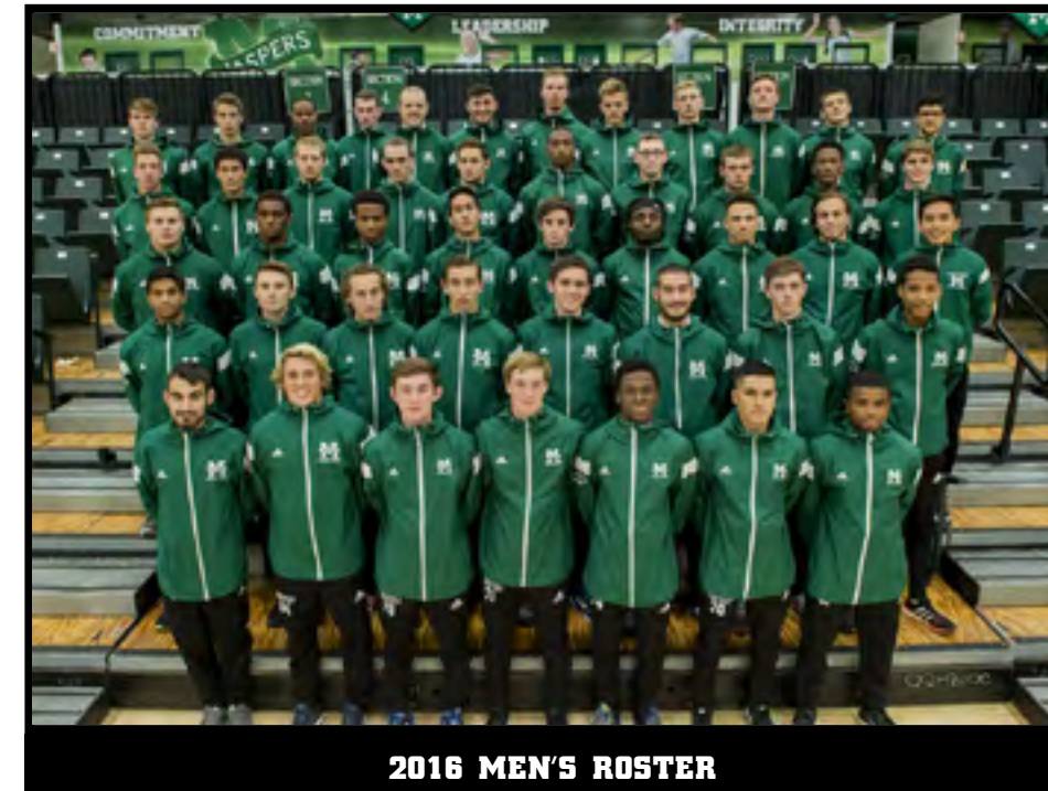
2016 MEN'S ROSTER