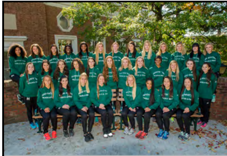
2016 WOMEN'S ROSTER