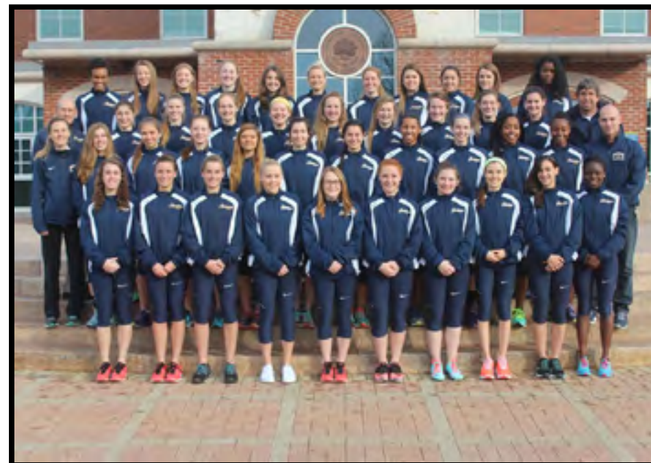
2016 WOMEN'S ROSTER

TWITTER: @QUATHLETICS FACEBOOK: /QUATHLETICS