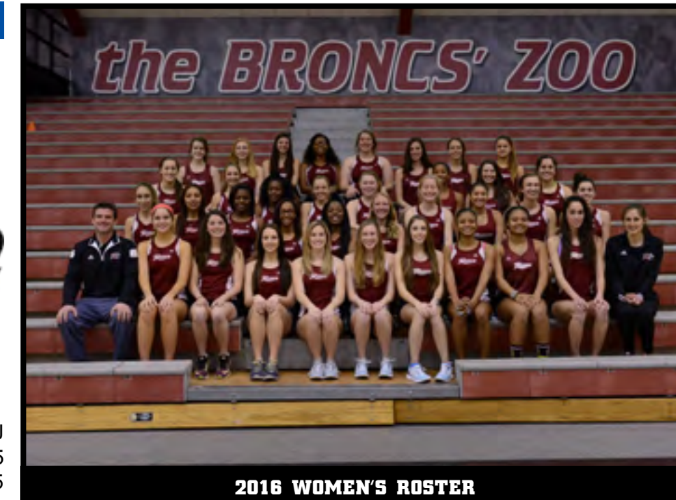
2016 WOMEN'S ROSTER