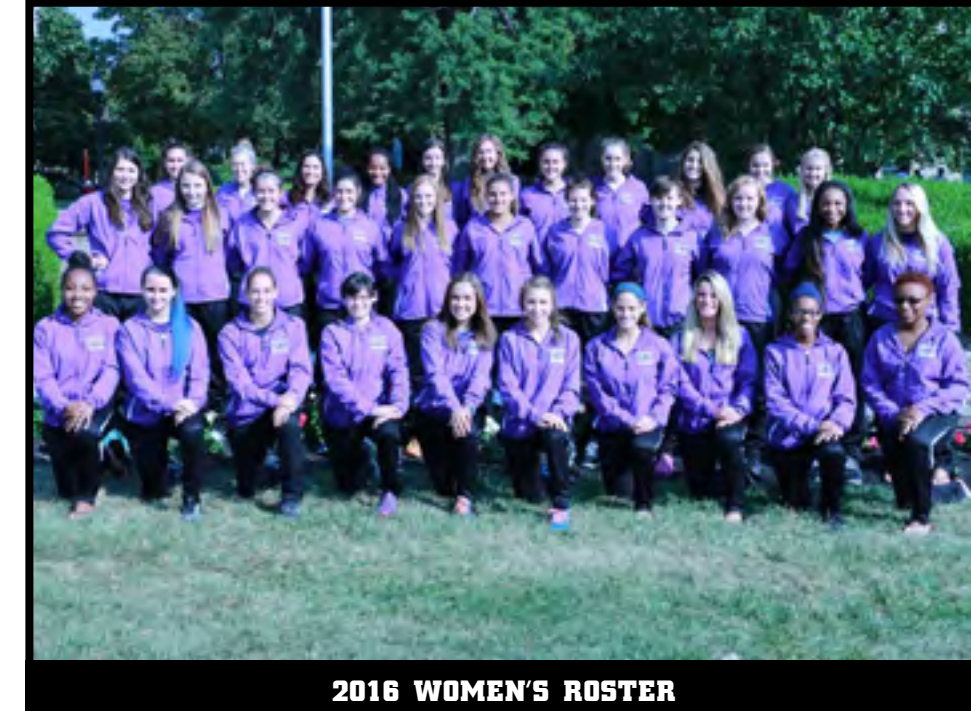
2016 WOMEN'S ROSTER