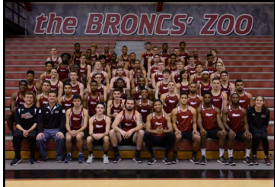
2016 MEN'S ROSTER

MONMOUTH UNIVERSITY WEBSITE MONMOUTHAWKS.COM 2016 SCHEDULE/RESULTS PLAYERS OF THE WEEK 2016 CHAMPIONSHIP INFORMATION MAAC CHAMPIONSHIP HISTORY TWITTER: @MUHAWKS FACEBOOK: /MONMOUTHAWKS