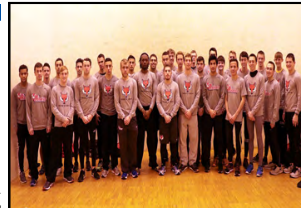
2016 MEN'S ROSTER

TWITTER: @MARISTATHLETICS FACEBOOK: /GOREDFOXES