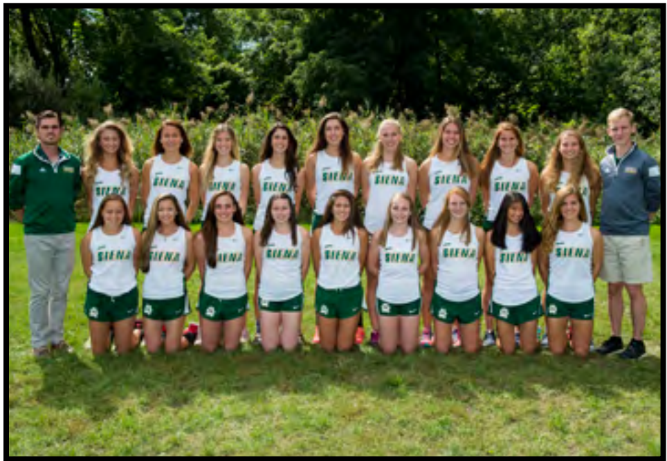
2016 WOMEN'S ROSTER