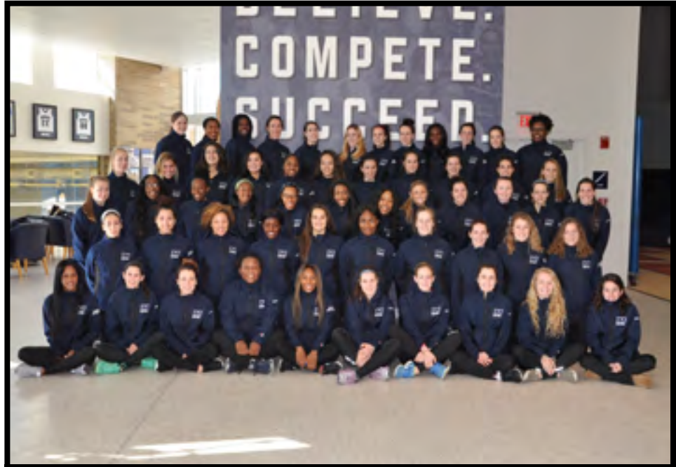
2016 WOMEN'S ROSTER

MONMOUTH UNIVERSITY WEBSITE MONMOUTHAWKS.COM 2016 SCHEDULE/RESULTS PLAYERS OF THE WEEK 2016 CHAMPIONSHIP INFORMATION MAAC CHAMPIONSHIP HISTORY TWITTER: @MUHAWKS FACEBOOK: /MONMOUTHAWKS