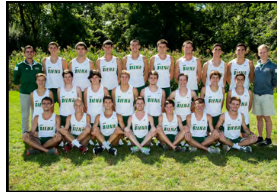
2016 MEN'S ROSTER

TWITTER: @SIENASAINTS FACEBOOK: /SIENASAINTS