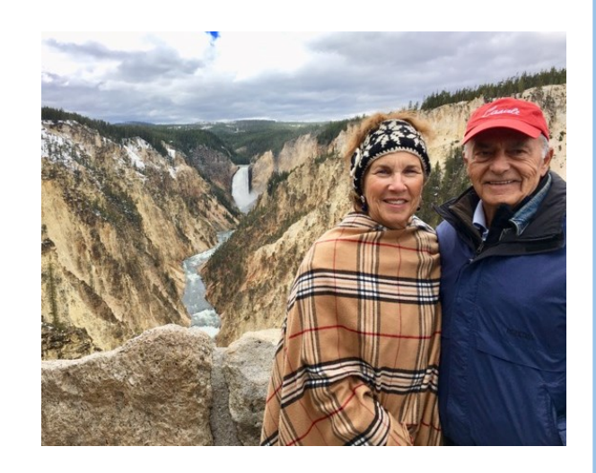
"Grand Canyon" of Yellowstone National Park