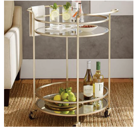
With its gleaming gallery rails, casters and mirrored shelf, this cart exhibits the sophisticated presence of mid-20th-century design. POTTERY BARN | $399 | potterybarn.com