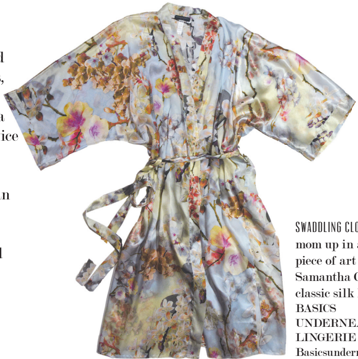
SWADDLING CLOTHES: Wrap mom up in a stunning piece of art in this Samantha Chang classic silk kimono. BASICS UNDERNEATH FINE LINGERIE | $365 | Basicsunderneath.com

But don't forget about some additional ways to make a unique statement for that unique woman in your life.