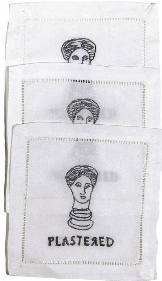
WITTY PUNS FOR COCKTAIL FUN BOX OF FOUR EMBROIDERED NAPKINS HAZELNUT | $38 | hazelnutneworleans.com