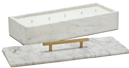
BOXED IN BEAUTY: A marble box candle does dual duty – beautiful fragrance and light, plus a lasting objet d'art. Louisiana-made by Nouvelle. JADE | $280 | jadenola.com