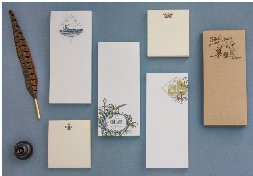
SPREAD THE NOLA LOVE BIG EASY INSPIRED LIST AND NOTE PADS SCRIPTURA | From $9 | scriptura.com