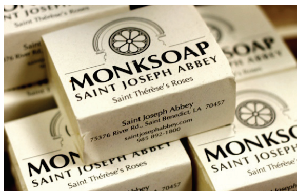
HARD BAR: Monksoap from the brothers at St. Joseph Abbey on the north shore make this hard-working cleansing bar that yields soft skin. SIMPLY SOUTHERN | $6 | simplysouthern.com