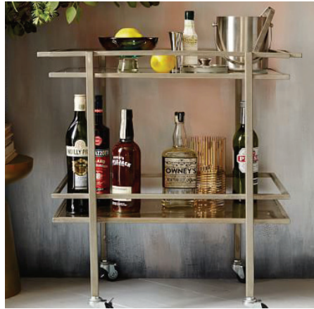
Love this angular art deco silhouette in antiqued pewter WEST ELM | $499 | westelm.com