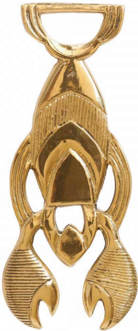
PRACTICAL AND PRETTY-BRASS CRAWFISH BOTTLE OPENER JADE | $32 | jadenola.com