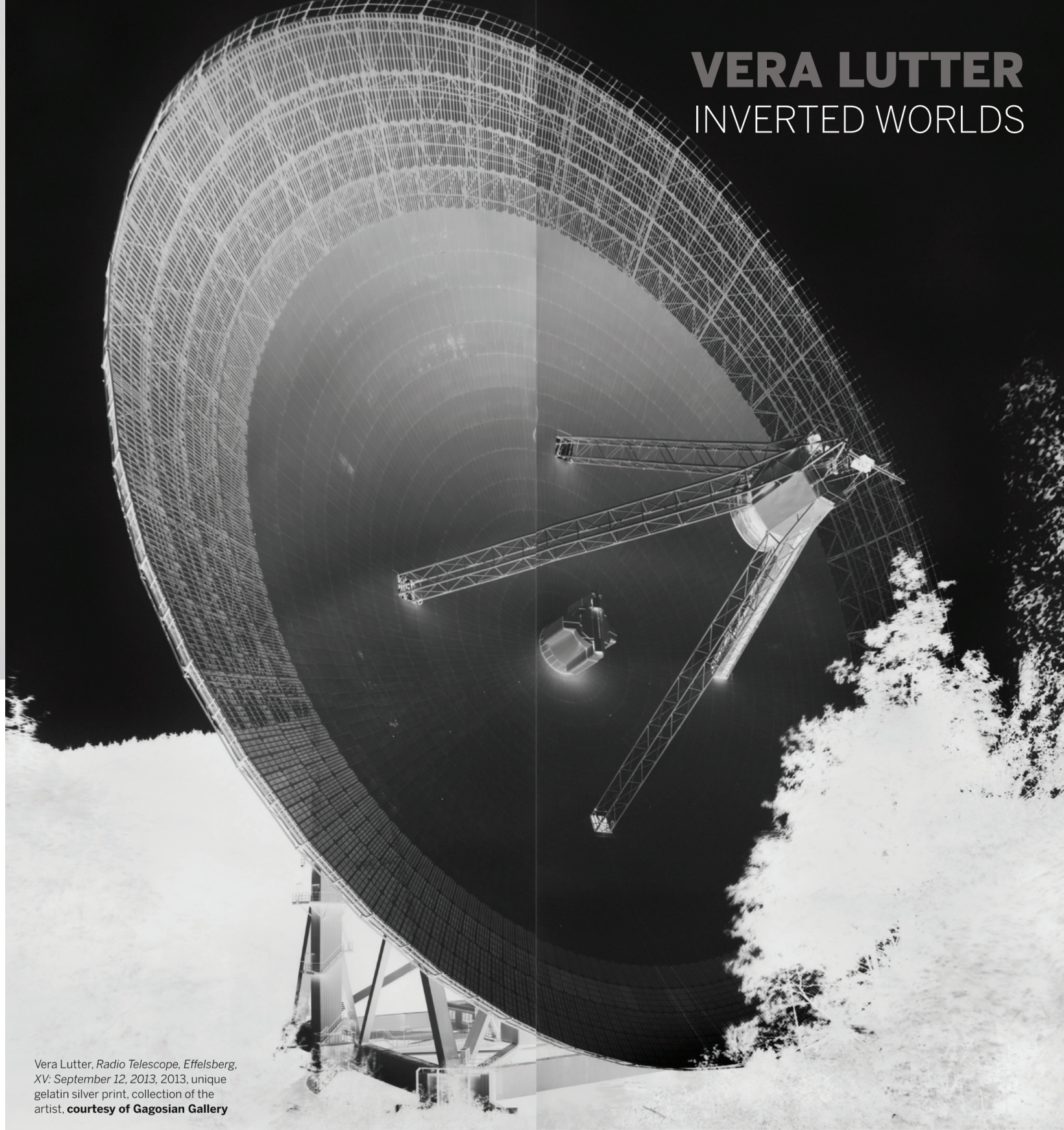
Vera Lutter, Radio Telescope, Effelsberg , XV: September 12, 2013 , 2013, unique gelatin silver print, collection of the artist