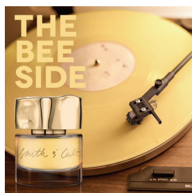
TOUGH AS NAILS: Smith and Cult's Nailed Lacquer has colors to make the most of a relaxing manicure or pedicure. EMBODIMENT SALON | $25 signature manicure | $50 signature pedicure | Embodymentsalon.com