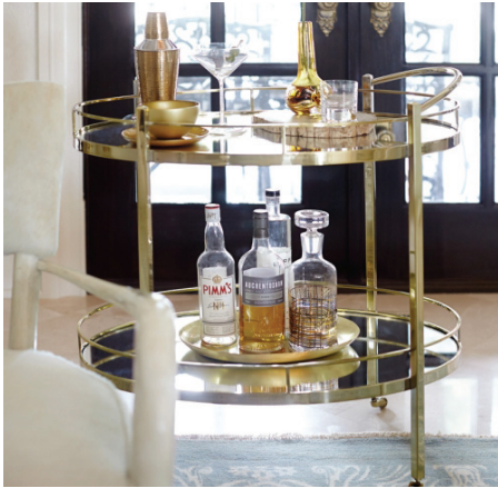
Sleek brass two-tier bar cart with mirrored shelves JADE | $895 | jadenola.com