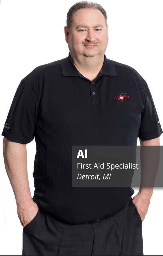
AI First Aid Specialist Detroit, MI