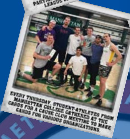
EVERY THURSDAY, STUDENT-ATHLETES FROM MANHATTAN COLLEGE GATHERED AT THE CARDS FOR A CAUSE CLUB MEETING TO MAKE CARDS FOR VARIOUS ORGANIZATIONS.