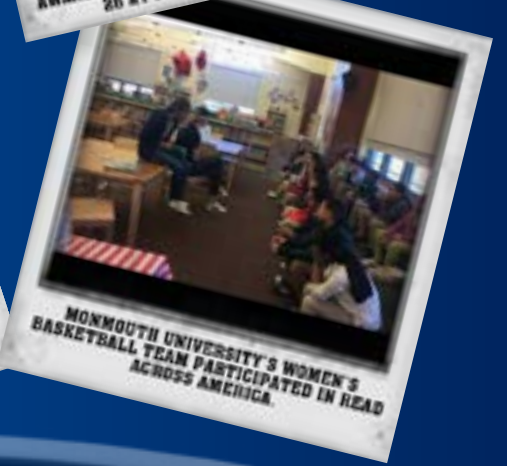
MONMOUTH UNIVERSITY'S WOMEN'S BASKETBALL TEAM PARTICIPATED IN ROAD ACROSS AMERICA.

Under the Geico GoodWorks Program structure, MAAC member schools who have completed community service projects will be featured each month throughout the academic year. Monthly releases will be published and archived on MAACSports.com that highlight the volunteer efforts of MAAC schools during that month.