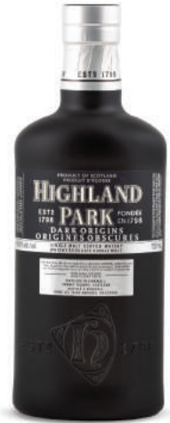
Highland Park Dark Origins