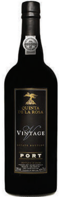
Quinta de la Rosa Vintage Port