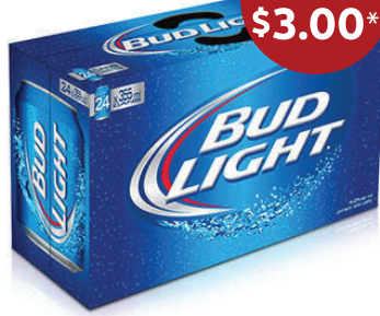
Bud Light 24 Pack Cans