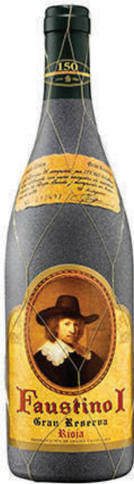
Faustino I Gran Reserva