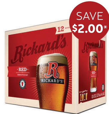
Rickard's Red 12 Pack Bottles