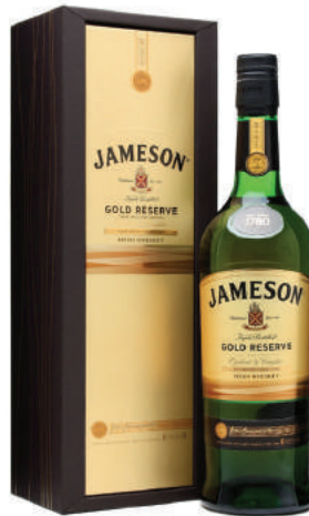
Jameson Gold Reserve Irish Whiskey