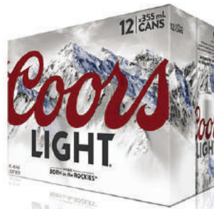
Coors Light 12 Pack Cans