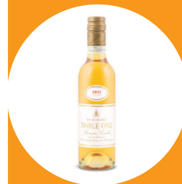
De Bortoli Noble One Botrytis Semillon 375mL, B0126A ($33.19)