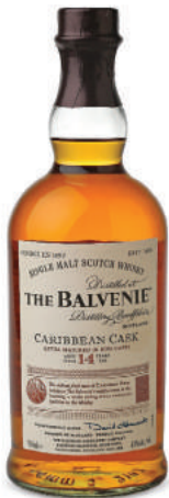
The Balvenie Caribbean Cask 14YO Scotch Whisky