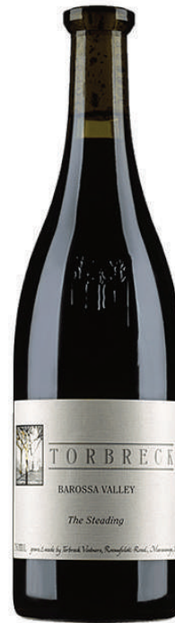
Torbreck Barossa Valley The Steading