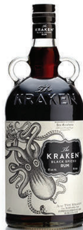
The Kraken Black Spiced Rum