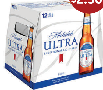
Michelob Ultra 12 Pack Bottles