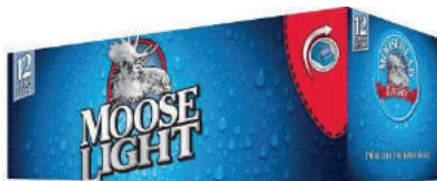
Moose Light 12 Pack Cans