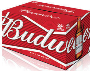
Budweiser 24 Pack Bottles