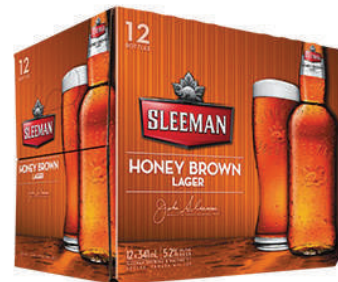
Sleeman Honey Brown 12 Pack Bottles