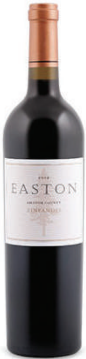
Easton Amador County Zinfandel