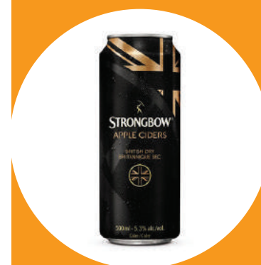
Strongbow Cider 500mL ($4.09)