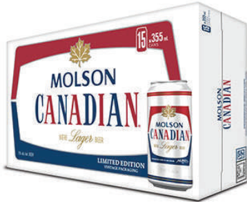
Molson Canadian 15 Pack Cans