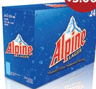
Alpine 24 Pack Cans