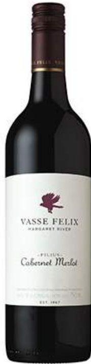
Vasse Felix Cabernet Merlot