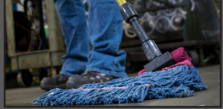
Wet & Dust Mops