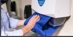
Cotton Roll Towels