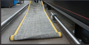
Industrial Safety Mats