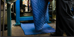
Sorbblts® Oil Absorbents