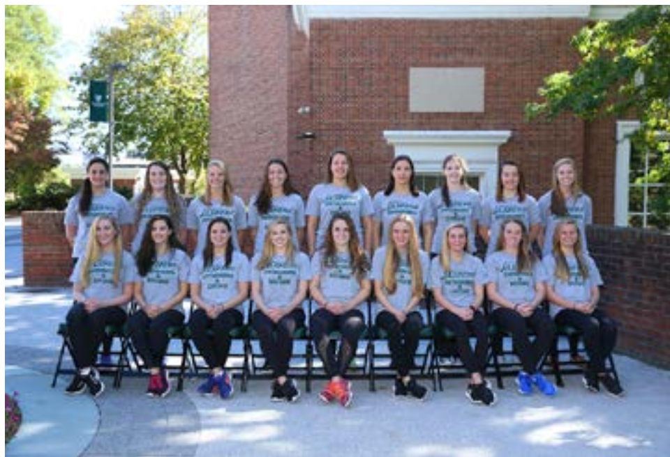
2016-17 WOMEN'S ROSTER