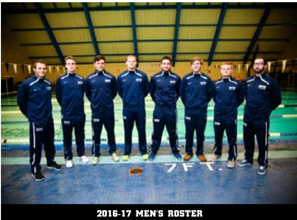
2016-17 MEN'S ROSTER