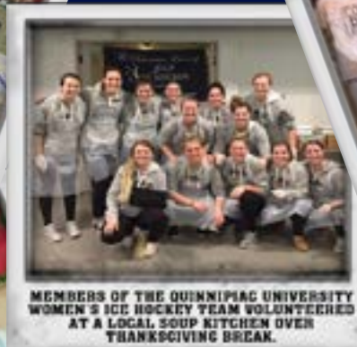
MEMBERS OF THE QUINNIPIAC UNIVERSITY WOMEN'S ICE HOCKEY TEAM VOLUNTEERED AT A LOCAL SOUP KITCHEN OVER THANKSGIVING BREAK.