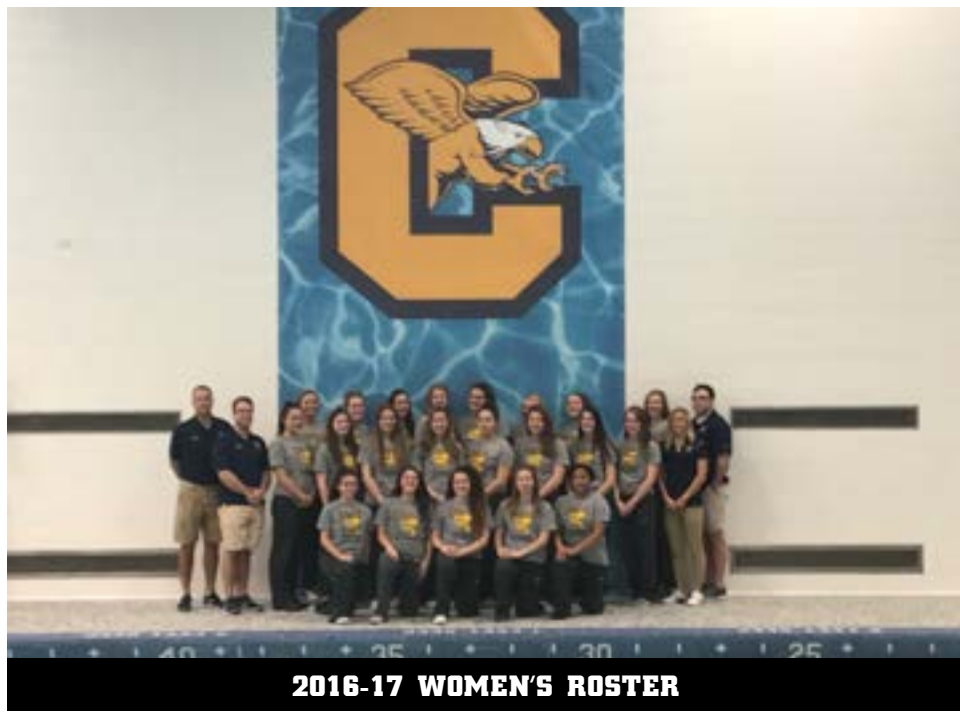
2016-17 WOMEN'S ROSTER