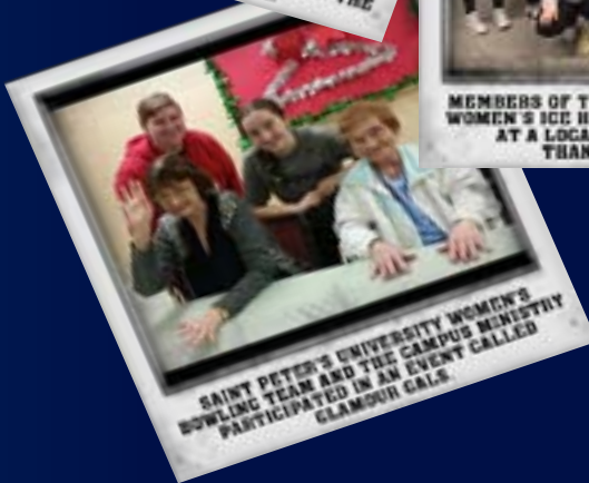
SAINT PETER'S UNIVERSITY WOMEN'S BOWLING TEAM AND THE CAMPUS MINISTRY PARTICIPATED IN AN EVENT CALLED GLAMOUR GALA.