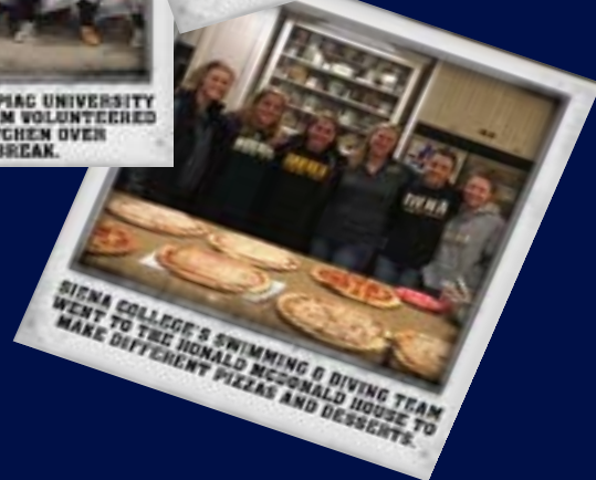
SIENA COLLEGE'S SWIMMING & DIVING TEAM WENT TO THE DONALD MCDONALD HOUSE TO MAKE DIFFERENT PIZZAS AND DESSERTS.