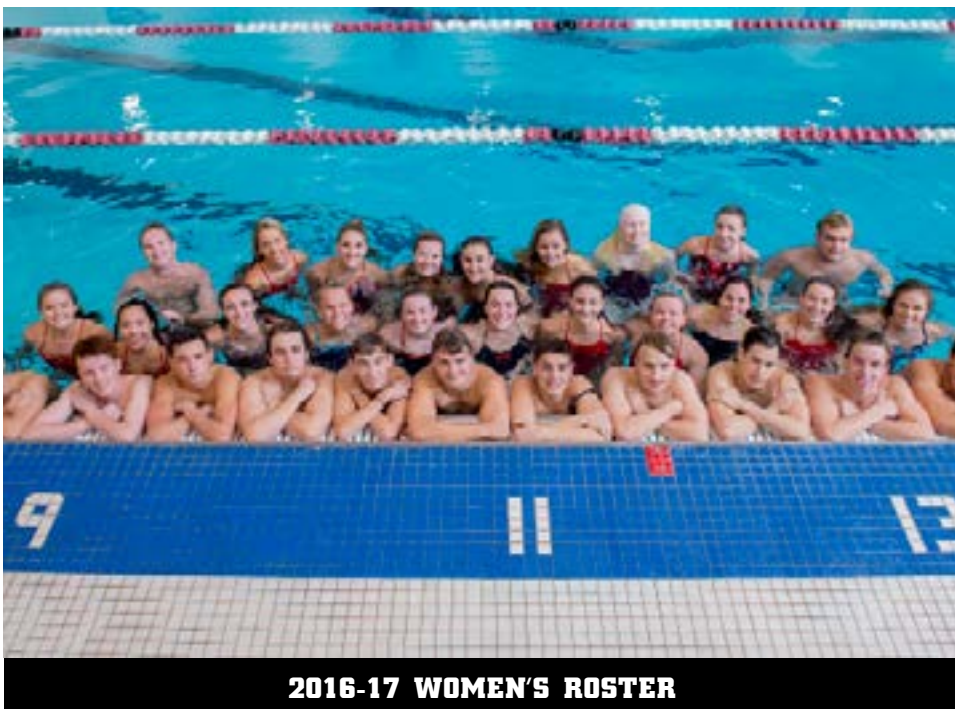
2016-17 WOMEN'S ROSTER