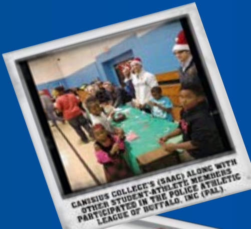
CANISIUS COLLEGE'S (SAAC) ALONG WITH OTHER STUDENT-ATHLETE MEMBERS PARTICIPATED IN THE POLICE ATHLETIC LEAGUE OF BUFFALO, INC (PAL).