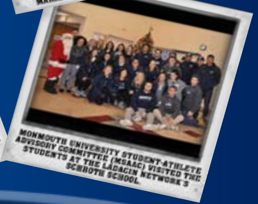
MONMOUTH UNIVERSITY STUDENT-ATHLETE ADVISORY COMMITTEE (MSAAC) VISITED THE STUDENTS AT THE LADACIN NETWORK'S SCHROTH SCHOOL.

Under the Geico GoodWorks Program structure, MAAC member schools who have completed community service projects will be featured each month throughout the academic year. Monthly releases will be published and archived on MAACSports.com that highlight the volunteer efforts of MAAC schools during that month.