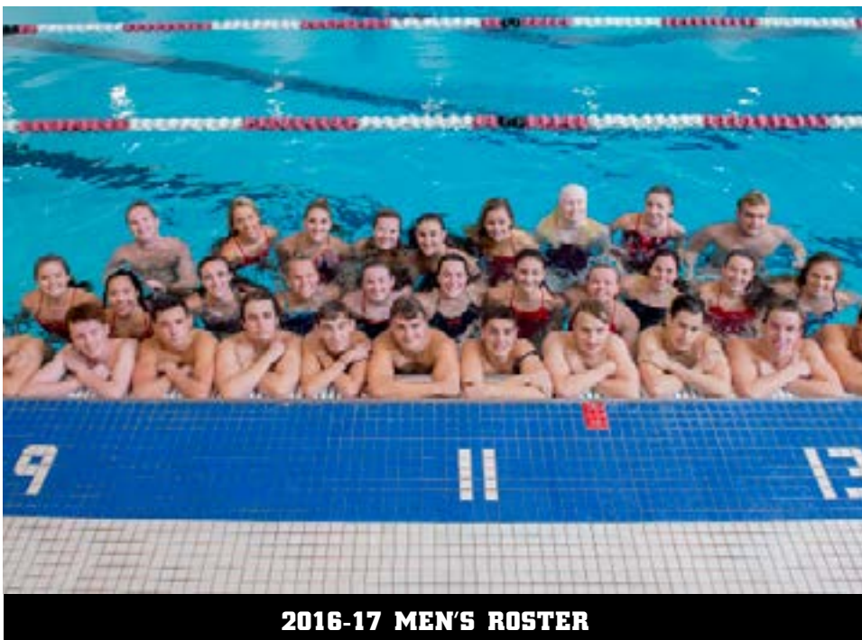
2016-17 MEN'S ROSTER