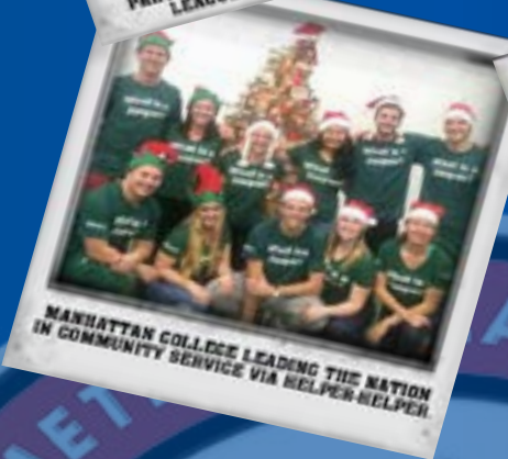
MANHATTAN COLLEGE LEADING THE NATION IN COMMUNITY SERVICE VIA HELPER-HELPER.