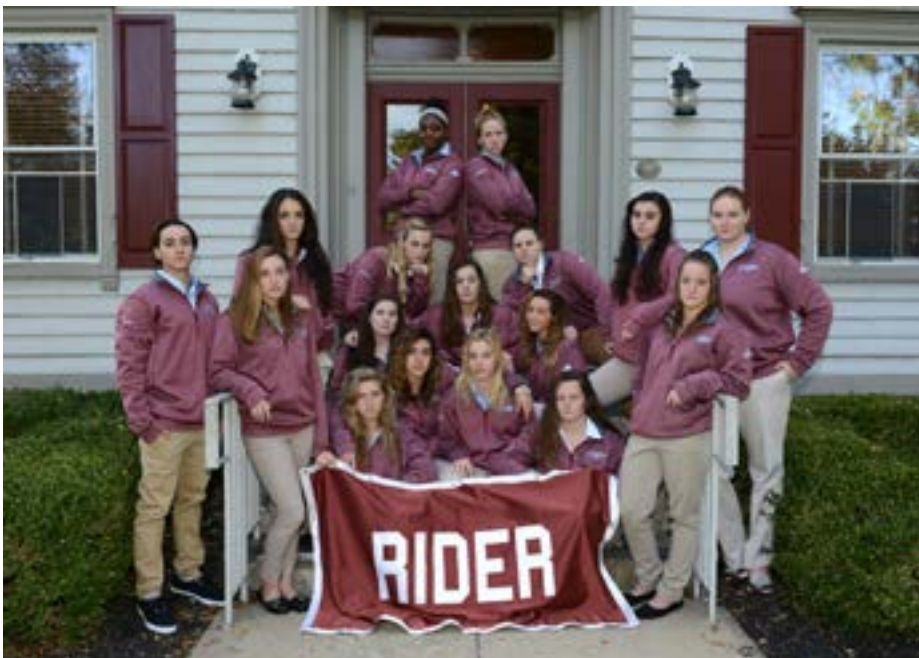
2016-17 WOMEN'S ROSTER

TWITTER: @RIDERATHLETICS FACEBOOK: /RIDERATHLETICS