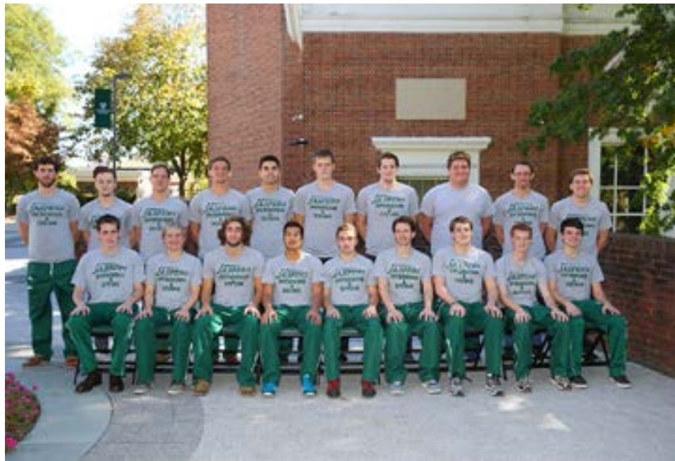
2016-17 MEN'S ROSTER