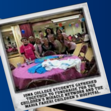
IOWA COLLEGE STUDENTS GATHERED TOGETHER TO FUNDRAISE FOR THE CHILDREN'S MIRACLE NETWORK AND THE MARIA FARERI CHILDREN'S HOSPITAL.