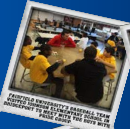
FAIRFIELD UNIVERSITY'S BASEBALL TEAM VISITED JOHNSON ELEMENTARY SCHOOL IN BRIDGEPORT TO MEET WITH THE BOYS WITH PRIDE GROUP.