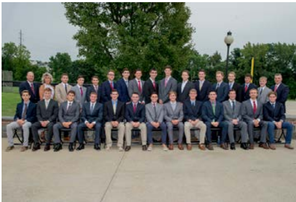
2016-17 MEN'S ROSTER