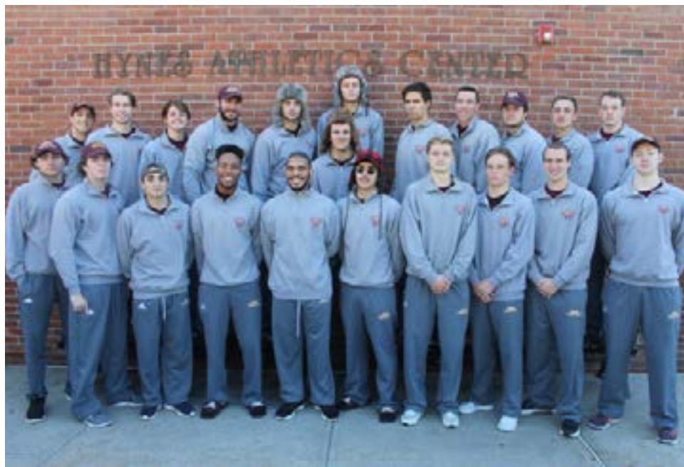
2016-17 MEN'S ROSTER