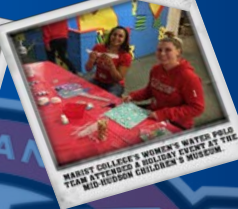
MARIST COLLEGE'S WOMEN'S WATER POLO TEAM ATTENDED A HOLIDAY EVENT AT THE MID-HUDSON CHILDREN'S MUSEUM.