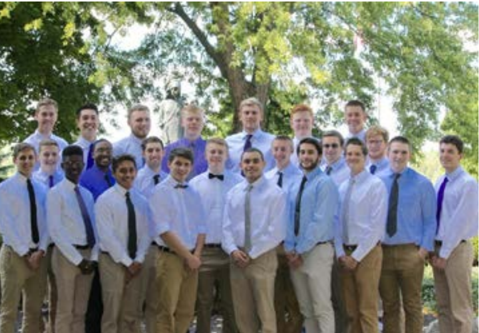
2016-17 MEN'S ROSTER