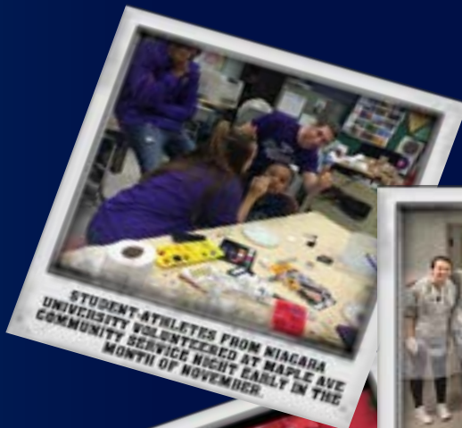
STUDENT ATHLETES FROM NIAGARA UNIVERSITY VOLUNTEERED AT MAPLE AVE COMMUNITY SERVICE NIGHT EARLY IN THE MONTH OF NOVEMBER.