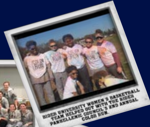
RIDER UNIVERSITY WOMEN'S BASKETBALL TEAM HELPED OUT WITH THE RIDER PANHELLENIC COUNCIL'S 2ND ANNUAL COLOR RUN.