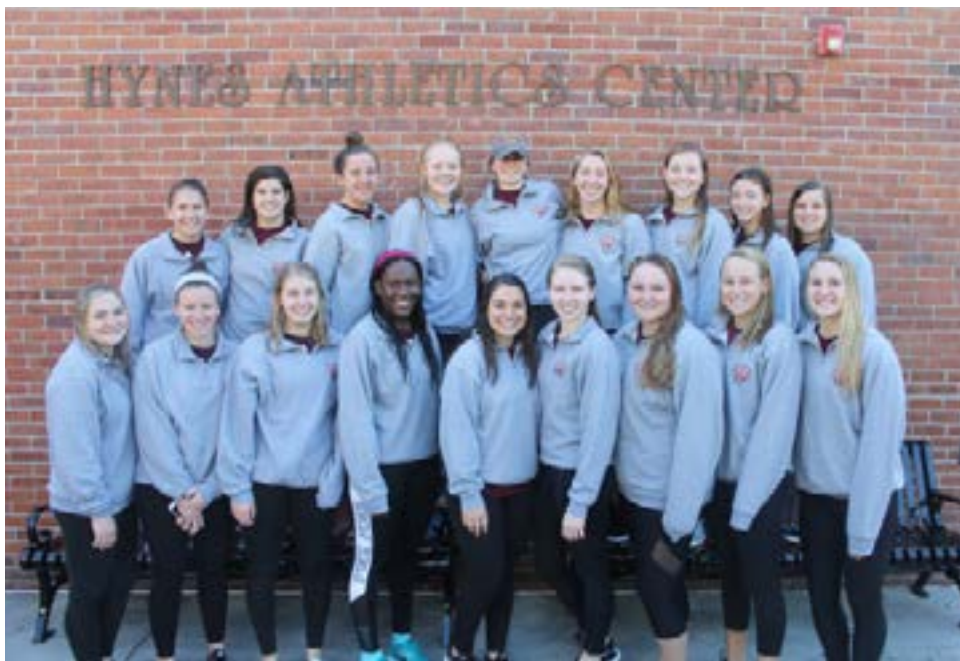
2016-17 WOMEN'S ROSTER