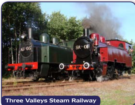
Three Valleys Steam Railway

Our first day begins with a transfer to Rebecq for a leisurely ride on the "Petit train du Bonheur" – the Little Train of Happiness. The track along the River Senne was closed in 1961 and lay dormant until the local owner of a steam locomotive bought the Rebecq station building and began the project of restoring steam to the "Valley of the Birds". We have a private photo steam charter over this 4km 600mm line not previously visited. We follow this charming start to the day with a visit to the Brewery of Aulne Abbey for a tour and tasting. The afternoon continues in Thuin, where we visit the historic Tramway Museum, which houses 30 restored vehicles and preserves a rural route that retraces the history of the world's largest tram network. During our visit we ride on specially arranged electric trams and autorail cars. The day ends at the Distillery of Biercée for a tour, tasting and dinner. (B,D)