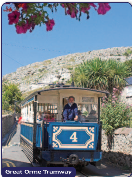
Great Orme Tramway

One of the great circular wonders of the world as we travel by coach to Caernarfon to travel the new Welsh Highland line by steam to Porthmadog Harbour. We then have an enjoyable return run on the Welsh Highland (Heritage) line followed by free-time in Porthmadog. We then travel by steam up the Ffestiniog line to Blaenau Ffestiniog then down the picturesque Conwy Valley line to Llandudno Junction and onwards to Bangor. (B,D)