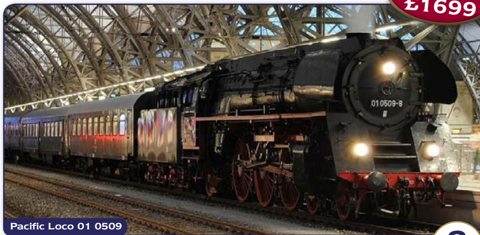
Pacific Loco 01 0509

following excursions which must be booked at time of tour booking: