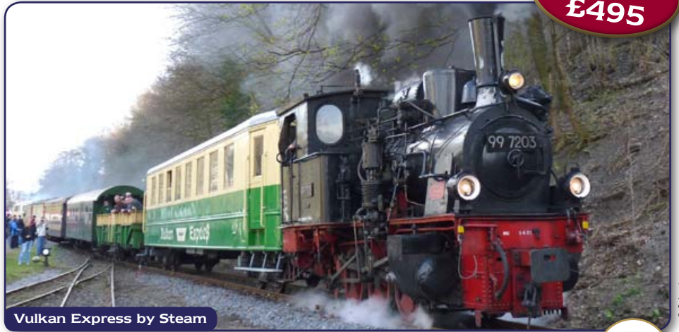
Vulkan Express by Steam