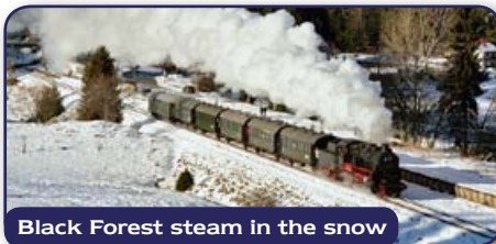
Black Forest steam in the snow

Conveniently situated between Aachen's railway station and city centre, the Ibis has a restaurant and bar. Rooms are en-suite with shower and feature flat screen tv, hairdryer and desk.