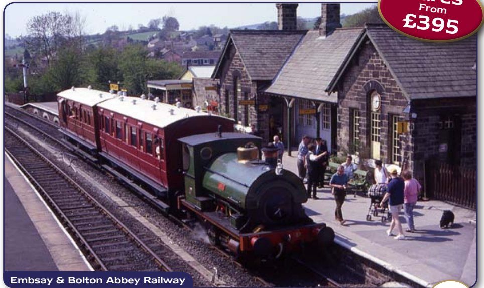
Embsay & Bolton Abbey Railway

Enjoy a day at the Keighley & Worth Valley Autumn Steam Gala and two other great Yorkshire heritage railways, plus a visit to York and two great breweries. Don't be bitter – hop on!