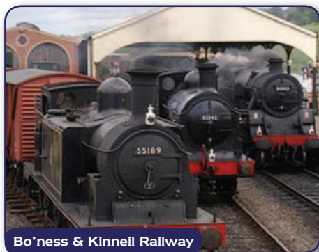
Bo'ness & Kinneil Railway