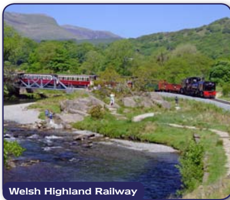
Welsh Highland Railway