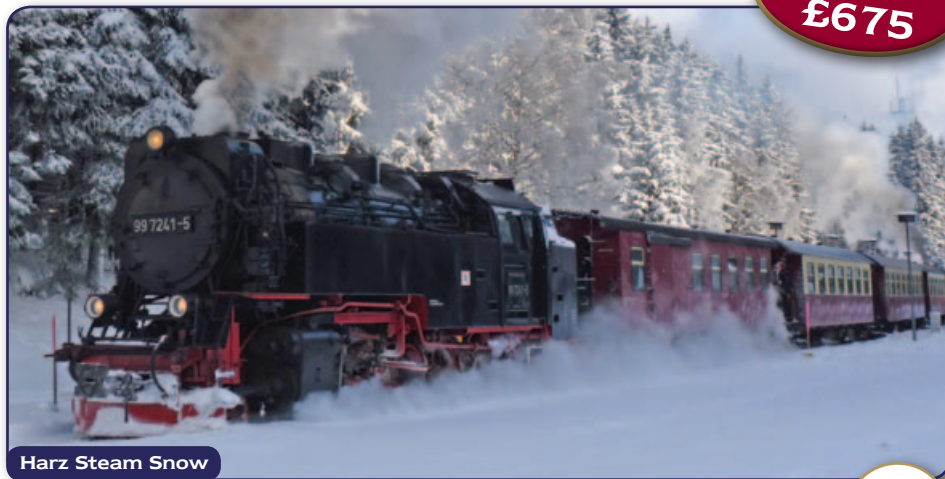
Harz Steam Snow

Imagine the sweet aroma of chestnuts, almonds and spicy, warming gluhwein amidst the half-timbered picturebook squares of Wernigerode and Goslar - a perfect pre-Christmas backdrop. And not forgetting a mountain steam adventure and a journey aboard the Emperor's Carriage!