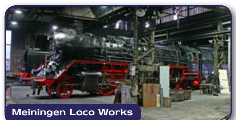
Meiningen Loco Works

HOTEL Leonardo Hotel Frankfurt City Centre Situated a short distance from the railway station, city centre and river bank, the hotel has a bar and bistro restaurant and offers bright modern en-suite bedrooms with air conditioning, TV, safe, internet access and hairdryer