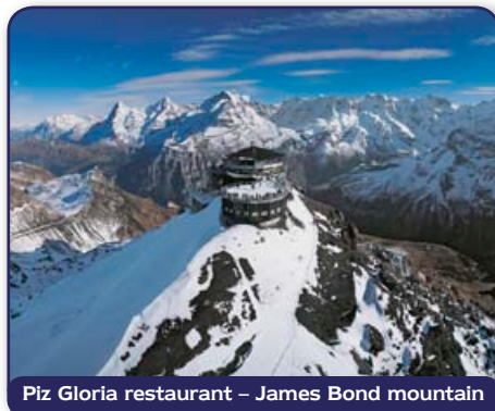
Piz Gloria restaurant – James Bond mountain

We return by high speed trains to London, arriving late afternoon. (B)