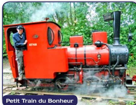
Petit Train du Bonheur

Leaving Charleroi, our journey home involves a change in Brussels, where we join the Eurostar service to London St Pancras. (B)