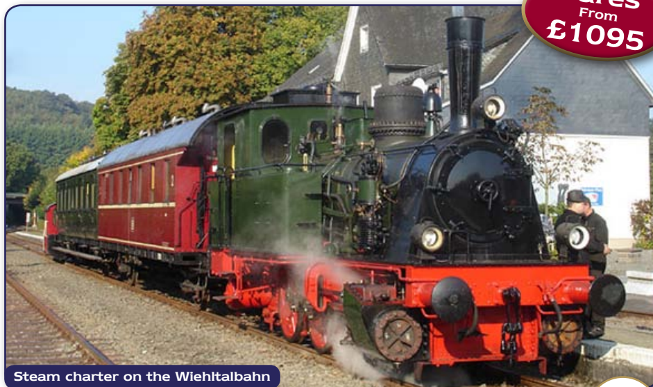
Steam charter on the Wiehltalbahn

Enjoy an intensive all steam action tour featuring a metre gauge private steam charter, mainline steam, heritage railways, superb steam depots, and all at a great value fare.