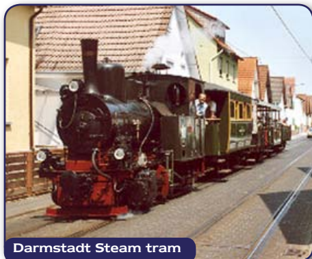
Darmstadt Steam tram

A wonderful late summer break of great German steam in a variety of gauges! Amazing steam-hauled railway journeys, great photo opportunities and the best Railway Works steam show in Europe!