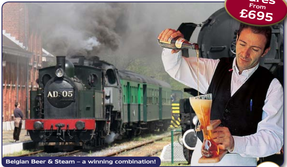
Belgian Beer & Steam – a winning combination!

An action-packed Belgian tour featuring two days at the 3 Valleys Steam Festival and much more – vintage trams, the "Little Train of Happiness", visits to a distillery and three Belgian breweries!