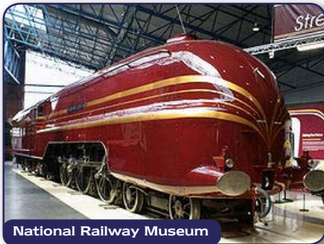
National Railway Museum

A short local train journey today takes you through quaint Knaresborough to historic York, which boasts many attractions, not least the Minster, city walls and, of course, the National Railway Museum. After free time to discover the NRM and the city's other attractions, we meet up for a visit to the York Brewery, set within the city walls, where the brewing process is explained on a guided tour, including four tasters of the brewery's products. (B,D)