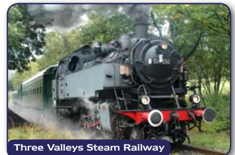
Three Valleys Steam Railway