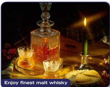
Enjoy finest malt whisky

4 nights' bed & breakfast, 4 evening meals Rail travel & seat reservations from your Home Station to Tour Base (Standard or First Class) Rail & coach travel, with transfers as described All excursions and admissions as detailed Services of experienced Railtrail Tour Manager Hotel Portage