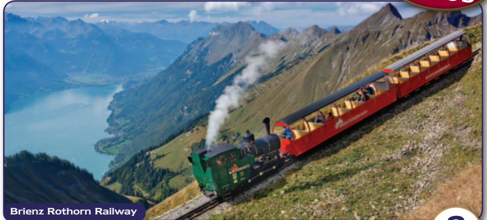
Brienz Rothorn Railway

between snow-covered mountain peaks en route to the line's newly extended terminus at Oberwald. (B,D)