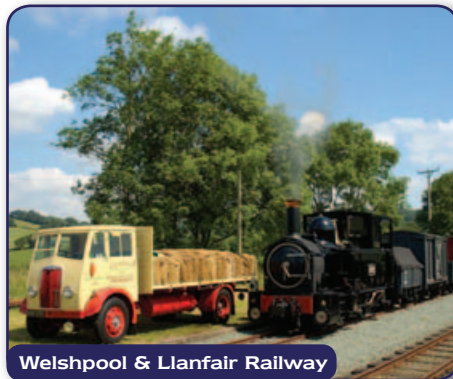
Welshpool & Llanfair Railway

we travel to the Welshpool & Llanfair Railway for their Annual Gala Day with extra activity and visiting engines in steam. This really is a fabulous rural countryside railway as we ride between Llanfair Caereinion and Welshpool behind steam, including tackling the steep Golfa Bank. Plenty of time to see other workings today, including the "vintage" train with Countess and replica Pickering coaches, whilst enjoying repeat journeys along the line, before departing by train from Welshpool at 17.00 hrs to homeward stations. (B)