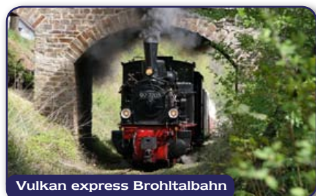
Vulkan express Brohltalbahn

Today is a fabulous day of steam commencing with a regional train journey to Dieringhausen for a full day private steam photo charter on the standard gauge Wiehltalbahn between Dieringhausen and Wiehl, with numerous photo run-pasts, opportunities for footplate rides etc.