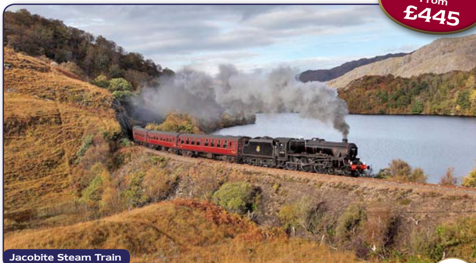
Jacobite Steam Train

framed wilderness, today is a contrast of quintessential Highland lochs and glens in golden autumn hues. Reaching Oban, we leave the mainland by ferry for the Isle of Mull, where we enjoy a visit to Duart Castle, the proud ancestral home of the Clan MacLean. Returning to Oban, we experience a fascinating tour of the Oban Distillery, culminating in a 'wee dram'. After the return journey past Loch Etive and the appropriately named Loch Awe, relax in our hotel bar with its extensive range of malts. (B,D)