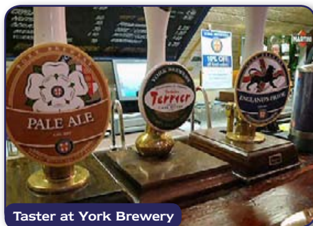
Taster at York Brewery

We bid "ah'll sithee" to Yorkshire and make our way home. (B)