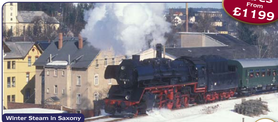
Winter Steam in Saxony

A stunning winter wonderland tour to the beautiful city of Dresden, combining great steam trains, scenic journeys, enchanting countryside and magical festive markets in wonderful traditional towns.