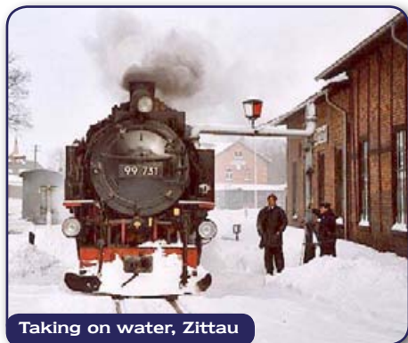
Taking on water, Zittau

We begin with a guided tour of Dresden Transport Museum plus the atmospheric steam loco depot at Dresden Altstadt, followed by a return steam ride on the second of our fantastic Saxony narrow gauge lines, up the picturesque Weisser valley currently some 15 kms to Dippoldiswalde but the new extension to Kipsdorf is due to open in time for our visit. Alternatively, you may wish to relax in Dresden and explore other magnificent