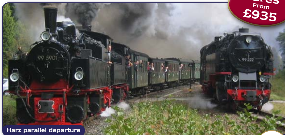
Harz parallel departure

Enjoy an intensive all steam action tour featuring a metre gauge private steam charter, mainline steam, heritage railways, superb steam depots, and all at a great value fare.