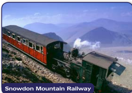
Snowdon Mountain Railway

Whilst your luggage travels on the bus we hop on and off to photograph steam along the Welsh Highland line before joining the scheduled train service at Porthmadog to Fairbourne, for a steam run along the sand dunes. We then continue by train to Machynlleth and onwards by coach to Aberystwyth University. In the evening we take the Aberystwyth Cliff Railway 'funicular' to enjoy an evening meal at a quality restaurant at the top of the cliff. (B,D)