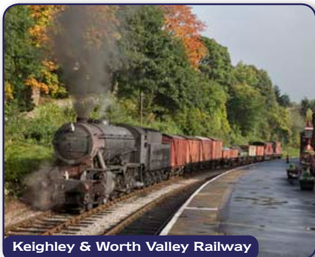
Keighley & Worth Valley Railway

Enjoy a day at the Keighley & Worth Valley Autumn Steam Gala and two other great Yorkshire heritage railways, plus a visit to York and two great breweries. Don't be bitter – hop on!