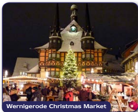
Wernigerode Christmas Market

Imagine the sweet aroma of chestnuts, almonds and spicy, warming gluhwein amidst the half-timbered picturebook squares of Wernigerode and Goslar - a perfect pre-Christmas backdrop. And not forgetting a mountain steam adventure and a journey aboard the Emperor's Carriage!