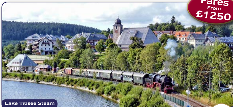
Lake Titisee Steam

Enjoy a special New Year tour as we steam through glorious Black Forest scenery in its magical winter setting with New Years Eve celebrations in beautiful Freiburg and a steamy sojourn in Holland.