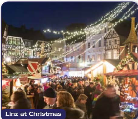
Linz at Christmas

Leaving Remagen, we change trains onto the high speed line in Cologne. In Brussels we join the Eurostar service to London St Pancras. (B)