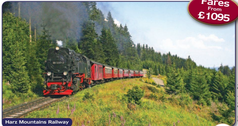
Harz Mountains Railway

A First Class rail holiday to enjoy picturesque towns and villages surrounded by a panoramic range of rocky crags romantic valleys, and fairytale woods - full of folklore, witches and steam trains.