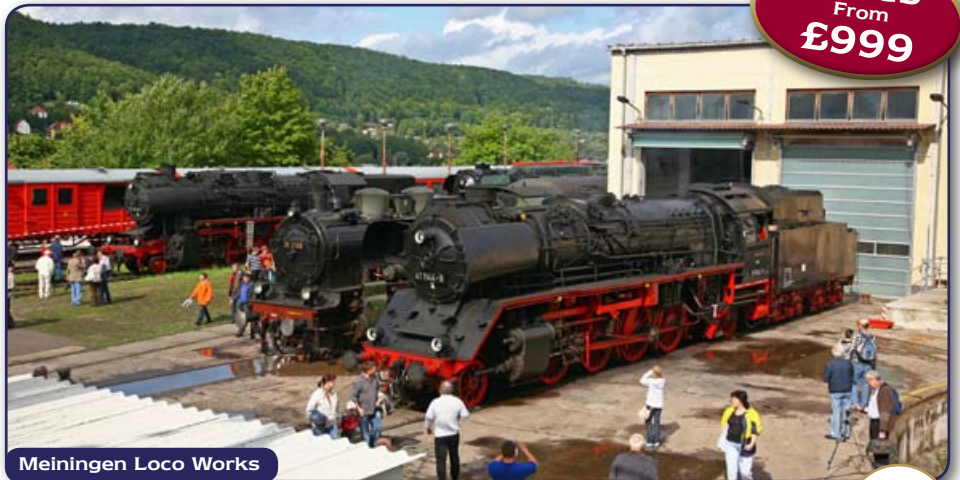
Meiningen Loco Works

A wonderful late summer break of great German steam in a variety of gauges! Amazing steam-hauled railway journeys, great photo opportunities and the best Railway Works steam show in Europe!