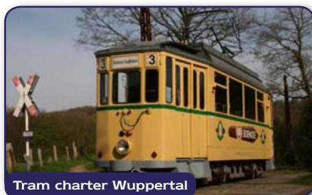
Tram charter Wuppertal

It's time to bid farewell to Wuppertal and journey back by ICE train and Eurostar to London. (B)