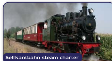
Selfkantbahn steam charter