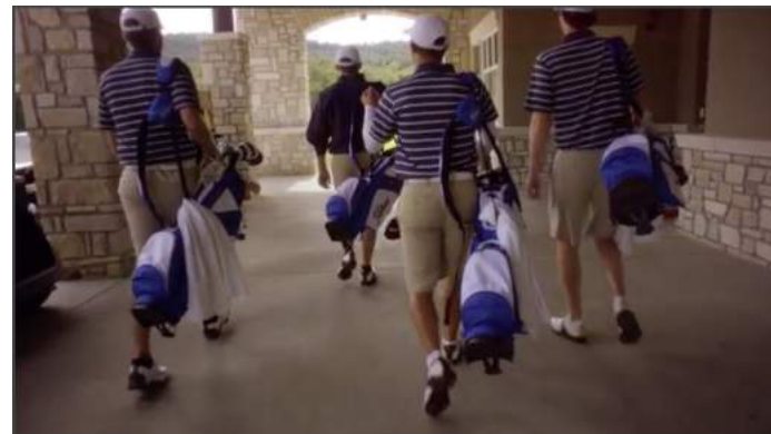
Scene from Titleist Commercial