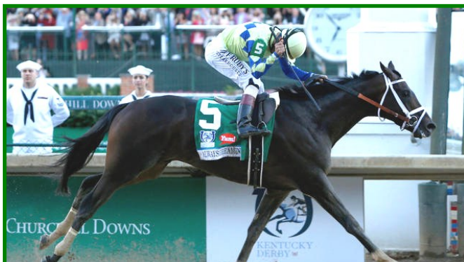
ALWAYS DREAMING 2017 WINNER