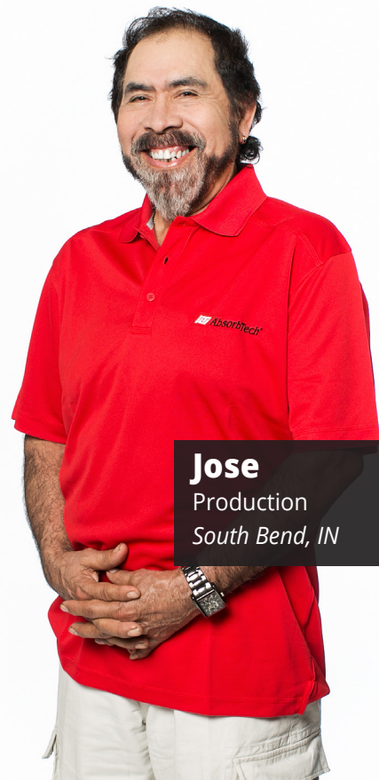
Jose Production South Bend, IN

Net Promoter Score - a proven method companies worldwide use to measure & improve loyalty. Across industries, a 69 out of 100 is considered exceptional.