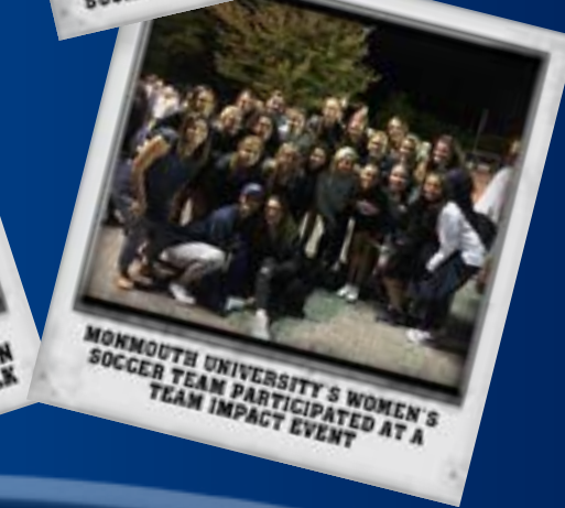
MONMOUTH UNIVERSITY'S WOMEN'S SOCCER TEAM PARTICIPATED AT A TEAM IMPACT EVENT