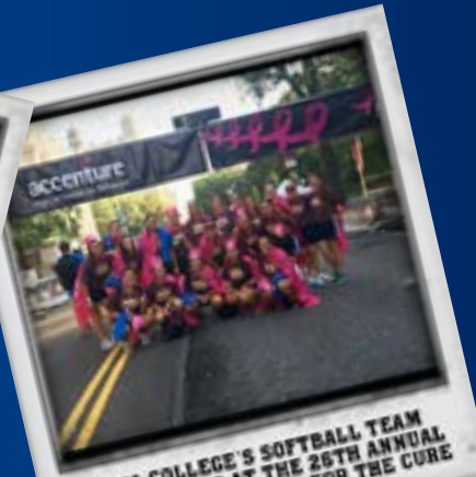
IONA COLLEGE'S SOFTBALL TEAM VOLUNTEERED AT THE 26TH ANNUAL SUSAN G. KOMEN RACE FOR THE CURE