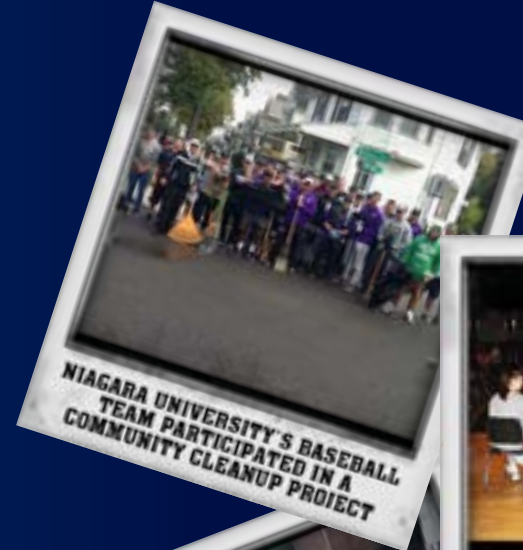
NIAGARA UNIVERSITY'S BASEBALL TEAM PARTICIPATED IN A COMMUNITY CLEANUP PROJECT