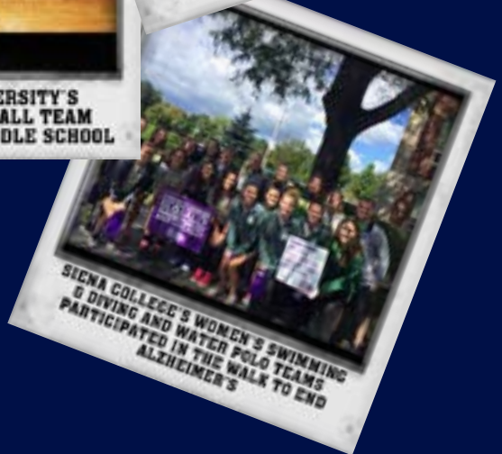
SIENA COLLEGE'S WOMEN'S SWIMMING & DIVING AND WATER POLO TEAMS PARTICIPATED IN THE WALK TO END ALZHEIMER'S

Under the MAAC Goodworks Program structure, MAAC member schools who have completed community service projects will be featured each month throughout the academic year. Monthly releases will be published and archived on MAACSports.com that highlight the volunteer efforts of MAAC schools during that month.