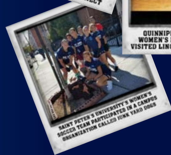
SAINT PETER'S UNIVERSITY'S WOMEN'S SOCCER TEAM PARTICIPATED IN A CAMPUS ORGANIZATION CALLED BUNK YARD DOGS