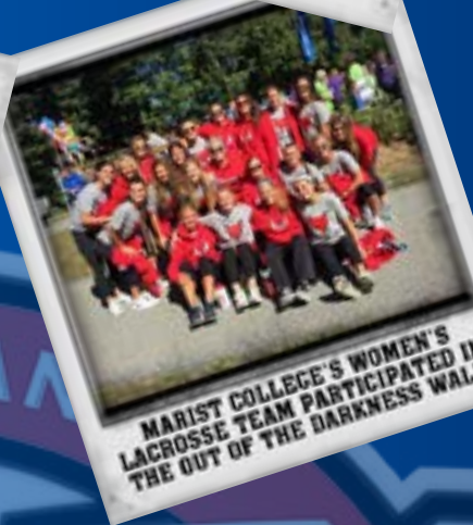
MARIST COLLEGE'S WOMEN'S LACROSSE TEAM PARTICIPATED IN THE OUT OF THE DARKNESS WALK