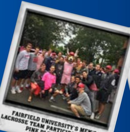
FAIRFIELD UNIVERSITY'S MEN'S LACROSSE TEAM PARTICIPATED IN THE PINK PLEDGE WALK