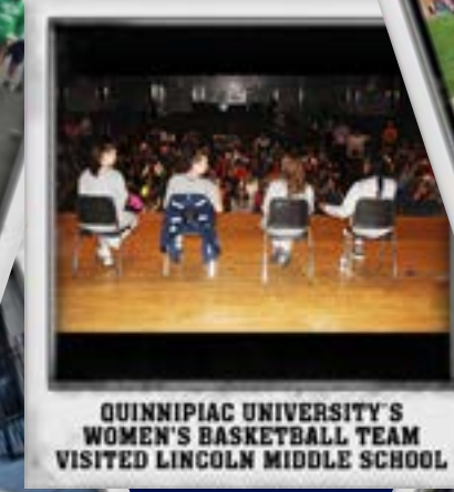
QUINNIPIAC UNIVERSITY'S WOMEN'S BASKETBALL TEAM VISITED LINCOLN MIDDLE SCHOOL