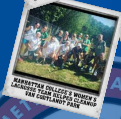
MANHATTAN COLLEGE'S WOMEN'S LACROSSE TEAM HELPED CLEANUP VAN CORTLANDT PARK