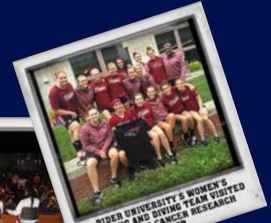
RIDER UNIVERSITY'S WOMEN'S SWIMMING AND DIVING TEAM VISITED THE BREAST CANCER RESEARCH CENTER