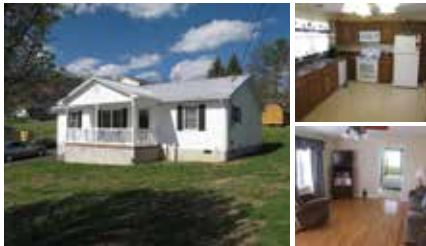
MLS# 59784 - New construction, 1 level living 2BR 2 large baths home with hw and tile and carpet floors, large eat in kitchen. Open floor plan, paved driveway and carport. $142,900