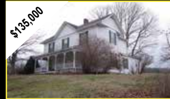
MLS# 59128 BLAND 4BD/2BA historic home on 1.3 ac that has been updated. Library, parlor, wood FP, living, kitchen, mudroom, large attic closet. Fruit trees, and outbuilding.