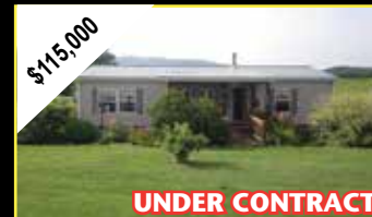
MLS# 58331 MAX MEADOWS 3BD/2BA doublewide on 5 acres. Beautiful landscaping, 4-stall barn, at least 4 types of fruit trees and a view. Walk in closets, and newer floors and newer metal roof.