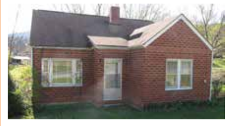
MLS# 59408 - Mid century bungalow, 3BR with stunning master suite, kitchen has some update but kept its original charm, arch doorways accent the home, replacement windows and refinished floors 2016, screen porch, full walk out basement, with spacious yard just outside of town. $104,900