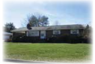
MLS# 59077 N. 16TH ST. 3 bedrooms, 2 baths, 1450 SF on 0.39 acres..... $172,500