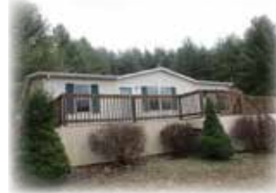
MLS# 58908 PHILLIPS RD. 3 bedroom, 2 bath, 1080 SF on 1.92 acres..... $64,900

Wythe County Real Estate offers HUD Outreach Training Programs monthly for Agents & Buyers!!! Contact Office for details.