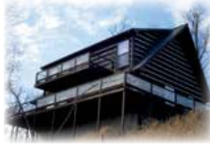
MLS# 50331 MEADOW VIEW LN. 3 BR, 2 BA, 1837 SF on 9.29 acres. Great hunting resort..... $154,000