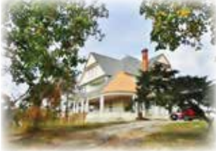
MLS# 58041 4TH ST. 5 bedrooms, 2.5 bath, 3492 SF on 0.95 ac re..... $144,200