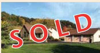
MLS# 58171 - RURAL RETREAT 3 BR, 2 BA, well maintained, open floor plan, cathedral ceilings, 3 car garage, outbuilding, fire pit, 1.99 acre corner lot, conveniently located in nice subdivision. $210,000