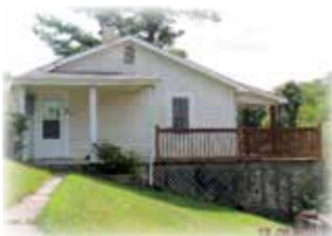
MLS# 47884 BRIDEL LANE 3 BR, 1 BA, 960 SF, 3.93 acres..... $49,900