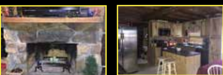
MLS# 59956 WYTHEVILLE 3BD/2BA log home on 5.08 ac. Master has walk in closet. Beautiful country kitchen and nice stone fireplace in living room. Partially fenced land, ready for horses