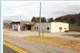
MLS # 326713- Max Meadows $650,000

Move-In ready at the lake! Open floor plan w/ 9 ft. ceilings, crown molding, 3 bedroom 2 bath, floored attic with plenty of storage. Trex deck on back, fenced spacious back yard. Huge 32'x36' garage!