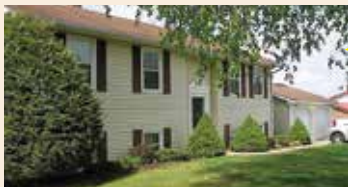
MLS# 59896 - RURAL RETREAT 3 BR, 3 BA, 2148 SF, HW floors, walk-in closets, renovations including kitchen, sun room & concrete patio w/gazebo, lower level offers a 2nd living area w/ fam room, br, ba & fully equipped kitchen, ceramic tile floor. $239,500