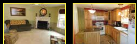
MLS# 60182 FORT CHISWELL 3BD/2BA doublewide on 5.66 ac. Open Floor Plan, custom cabinets and countertops. Formal dining, family room. Above ground pool and large deck. Outbuilding and shed.