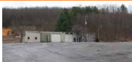
MLS# 59483 - Pump Hollow - Shop with 5 bay doors for the mechanic or business to be able to service your own equipment with additional open equipment shed offering 2 open acres along with 5 wooded acres going Big Survey. $165,000