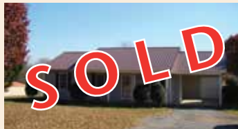
MLS# 58209 - GRAHAMS FORGE 2 BR, 1 BA, well built/maintained, laminate flooring throughout, new appliances/countertops, gas logs, fenced backyard, metal roof. $129,000