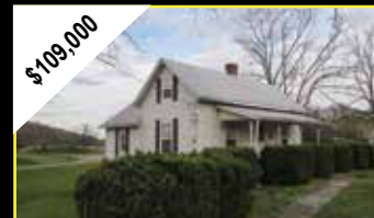
MLS# 55391 FORT CHISWELL 3 BR farm house on 3 acres. Well-maintained, hardwood floors, corner lot, outbuildings.