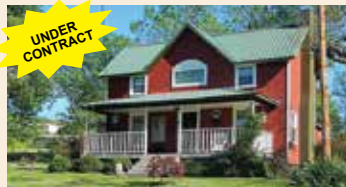
MLS# 60055 - IVANHOE Remodeled/Updated Farm House, 2 BR, 2 BA, eat-in kitchen, HW floors, newer paint, walk-in closets, screened back porch, open patio, 1 ac. landscaped lot, near the NR/NR Trail & horseback riding trails. $95,000