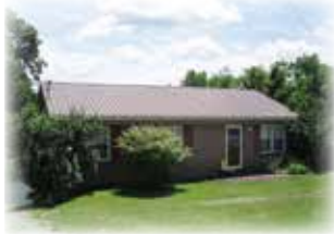
MLS# 56339 HOLSTON RD. 3 BR, 1 BA, 1000 SF on 0.50 acres..... $127,400

www.wythevarealestate.com (276) 637-HOME