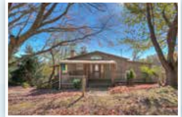
MLS # 326151- Meadows Of Dan $149,900

PRIME CLAYTOR LAKE WATERFRONT LOT!!!! Great wooded lot suitable to build on a quiet cove at Claytor Lake. Just minutes to I-81, Shopping, Restaurants, State Park, Marina, etc... Priced to sell well below the current tax assessment of $140,000!