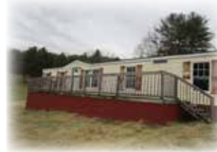
MLS# 58397 E. LEE HWY 3 bedrooms, 2 baths, 1440 SF..... $16,500