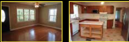
MLS# 60077 GALAX 5BD/2BA home on 0.47 ac. 5 min to downtown, but in the country. U shaped home with formal dining, breakfast area, living, bedrooms, laundry. Nice back deck and separate or inside entrance to full basement w/ BD and family room.