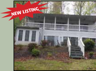
$349,000 - MLS# 60098 THIS RANCH HOME OFFERS 3 BR'S 2&1/2 BR'S, HUGE DEN/KITCHEN AREA. DINING AREA LOOKS OUT OVER THE LAKE. ALL BEDROOMS HAVE ACCESS TO THE COVERED PORCH.