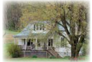
MLS# 46239 FELTS LANE 2 BR, 1.5 BA, 1260 SF on 12.07 acres..... $144,000