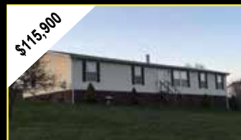
MLS# 54956 WYTHEVILLE Newer 3-4 bedroom, 2 bath home just out of town sitting on 1 ac. w/ tremendous views. Private office/playroom off master suite. LG room throughout. This is a must see!