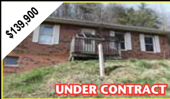
MLS# 59367 MARION 3BD/2BA brick home on 10.5 ac. Very secluded with plenty of wildlife and a stocked pond. Room for garden area. Inside rooms are very spacious.