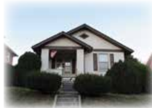
MLS# 58733 11TH ST. NW 2 bedroom, 1 bath, 1058 SF on 0.23 acre..... $41,400