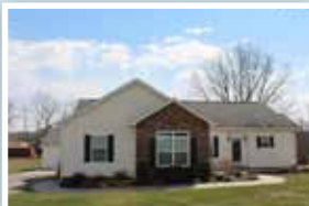
MLS # 326836- Dublin $290,000

Lake property! 3 bedroom 2 full bath brick Ranch home. Two-story boat dock with boat lift and party deck. Approximately 90 ft. of lake frontage. Located minutes off of I-81, convenient to the Draper Mercantile & New River Trail.