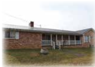
MLS# 58508 DELTON RD. 3 bedrooms, 2 baths, 2903 SF on 22 acres..... $182,400