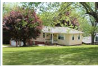
MLS # 328308-Wytheville $149,900

A cottage with amazing views. You can see all the way to Pilot Mtn, NC from the upper and lower decks. Located 10 minutes from the Blue Ridge Parkway. Conveniently located to wineries, golf courses, hiking trails, and trout-fishing! Great investment home! Three bedrooms and two full baths! Open floor plan with gas log fireplace. Mature apple trees!