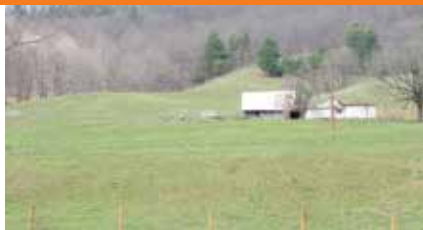
MLS# 59454 - Conner Valley - 62 acres of rolling/sloping pasture/crop. Farm is in the CREP program with all new high tingle fencing, 4 new water troughs, new well, 6 tracks with all new gates, joining National Forest on state maintained road with structure that could be used as a cabin and 1 barn and 1 equipment shed, joining National Forest. $289,900