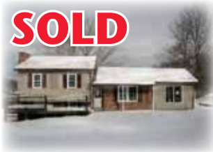
SOLD MLS# 58651 ABBEY LANE 3 bedrooms, 2 baths, 1291 SF on 0.49 acre..... $55,800