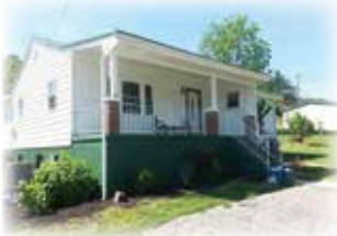
MLS# 58819 WILKINS LANE 4 bedroom, 1.5 bath, 1360 SF on 0.66 acres..... $105,000