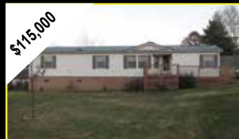
MLS# 58160 WYTHEVILLE 3BD/2BA doublewide on 0.92 ac outside of town limits. Level yard with privacy fence on a paved road. Metal roof, large deck. Large living room, rock fireplace.