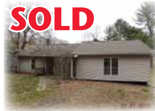
SOLD MLS# 59430 RED HILL DR. 1 bedroom, 1 bath, 1396 SF on 0.61 acre..... $31,500