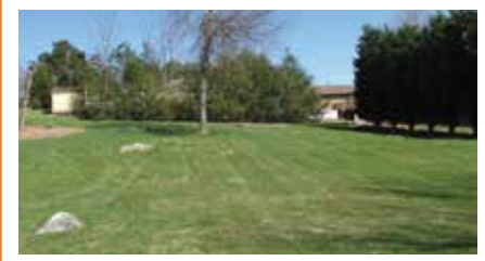
Petunia Road - Great level 0.46 acre lot with mature trees country feel just outside of town waiting for you to add your dream home! $32,400