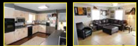
MLS# 59960 WYTHEVILLE 3BD/2.5BA home on 0.3 ac. Lots of cabinet space in kitchen. Finished partial basement. Concrete drive and walkway that leads to back patio complete with Pergola and a view.