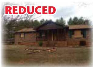
REduced MLS# 59102 BLOSSOM VIEW RD. 3 bedrooms, 2 baths, 2250 SF on 1.4 acres..... $64,500