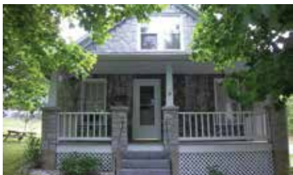
MLS# 59427 - Quaint stone cottage 2 BR on large lot with mature trees in family neighbor conveniently located in town. Finished h/w, new bathroom with custom retro kitchen still intact. $93,500