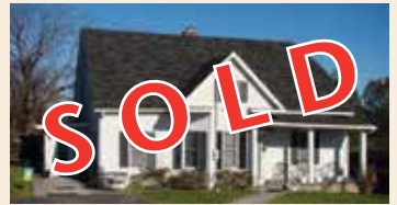
MLS# 53622 - WYTHEVILLE 7 BR, 2 BA, spacious, HW floors, walk-in closets, stairway woodwork, downtown location but private. Great business opportunity or family home. $92,500