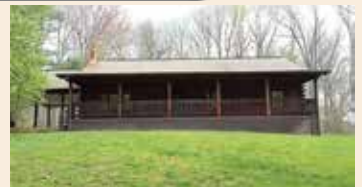
MLS# 60117 - DRAPER 3 BR, 2 BA, Cabin, beautiful hw floors, ceiling fans, heat pump heating/cooling, spacious attached carport, country setting, minutes from I-81 access. $154,900