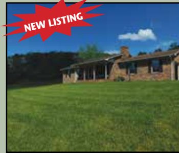
$219,900 - MLS# 59977 COME HOME AND STRETCH OUT ON THIS METICULOUSLY CARED FOR PROPERTY THAT SITS ON OVER FOUR ACRES. THIS HOME HAS THREE BEDROOMS AND TWO BATHS ALL ON THE MAIN LEVEL.