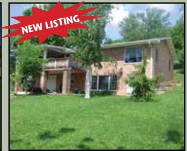
$169,900 - MLS# 60199 3 BR 21/2 BS'S BEAUTIFUL RAISED RANCH WITH UPDATED KITCHEN, FLOORING AND BATHROOMS, WITH AMAZING VIEWS.