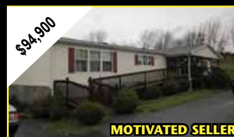
MLS# 59129 RURAL RETREAT 4BD/2BA modular home on 0.81 ac. PRICED BELOW ASSESSMENT. Fenced in back yard, Open floor plan with large master suite with jetted tub, walk in closets throughout house.