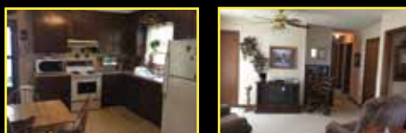
MLS# 59926 FORT CHISWELL 3BD/1BA home on 0.65 ac. perfect for one level living. Large living room, kitchen, and family room. 1 car carport and a nice level yard