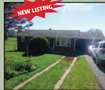
$112,000 - MLS# 60229 NICE 3BR 1 BATH HOME WITH COUNTRY FEEL LOCATED JUST MINUTES FROM SHOPPING, SCHOOLS AND HOSPITAL. PRICED TO SELL THIS HOME WON'T LAST.