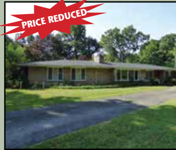
$249,000 - MLS# 58568 ONE OF WYTHEVILLE'S MOST UNIQUE ESTATES CONTAINING 3 ACRES IN TOWN. THE HOME OFFERS 3BR'S 2 1/2 BATHS, BEAUTIFUL HARDWOOD FLOORS AND FINISHED BASEMENT.