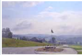
MLS # 325393- Draper $59,900

Great building lot 1.61 ACRE in cul-de-sac overlooking Draper Valley Golf Course. Very private and mostly wooded too! Suitable for a walk out basement or crawl-space home. Public water available.