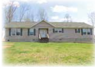
MLS# 59802 KIRBY RD. 3 bedroom, 2 bath, 2016 SF on 1.86 acres..... $159,000