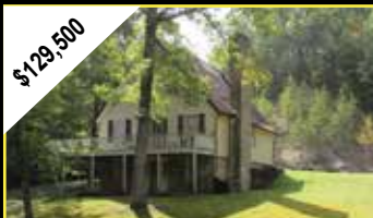
MLS# 57771 GULLION FORK 2 BR, 2 BA private home w/ full bsmt on 4.76 acres and joins Jefferson NF. FP, cathedral ceiling, overlook balcony from the MBR upstairs looking out.