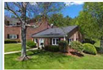
MLS # 327725- Laurel Fork $200,000

Beautiful farmhouse situated on 2.50 ACRES with a view of Little River. Screened in lower deck, upper deck accessible by two bedrooms. Barn providing plenty of storage. Privacy yet only minutes from all of the Auburn schools, I-81, Radford, RU, Christiansburg, Blacksburg, VT, etc..