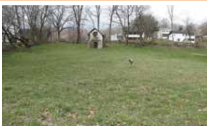
MLS# 59610 - North Street - 1 of the limited number of single family/multi-family approved lots in the Wytheville town limits. $20,900