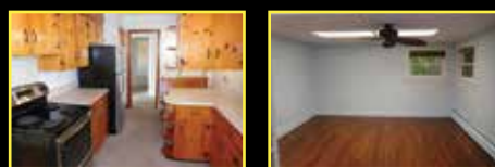
MLS# 59961 WYTHEVILLE 4BD/2BA home on 0.46 ac. in quiet neighborhood with mountain views. Security system. HW, carpet, vinyl flooring. Full, partially finished basement. Workshop/Garage.