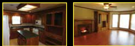
MLS# 60150 WYTHEVILLE 4BD/3BA 2,660 sq. ft. home on 3.2 ac. Sunroom, office/rec. area. Great natural light, Bonus area above garage. Large pantry and butler room off the kitchen.