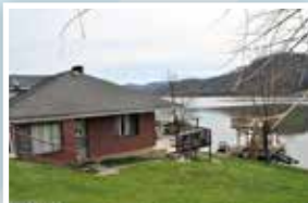
MLS # 327993- Draper $289,900

Well maintained and beautiful 5 bedroom 3 bath home! Hardwood flooring, ceramic tile, gas log fireplace. Finished walk-out basement. Main level and basement laundry, tank-less water heater.