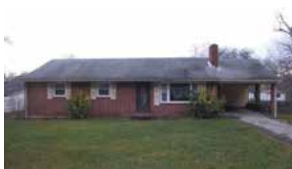
MLS# 59405 - 3BR custom brick ranch, hand crafted kitchen equipped with stainless steel appliances along with side by side washer and dryer, h/w along with tile floors, fenced back yard and partial basement. $117,900