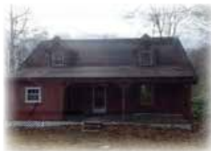
MLS# 59192 LAUREL LANE 6 bedrooms, 3 baths, 3091 SF on 4.12 acres..... $79,900