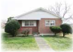
MLS# 57981 W. RIDGE RD 3 bedrooms, 2 baths, 1803 SF on 0.13 acres..... $95,400