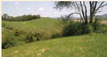
MLS# 59934 - AUSTINVILLE 12+ Ac., beautiful home site, livestock permitted, road frontage, perked, easy access, approx. 70% open, can be divided, gorgeous views. $55,500