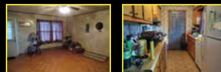
MLS# 60079 AUSTINVILLE 3BD/2BA home on 0.34 ac. Full basement with one finished room that could be 4th Bedroom if needed. Metal roof, attached 1 car garage, outbuilding. (Joins MLS 60078)