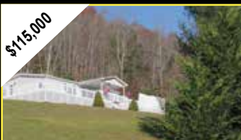
MLS# 58176 WYTHEVILLE 3BD/2BA home on 5 ac. Wood tongue-in-groove wall covering, open floor plan, with wrap around deck, detached 2 car garage and wrap around deck. Furniture also for sale.