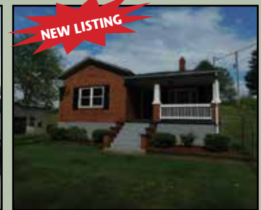
$84,900 - MLS# 60143 CHECK OUT THIS NEAT AS A PIN 3 BEDROOM, 1 BATH BRICK HOME ON FULL BASEMENT IN RURAL RETREAT! THE CHARACTER OF THIS HOME SPEAKS THROUGH ITS ARCHES AND HARDWOOD FLOORS.