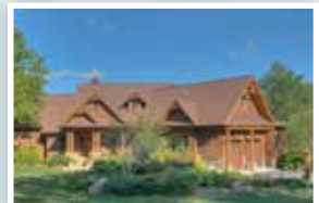
MLS # 325529- Laurel Fork $800,000

Business opportunity! Sitting on over 4 ACRES stands a 4,800 sq. ft. building with a kitchen, classrooms, 2 full bathrooms and 2 half baths. Also, 1,674 sq. ft. double-wide on the property. Great location for a daycare, medical offices, public water & sewer. HVAC has LP backup.