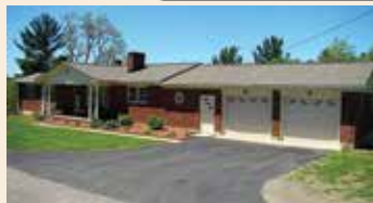
MLS# 60119 - HILLSVILLE 4 BR, 2 BA, 2000 SF, 16 ac, laminate wood floors, remodeled, new kitchen cabinets/appliances, new BA fixtures & tile, brick FP, large 2 car garage, separate carport, mountain views. $195,000