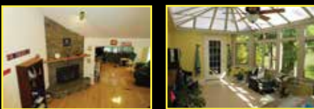
MLS# 60069 WYTHEVILLE 3BD/2.5BA home on an acre. Private, but close to town. Master suite on first floor with 2 walk in closets. Formal dining area, concrete drive. Sunroom.