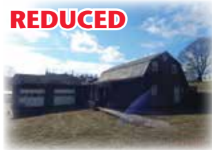
REduced MLS# 58695 BRONCO RD. 4 bedrooms, 2 baths, 2700 SF on 8.98 acres..... $52,900