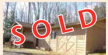
MLS# 54719 - WYTHEVILLE 2 BR, 2 BA, ranch on 6 acres, HW, custom wood cabinets/ doors, LG attached garage, walk-out bsmt, priced at tax assessment. $149,900