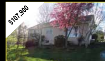
MLS# 59617 WYTHEVILLE 4BD/2BA home in town of Wytheville. Priced below tax assessment. 3BDs downstairs, 1 upstairs with room for 5th BD if needed. Landscaped backyard, view out front.