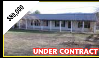
MLS# 59754 CROCKETT 2BD/1BA 1,597 sq. ft. home on 0.48 ac. HW and laminate floor. Lots of room. Mudroom and 2 walk in pantries, another private room could be made into 3BD.