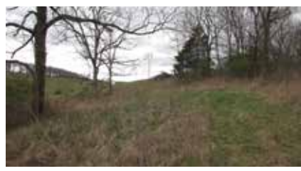
Almost 6 acres private building lot, just outside of town limits, lot is private and secluded in a small community of neighbors. Motivated sellers. $68,500