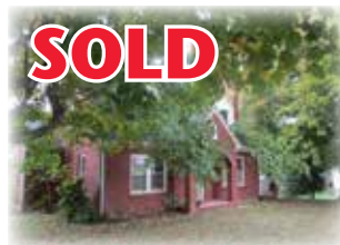
SOLD MLS# 57989 LEAD MINE RD. 4 bedrooms, 1 bath, 1404 SF on 1 acre..... $59,900