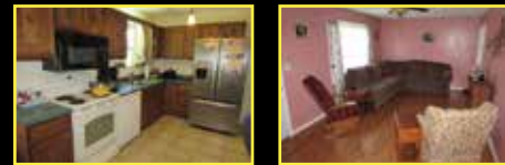
MLS# 60123 RURAL RETREAT 3BD/2BA home on just under half an acre. Partially finished heated basement that includes additional bedrooms and family room. Drive under carport can be easily converted into a large porch for entertaining.