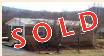
MLS# 58803 - WYTHEVILLE 3 BR, 2 BA, 1/2 Ac. Lot, HW floors, large finished space in basement, recent bathroom & kitchen updates, heat pump, metal roof, over 400 sq. ft. patio space. $125,000