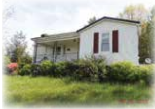
MLS# 56952 SKYLINE HWY 3 bedroom, 2 bath, 1368 SF..... $54,900