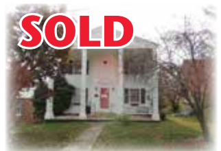
SOLD MLS# 58839 7TH ST. NW 3 bedrooms, 1.5 baths, 1648 SF..... $6,000