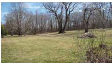
MLS# 59419 - 9.88 acres of wooded land in town limits with public water/sewer available. Can be single or multifamily living. to the interstate. Land is in 2 tracks with a 50' ROW off of Chinquapin. There is about 1 acres cleared land with current survey.