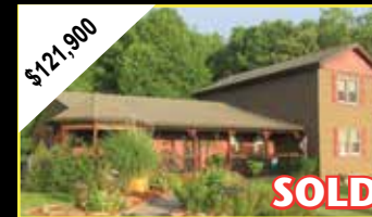
MLS# 56856 FRIES 4BD/2BA home on 1.42 ac. in a private setting minutes from New River. Move in ready, beautiful kitchen and option to have add'l 5th bed if needed.