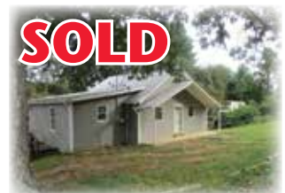
SOLD MLS# 57522 POPLAR KNOB 2 bedrooms, 1 bath, 852 SF on 0.58 acre..... $17,400