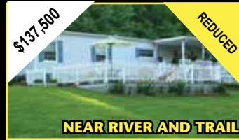
MLS# 59242 AUSTINVILLE 3BD/2BA home on 3.5 ac, master suite w/ his/her side bath with walk in closet. Pantry, laundry sink. Outside you have a huge porch that turns into a deck with a built in pond and 2 car garage.