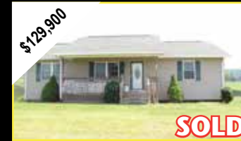
MLS# 57350 ELK CREEK Like new condition w/ bar area in kitchen and open to the LR. Vaulted ceiling. Split BRs w/ MBR on one side and other 2 BR/BA on the other end home. Unfinished bsmt, garden area.