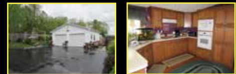
MLS# 59981 RURAL RETREAT 3 BD/2BA doublewide in nice neighborhood. Formal living room, family room, kitchen, breakfast area. Master suite has private area for nursery, office, or den. 2 car detached garage.