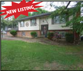
$159,900 - MLS# 60203 4BR 2BA HOME LOCATED JUST OUTSIDE OF KING HILLS. COME ENJOY THE SPECTACULAR VIEWS AND COMFORTABLE SETTING. LARGE YARD HOSTS MULTIPLE MATURE TREES.