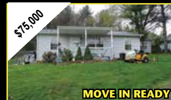
MLS# 58016 WYTHEVILLE 2 BR/1 BR home close to Sheffey School. Home has been remodeled and is move in ready. Private lot.