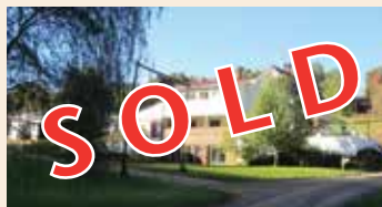
MLS# 59376 - RURAL RETREAT 7 BR, 3 BA, 5392 sq. ft., 42.75 ac., large BRs, family room, camp facility, 3-bay detached garage, large pavilion, playground equipment, outbuildings, bunk house, RV hookups, 3 ponds. $185,000