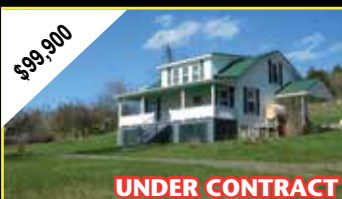
MLS# 59606 MAX MEADOWS 4BD/1BA home on 9.5 ac overlooking a stream. Metal Roof, Updated bath, and large kitchen. New flooring in part of home as well.