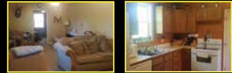
MLS# 60052 RURAL RETREAT 2BD/1BA home on 1.13 ac. Very nice for downsizing or starter home- all on one level. Master has walk in. Wood cabinets and eat in kitchen. Outbuilding.