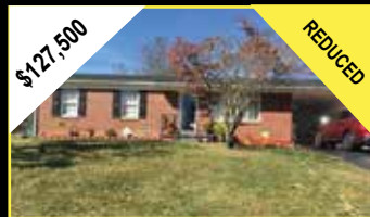
MLS# 58457 WYTHEVILLE 3BD/2.5BA brick ranch on 0.32 ac. Room in full bsmt could be made into 4th BD. Bsmt is partially finished with another storage/utility room and an additional storage building outside.