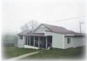
MLS# 53789 RACCOON RUN 2 BR, 1 BA, 1290 SF on 0.50 acre..... $46,600