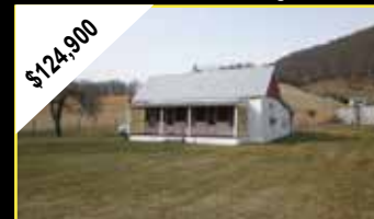
MLS# 49652 CERES 3BD farmhouse on 29 acres with hardwood beneath the carpeting and several outbuildings.