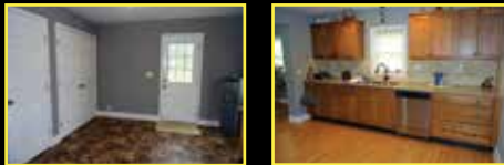
MLS# 60045 LAMBSBURG 3BD/2BA home on 0.75 ac 2 min from I-77. Granite counters and formal dining area. A mudroom that could be another bedroom, or extra living space. Master suite with 2 huge closets.