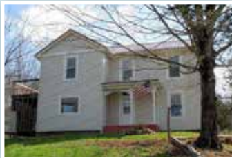
MLS # 327727- Hiwassee $159,900

Home on a huge lot in the Town of Wytheville! Spacious corner lot with nice landscaping and mature trees for privacy. Main level living on over 1700 sq. ft! Three bedrooms, two full baths, garage and so much more!!