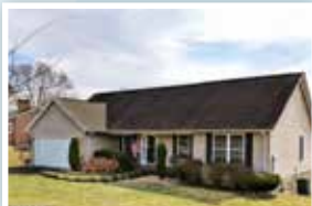
MLS # 326952- Dublin $229,000

Spacious home sitting on over 6 ACRES! 4 bedrooms 3 baths, large kitchen and dining, hardwood flooring, ceramic tile, deck with gazebo, pool, 56' front porch, two carports and paved driveway.