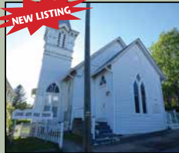
$144,900 - MLS# 60110 BEAUTIFULLY PRESERVED HISTORIC CHURCH IN THE HEART OF DOWNTOWN RURAL RETREAT. METICULOUSLY MAINTAINED WITH OVER 2400 SQ FT OF FINISHED SPACE.