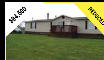
MLS# 55040 MAX MEADOWS 3 BR 2 BA home on 5 fenced acres. LR, kitchen, and dining room are centrally located, 10x13 bonus room, fireplace, covered back porch.