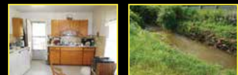
MLS# 60018 FORT CHISWELL 2 BD/1BA home on 2.94 ac. with a creek along the front of the property. Perfect mini-farm opportunity. Bath in home has been remodeled. New oil furnace.