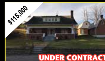
MLS# 58710 CROCKETT 3BD/2BA, 0.7 ac., restored home. LG rooms, refinished HW floors, crown molding, French doors. Walk in closets, SS appliances, LG front porch & multiple storage buildings.