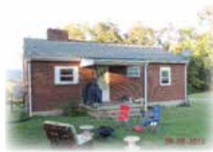
MLS# 57807 PEPPERS FERRY RD. 2 bedrooms, 1 bath, 972 SF on 0.64 acre..... $96,500