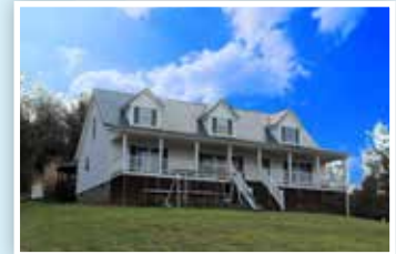
MLS #328020- Pearisburg $225,000

Townhome located in Old Mill Golf Resort. Featuring 2 bedroom 2 full bath, brick gas log fireplace, gourmet kitchen, main level laundry. Close proximity to The Primland Resort & Spa, Chateau Morrisette Winery, The towns of Meadows of Dan, Floyd & Fancy Gap, Buffalo Mountain Nature Preserve & Hiking Area, Areas for shopping for local produce and the crafts of local artisans.