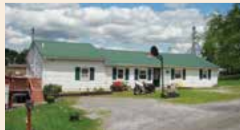
MLS# 60240 - RURAL RETREAT 5 BR, 2 BA, Investment Property, 1440 sq. ft. home currently serves as 2 apartments, property can be opened up for one family dwelling or creative commercial use. $79,900