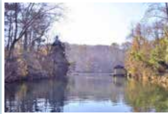
MLS # 326189- Pulaski $99,900

Would make nice rental. 3 bedroom 1 bath, hardwood floors, heat/AC. Conveniently located to shopping, interstate access and more.