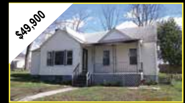
MLS# 58473 WYTHEVILLE 4BD/2BA 2,500 sq ft home on 0.34 ac. Additional room could be 5th BD, office, etc. Sunroom style room with lots of natural light, screened porch, and outbuilding with large patio area.