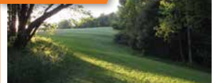
MSL# 59973 - Sylvatus Hwy - 42+ acres of rolling/sloping land. All timber is still in tack. Can you see your dream home in the middle of the land a road winding through the trees to your home, or the land offer over 1100 ft of rd frontage so you could divide the property into smaller tracks of land and sell building tracks. Interested buyers/developers bring offer! $169,950