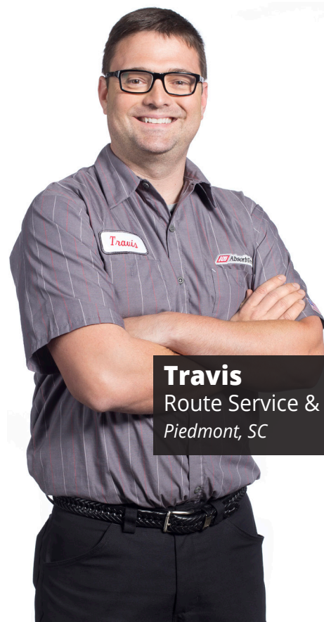
Travis Route Service & Sales Piedmont, SC