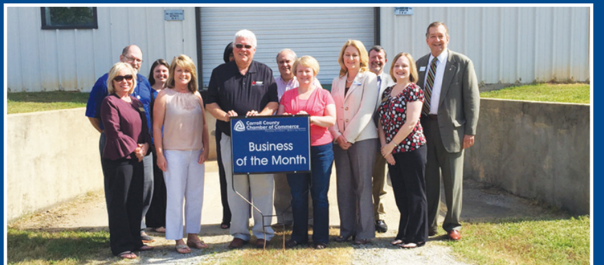
D & P Services