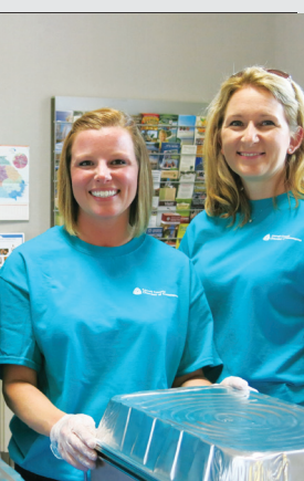
On The Chamber