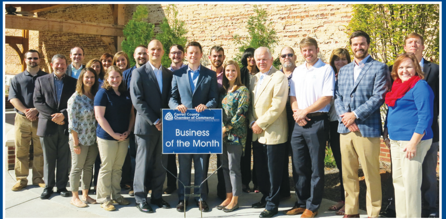
GreenCourt Legal Technologies