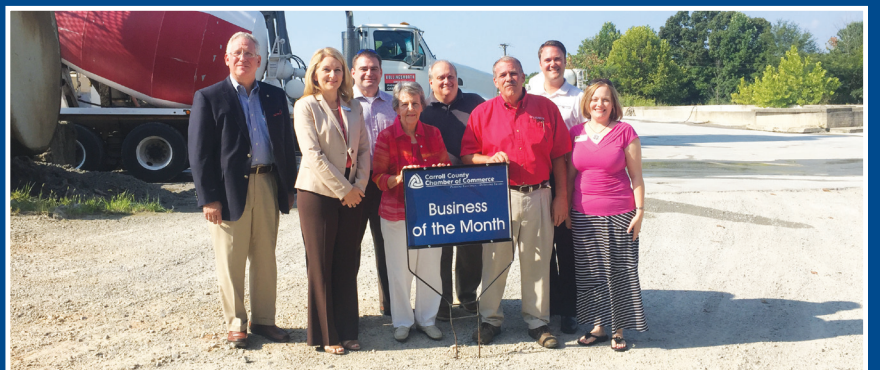
Hollingsworth Concrete Products