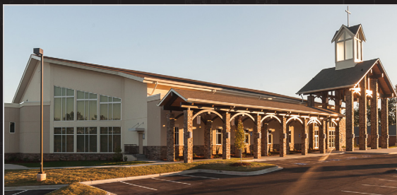
Roopville Road Baptist Church