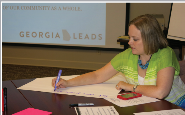
Volunteers in the GeorgiaLEADS initiative made plans for engagement activities for Leadership Academy alumni.