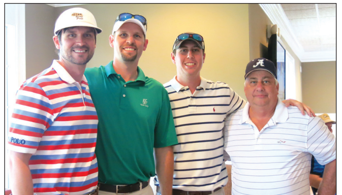
The team from the Carroll County Water Authority won first place at the annual golf tournament.