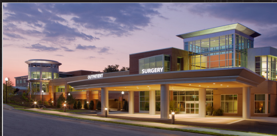
Tanner Medical Center