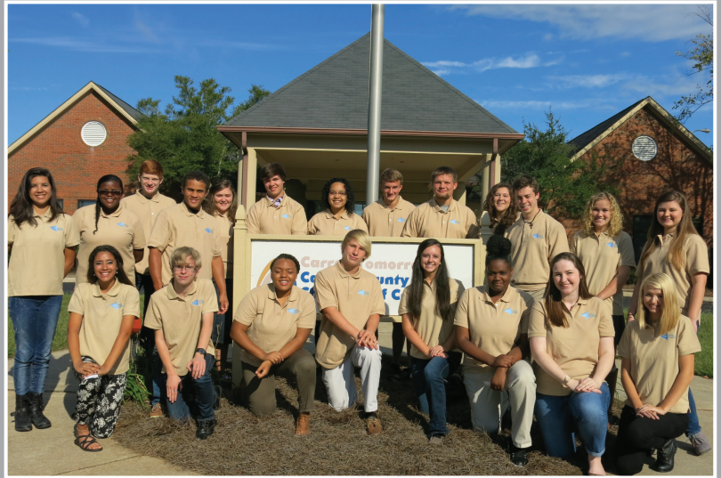
The Carroll County Junior Chamber of Commerce kicked off with 21 students selected to participate in an eight-month leadership program teaching personal leadership skills, team building and community asset development.

The Carroll County Chamber was one of only 10 communities/regions to participate in GeorgiaLEADS, an inaugural program led by the Georgia Chamber and the J.W. Fanning Institute to initiate and expand community leadership programming. A volunteer committee spent six months evaluating needs in the county and chose to focus on a youth leadership program and an expanded adult leadership program.