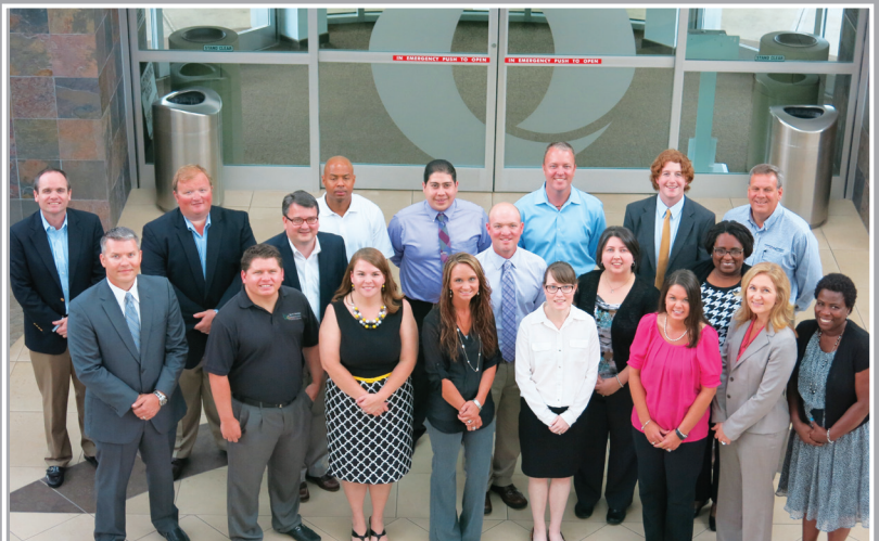
The Carroll County Chamber of Commerce Leadership Academy Class of 2015.