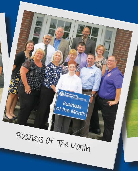
Business of The Month