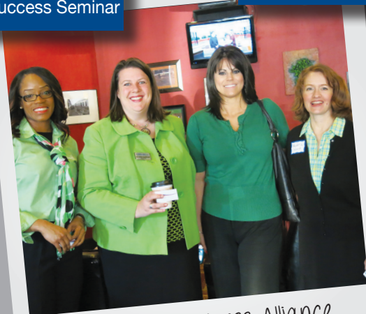
Women's Business Alliance