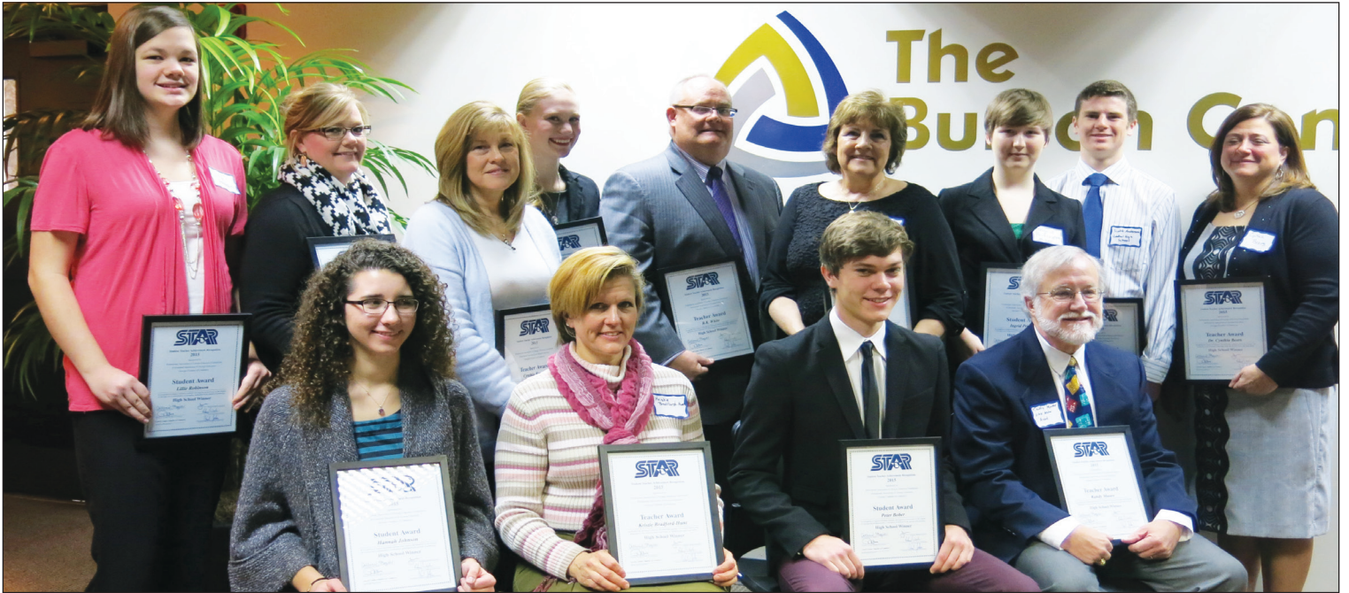
The Carroll County Chamber hosted the 2015 STAR Student/Teacher Achievement Recognition honoring students and teachers from the Carroll County School System, Carrollton City School System and Oak Mountain Academy.