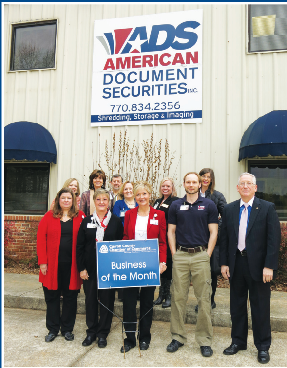
American Document Securities