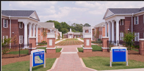
University of West Georgia Greek Village