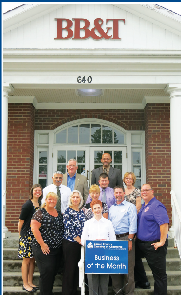
BB&T of Villa Rica