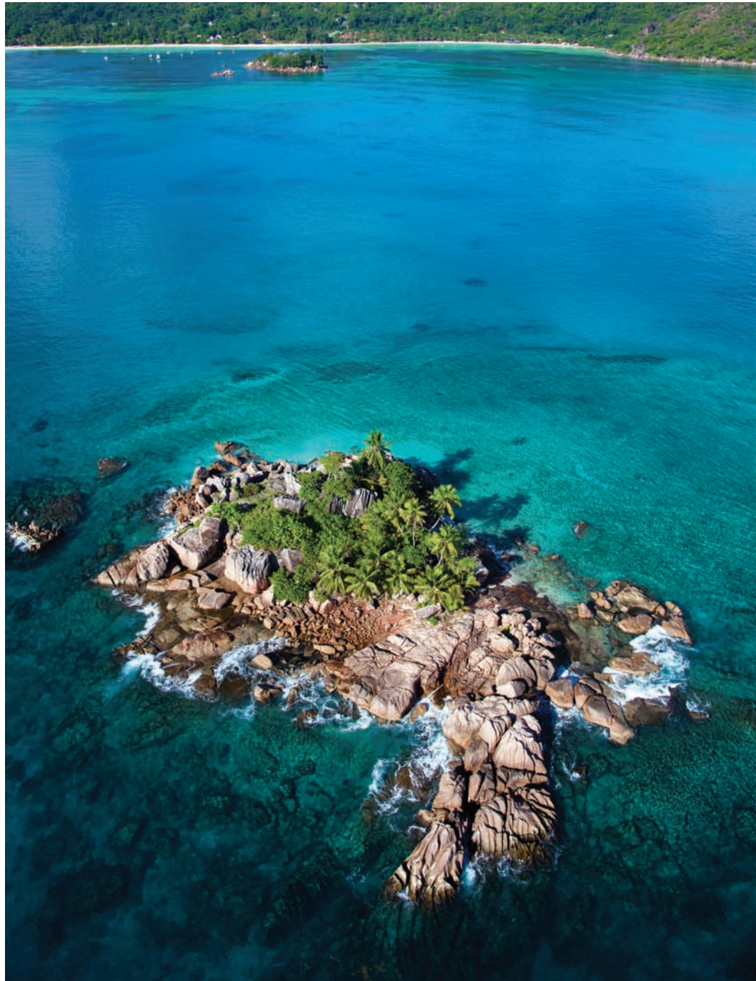
St Pierre Island