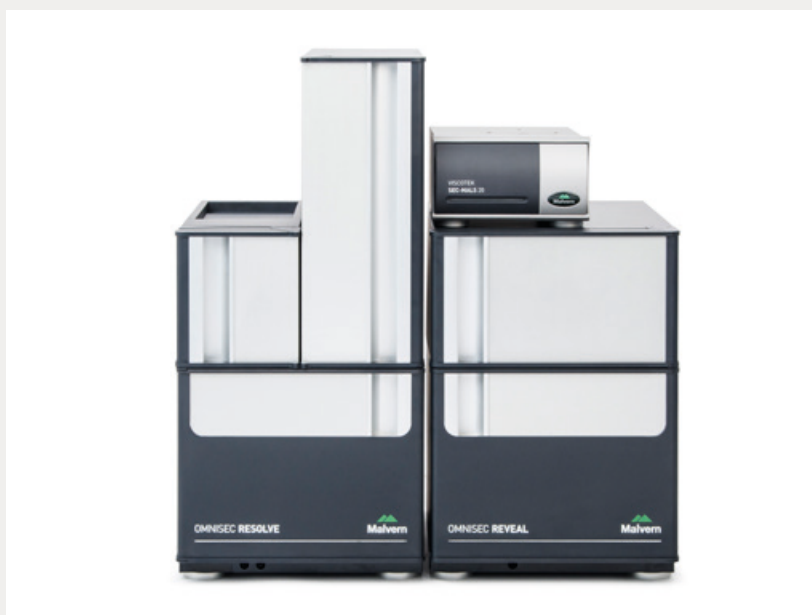
Compatible with any GPC/SEC system, including the Malvern OMNISEC system