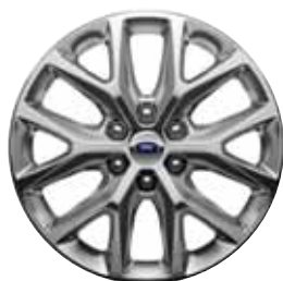
20" Polished Aluminum Standard