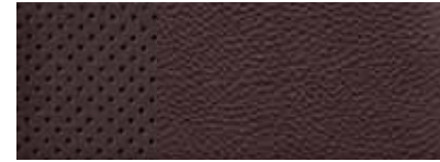
7 Mesa Brown Leather with Perforated Inserts