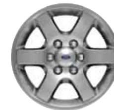
17" Aluminum Standard on XL