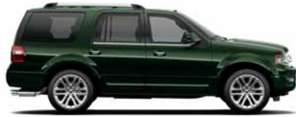
Green Gem Metallic