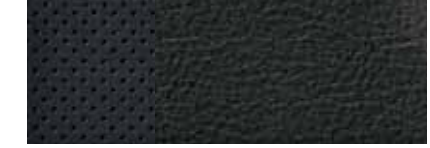
6 Ebony Leather with Perforated Inserts