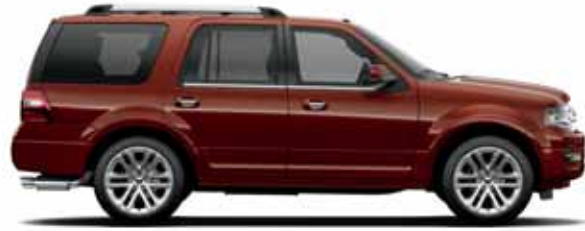
Bronze Fire Metallic