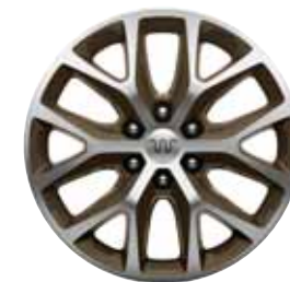
20" Bright-Machined Aluminum with Caribou-Painted Pockets and King Ranch Center Caps Standard

22" polished aluminum wheels with King Ranch center caps (includes continuously controlled damping [CCD] suspension) 2nd-row bucket seats 3.73 non-limited-slip rear axle (all non-EL and EL 4x2 only) All-weather floor mats in 1st and 2nd rows Control Trac® 4-Wheel-Drive (4WD) System (includes Hill Descent Control™) Dual headrest DVD by INVISION™ 4 Monotone Appearance Package includes monotone exterior paint and monotone power-deployable running boards