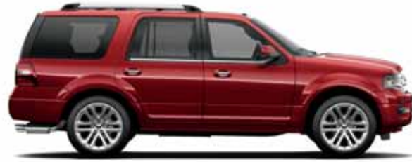
Ruby Red Metallic Tinted Clearcoat