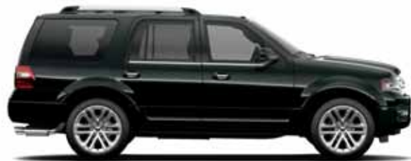
Tuxedo Black Metallic