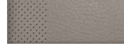
5 Dune Leather with Perforated Inserts