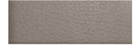
3 Dune Leather