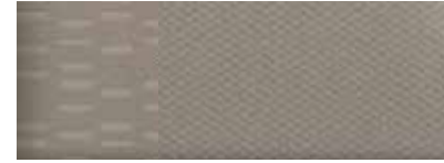
1 Dune Cloth