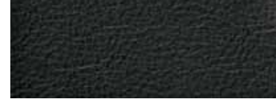
4 Ebony Leather