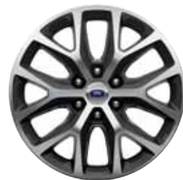
20" Bright-Machined Aluminum with Magnetic-Painted Windows Optional on XLT