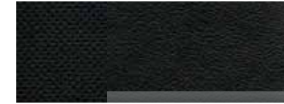
8 Ebony Luxury Leather with Perforated Inserts and Agate Tuxedo Stripe