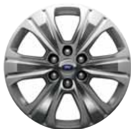
20" Polished Aluminum Standard