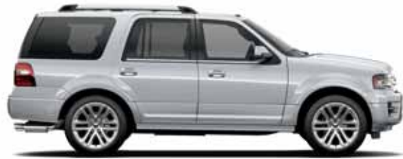
Ingot Silver Metallic