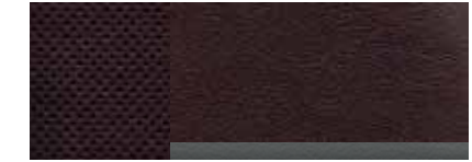
9 Brunello Luxury Leather with Perforated Inserts and Agate Tuxedo Stripe