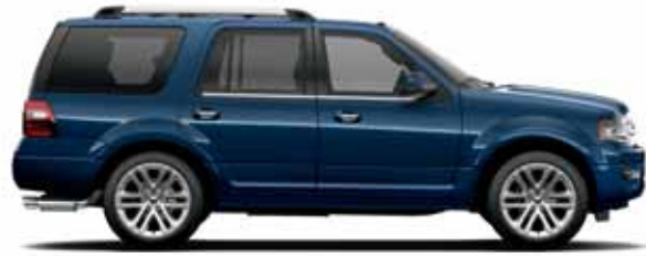
Blue Jeans Metallic