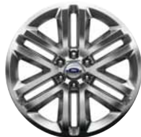
22" Polished Aluminum Optional

Brunello luxury leather trim with perforated inserts. Available equipment.