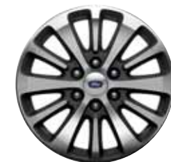
18" Machined Aluminum Standard on XLT