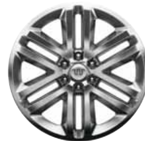
22" Polished Aluminum with King Ranch Center Caps Optional