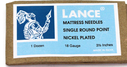
# 18G-3.5-MA CURVED MATTRESS NEEDLE (PACK OF 144)