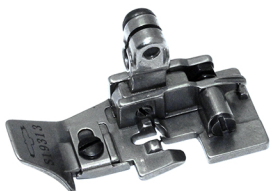
# S19313-2-01 PRESSER FOOT ASSEMBLY