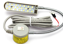
Magnetic Mount # LDA-20/NP/220V 20-LED 220V LAMP (NO PLUG)