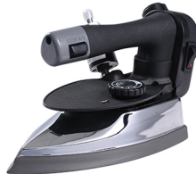
# ES-300L-110V-S GRAVITY FEED STEAM IRON