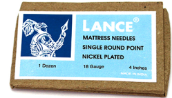
# 18G-4-MA CURVED MATTRESS NEEDLE (PACK OF 144)