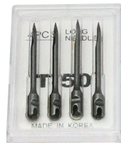
# K599 LONG STAINLESS STEEL NEEDLE KIT (4 PCS) FOR TACH-IT GUN