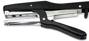
# P3-BOS BOSTITCH STAPLER PLIER