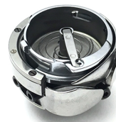
# 0767-150754E-Z HOOK