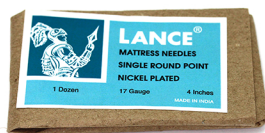
# 17G-4-MA CURVED MATTRESS NEEDLE (PACK OF 144)