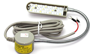
Magnetic Mount # LDA-820MD/UV 20-LED (10 LED/10 UV) 110V/220V LAMP WITH SWITCH (NO PLUG)

Custom make zippers to your exact length requirements. Roll can be cut to desired length. Includes 12 zipper pulls.