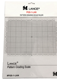
# PGS-1-LAN PATTERN GRADING SCALE