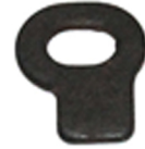
# 274019 FLAT SPRING