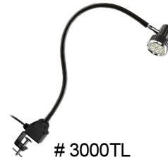
# 3000TL 26" UBER LED 110V LAMP WITH C-CLAMP (NO PLUG)