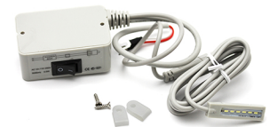
Magnetic Mount # LDA-806ML 6-LED STRIP 110V/220V LAMP (NO PLUG)