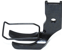
# B-1525-241-H00 PRESSER FOOT ASSEMBLY