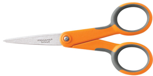
# F9888 FISKARS 5" PREMIER SOFT GRIP MICRO TIP SCISSOR