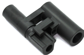
# S37992-1-00 BOBBIN WINDER ARM