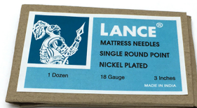
# 18G-3-MA CURVED MATTRESS NEEDLE (PACK OF 144)