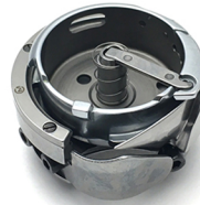
# 0867-150514E-Z HOOK M-TYPE