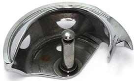
# S15662-9-91E-Z SHUTTLE HOOK "F" LRG ASSM LA