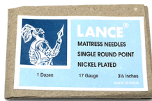
# 17G-3.5-MA CURVED MATTRESS NEEDLE (PACK OF 144)