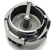
# 0867-150754E-Z HOOK (M) STANDARD