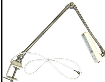
# LDA-98TSC/220 40-LED 27" CANTILEVER 220V LAMP WITH C-CLAMP (NO PLUG)