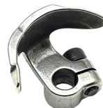
# 400-14963 SHUTTLE DRIVER ASSM