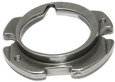
# 141-03352 INNER HOOK PRESSER ASSEMBLY