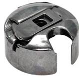
# CHK-HC000500 BOBBIN CASE