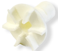
# 148849-0-01 PUMP PROPELLER