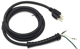
# ES-85-19924 POWER CORD ONLY (110V)