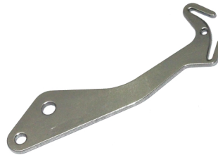
# 275016 THREAD TAKE-UP