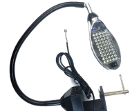
# LDA-50 50-LED 24" GOOSENECK LAMP WITH ADJUSTABLE INTENSITY (NO PLUG)