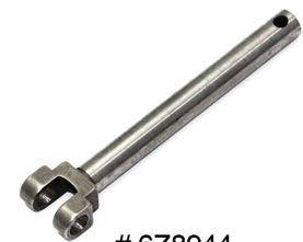
# 6Z8944 SPREADER HOLDER