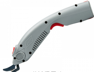
# WBT-1 RECHARGABLE ELECTRIC SCISSORS FOR KEVLAR® FABRICS AND FIBERGLASS