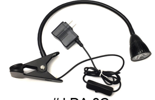
# LDA-3C 16-LED 3 WATT 110V MR LAMP WITH TABLE CLIP-ON (PLUG)