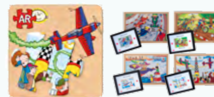
Power Puzzles E522305