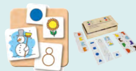
Search the Shape E522909