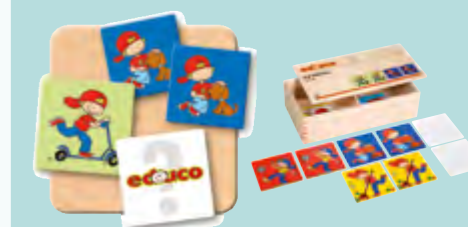
Memo Ed E523000