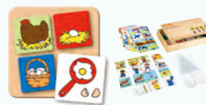
Cause & Effect E522340

Our tablet apps bring interactivity to our manipulatives, for a perfect mix of tradition and technology.