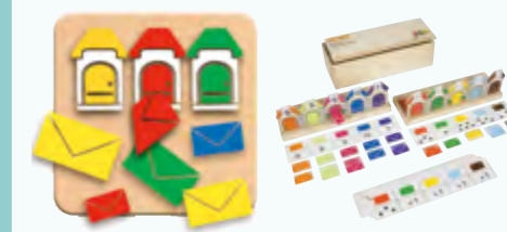
Counting Street E522340