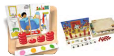
Find and Count E522884