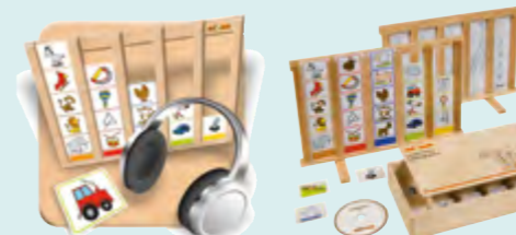
Listening Lotto E522526