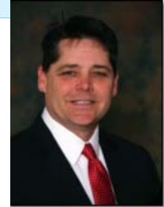
Hon. Mitch Burke

Gulf County is located in the northern part of Florida in the panhandle. Gulf was founded on June 6, 1925 and was named for the Gulf of Mexico. The county seat for Gulf is Port St. Joe which is also the largest city in the county and under its original name (Saint Joseph) had been the site of Florida's first Constitutional Convention in 1838. The county has a total area of 756 square miles of which 564 is land and 192 is water.