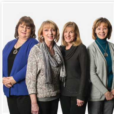
Customer Response Center