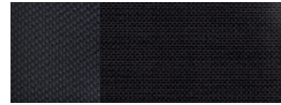
1 Charcoal Black Cloth with Dark Charcoal Black Inserts