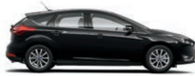
Panther Black Metallic