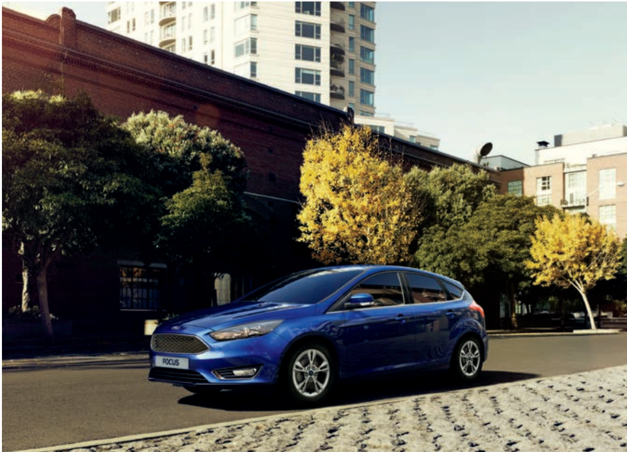
Deep Impact Blue Metallic. Available equipment.