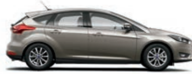
Lunar Sky Metallic