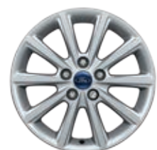
16" 10-Spoke Aluminum Standard