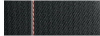
4 Charcoal Black Cloth with Red Stitching