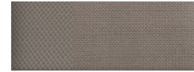
2 Medium Light Stone Cloth