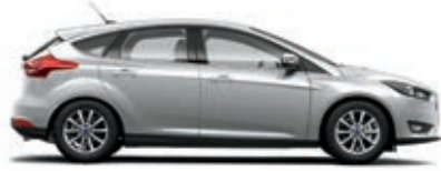
Moondust Silver Metallic