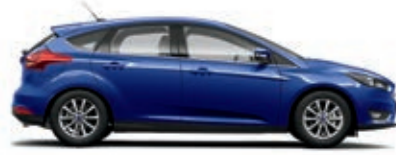
Deep Impact Blue Metallic