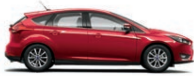
Red Candy Metallic Tinted Clearcoat