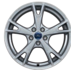
18" Aluminum Optional