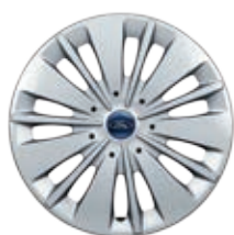
16" Steel with Mid Series Covers Standard