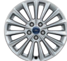
17" 15-Spoke Aluminum Optional