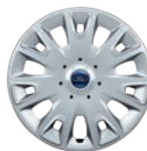
16" Steel with Low Series Covers Standard