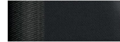
6 Unique Charcoal Black Cloth