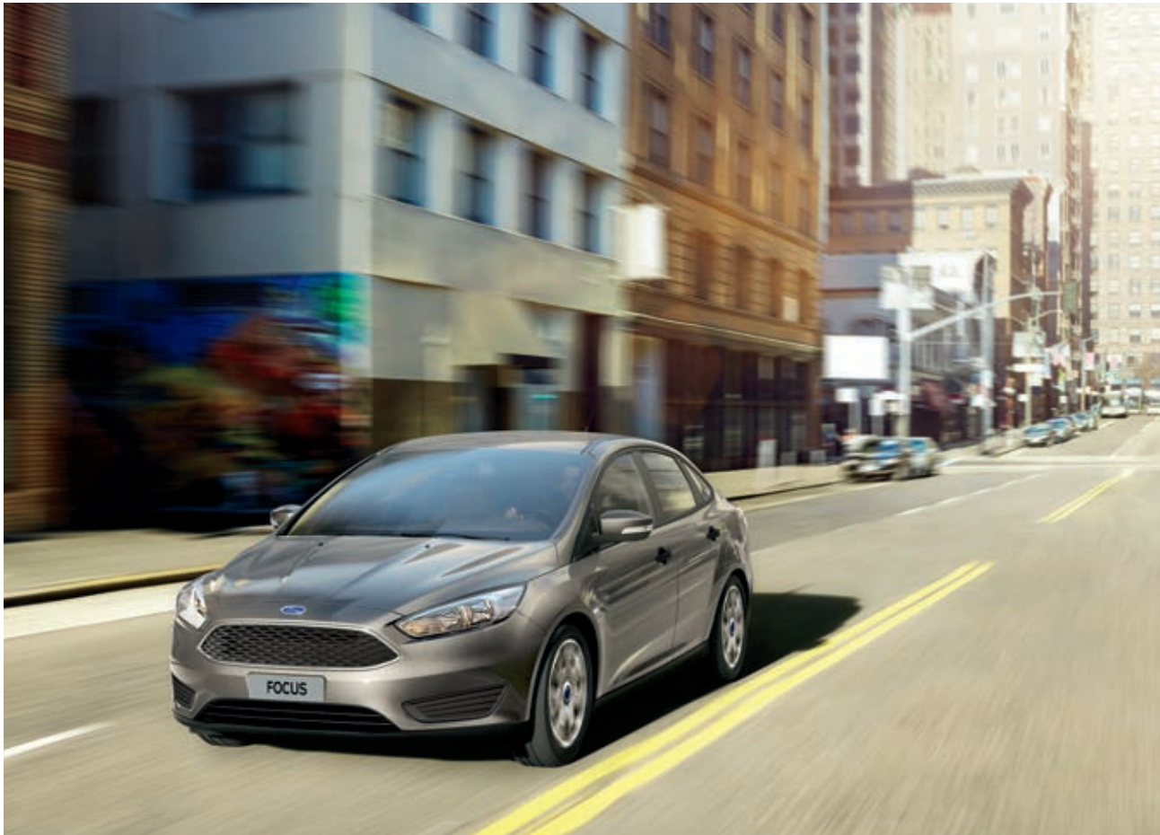
Tectonic Silver Metallic. Available equipment.