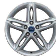
17" 5x2-Spoke Aluminum Optional