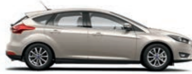
Tectonic Silver Metallic