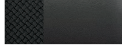
7 Charcoal Black Leather