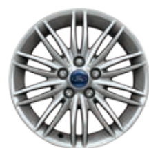
16" 10x2-Spoke Aluminum Optional