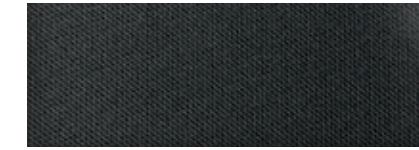
3 Charcoal Black Cloth