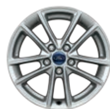
16" 5x2-Spoke Aluminum Optional