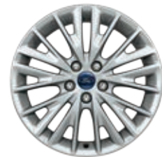
17" Aluminum Optional