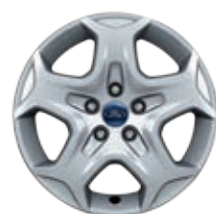
16" "Structured" Steel Optional