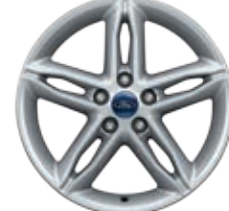
17" 5x2-Spoke Aluminum Optional