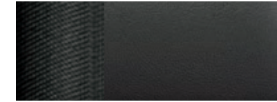
5 Charcoal Black Partial Leather