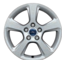
16" 5-Spoke Aluminum Optional