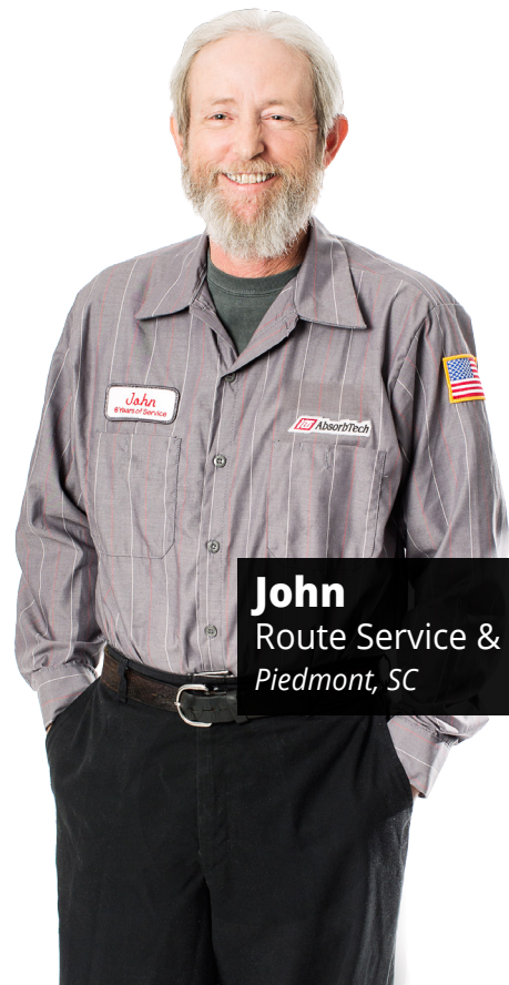
John Route Service & Sales Piedmont, SC