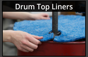
Drum Top Liners