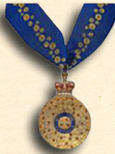
Companion of the Order of Australia