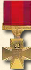
Cross of Valour