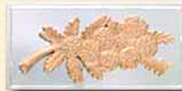
Group Bravery Citation