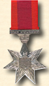
Star of Courage