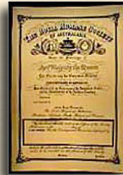
Certificate of Merit

Nominations are to be made on an Executive Briefing Note (EBN) to the QFES Honours and Awards Committee with appropriate supporting documentation and nomination forms. The Committee will review the nomination and progress for Commissioner, QFES endorsement where deemed to meet the required standard.