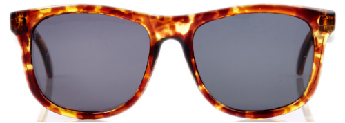
4. Tortoise sunglasses by Mustachifier, $30.