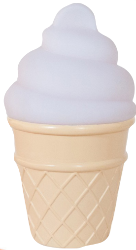
3. Ice cream light by A Little Lovely, $18.