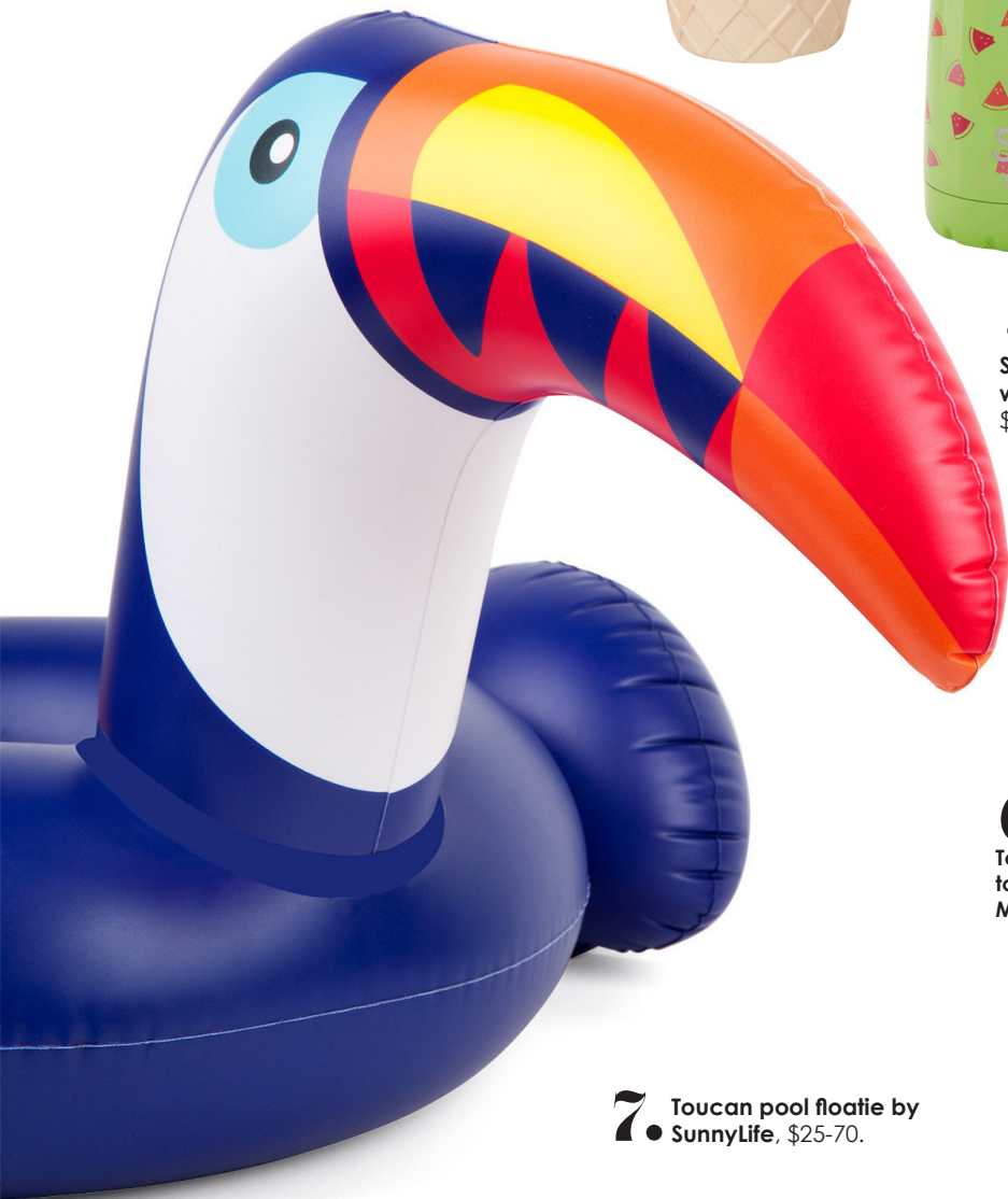
7. Toucan pool floatie by SunnyLife, $25-70.