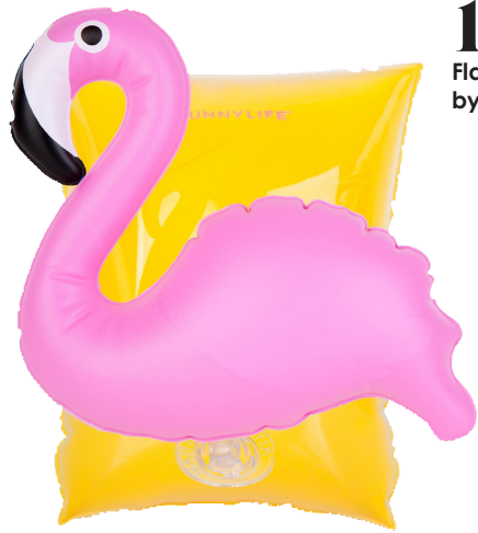
1. Flamingo floaties by Sunnylife, $11.