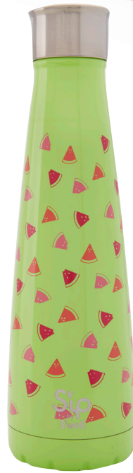
5. Sip by Swell waterbottle, $25.