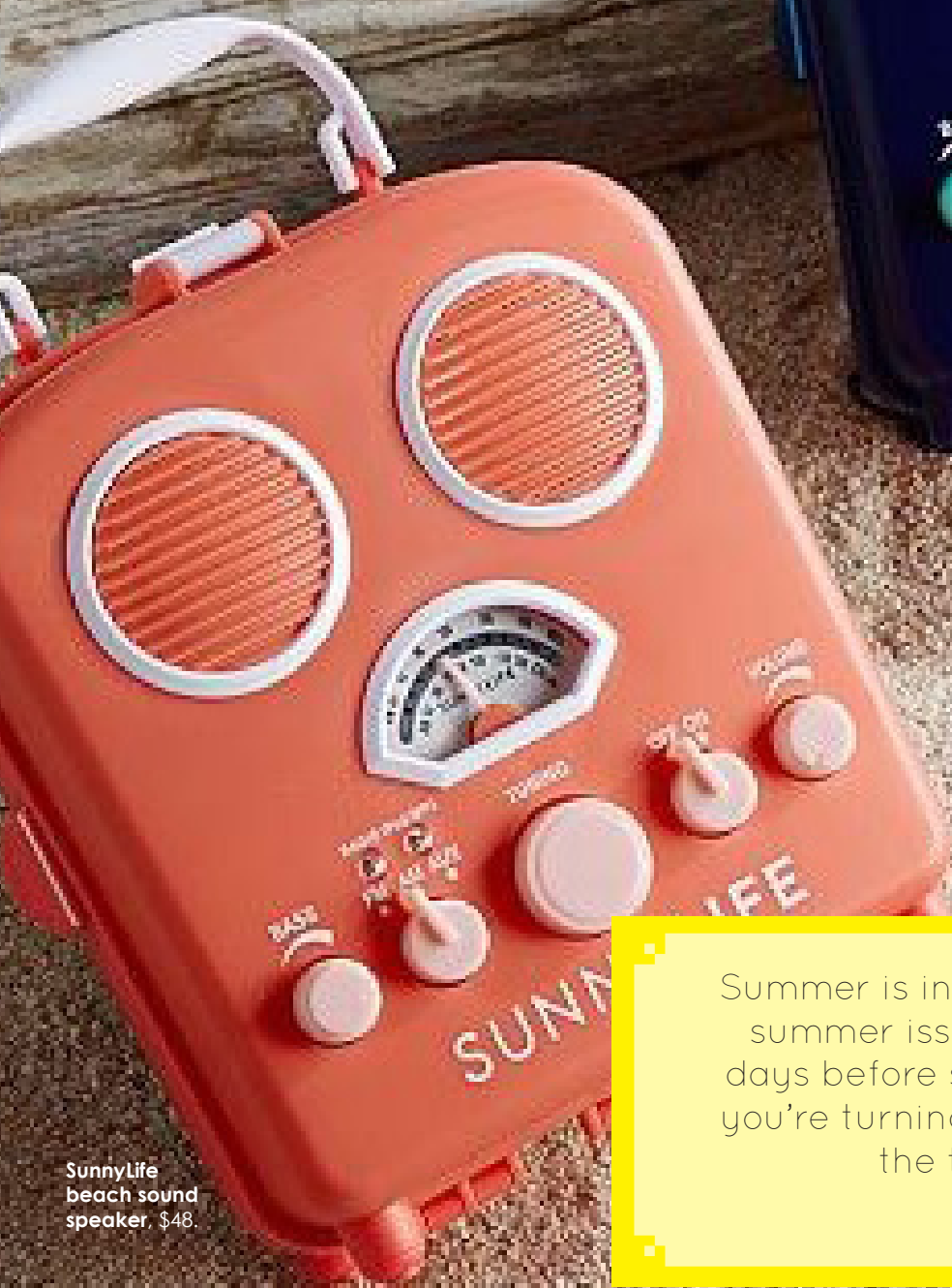
SunnyLife beach sound speaker, $48.