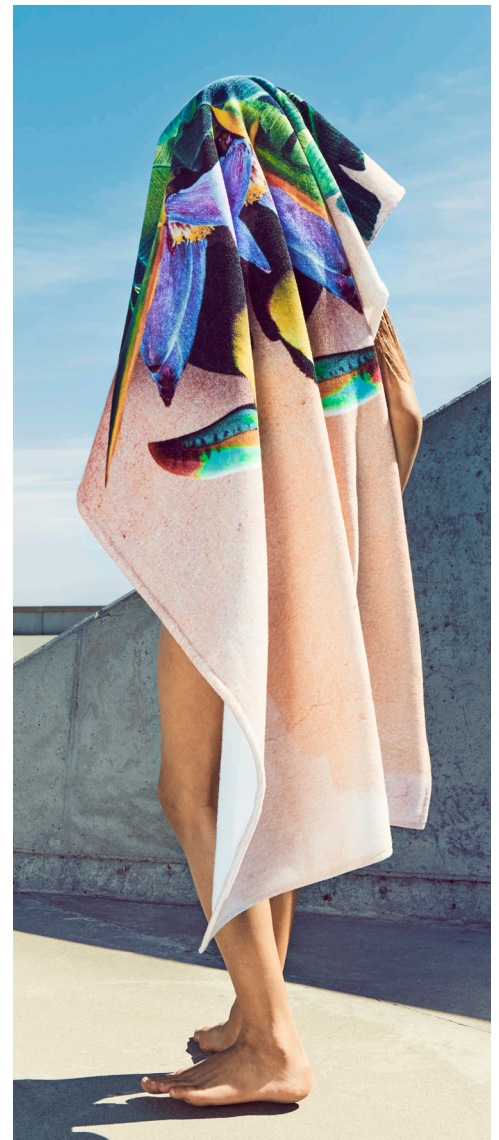
6. Toucan towel by Molo, $59.