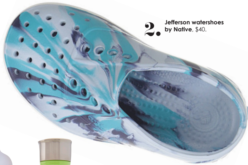
2. Jefferson watershoes by Native, $40.