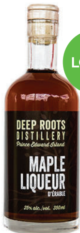
DEEP ROOTS MAPLE LIQUEUR