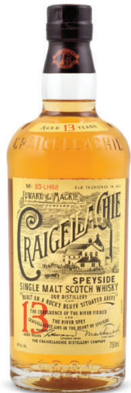
CRAIGELLACHIE 13 YEAR OLD* 03458W, 750mL $79.99