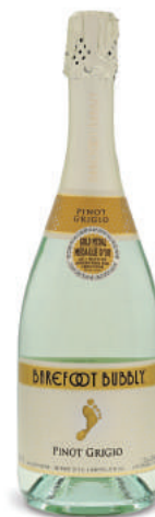
BAREFOOT BUBBLY PINOT GRIGIO 15495Z, 750 mL, $17.99