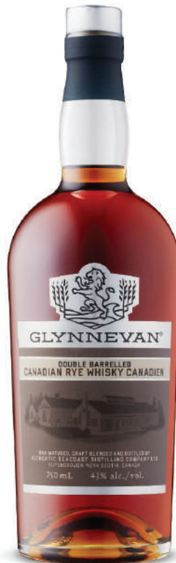
GLYNNEVAN DOUBLE BARRELLED CANADIAN RYE WHISKY* 03508W, 750mL $63.49