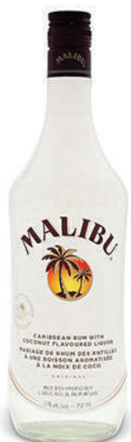
MALIBU COCONUT RUM 16470Z, 750 mL, $27.49