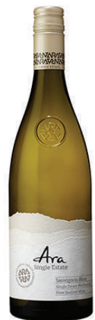
ARA SINGLE ESTATE SAUVIGNON BLANC