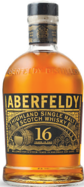
ABERFELDY 16 YEAR OLD * 03212W, 750mL $99.99

FOR MORE INFO VISIT: www.peispiritsfest.com