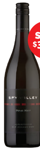
SPY VALLEY PINOT NOIR