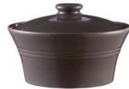
Classic Kitchen Dark Gray Casserole 85 FL. oz. 85 FL. oz. / 2.65 qt, 10 x 10 x 6 inch, Label