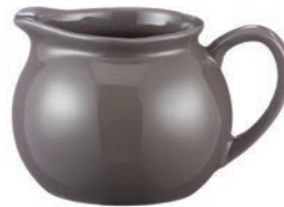
Classic Kitchen Dark Gray Creamer 11 FL. oz. / 0.35 qts, 2 x 3.9 x 4.9 inch Label