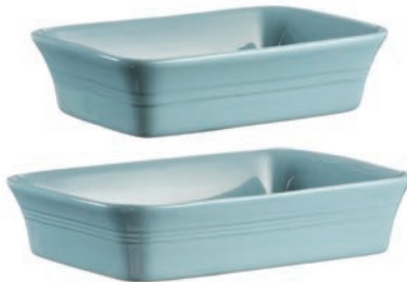
Classic Kitchen Turquoise Set of 2 Rectangular Bakers 100 FL. oz. / 3.2 qts, 12 x 8.25 x 2.75 inch, 60 FL. oz. / 1.9 qts, 10.5 x 7 x 2.5 inch Sleeve