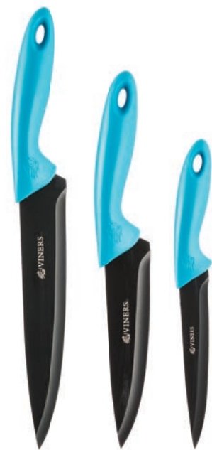
8" Carving Knife Serrated edge for breads, buns and cakes