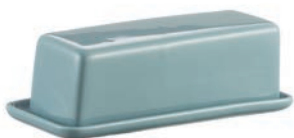
Classic Kitchen Turquoise 7.85" Butter Dish 3 x 3.25 x 7.85 inch Sleeve