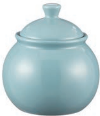
Classic Kitchen Turquoise Sugar Bowl 11.85 FL. oz. / 0.38 qts, 4.25 x 4 inch Sleeve