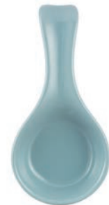
Classic Kitchen Turquoise Spoon Rest 1.25 x 3.85 x 7.85 inch Label