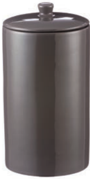
Classic Kitchen Dark Gray 9.65" Storage Jar 9 x 4.75 inch, Label