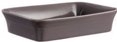
Classic Kitchen Dark Gray 12.25" Rectangular Baker 100 FL. oz. / 3.2 qts, 12 x 8.25 x 2.75 inch, Label