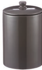
Classic Kitchen Dark Gray 6.25" Storage Jar 7.5 x 4.7 inch, Label