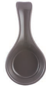
Classic Kitchen Dark Gray Spoon Rest 1.25 x 3.85 x 7.85 inch Label