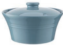
Classic Kitchen Turquoise Casserole 85 FL. oz. 85 FL. oz. / 2.65 qt, 10 x 10 x 6 inch, Label