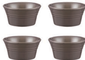
Classic Kitchen Dark Gray Set of 4 Ramekins 3.75 x 1.75 inch, 6 FL. oz. / 0.19 qt Sleeve