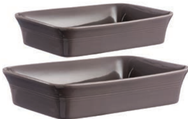
Classic Kitchen Dark Gray Set of 2 Rectangular Bakers 100 FL. oz. / 3.2 qts, 12 x 8.25 x 2.75 inch, 60 FL. oz. / 1.9 qts, 10.5 x 7 x 2.5 inch Sleeve