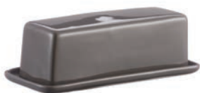
Classic Kitchen Dark Gray 7.85" Butter Dish 3 x 3.25 x 7.85 inch Sleeve