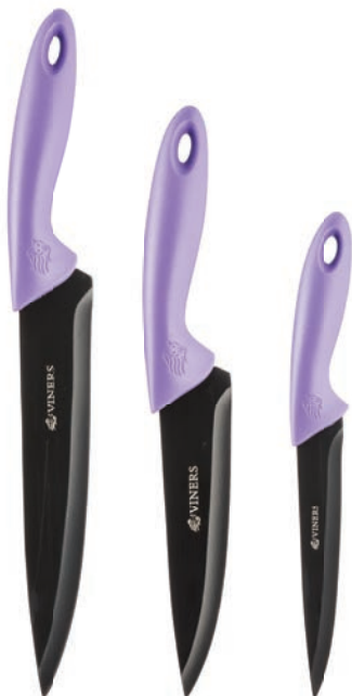
5" Utility Knife Curved smaller blade perfect for smaller jobs

Vivid 5" Blue Utility Knife 0305.163 Pack Qty. 6