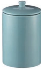
Classic Kitchen Turquoise 7.5" Storage Jar 7.5 x 4.7 inch, Label