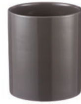
Classic Kitchen Dark Gray 5.5" Utensil Jar 5.85 x 5.1 inch, Label