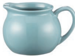
Classic Kitchen Turquoise Creamer 11 FL. oz. / 0.35 qts, 2 x 3.9 x 4.9 inch Label