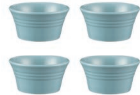
Classic Kitchen Turquoise Set of 4 Ramekins 3.75 x 1.75 inch, 6 FL. oz. / 0.19 qt Sleeve