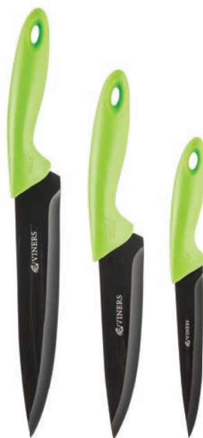
6" Chef's Knife Curved blade for precision cutting, excellent all purpose knife