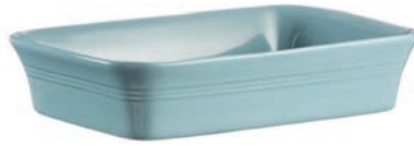
Classic Kitchen Turquoise 12.25" Rectangular Baker 100 FL. oz. / 3.2 qts, 12 x 8.25 x 2.75 inch Label

The Classic Kitchen Dark Gray and Turquoise ovenware range was originally inspired by the sculleries and kitchens of mid-19th century British manor houses, with a modern twist on color. Each shape is perfect for creating classic desserts or family meals. All are oven, microwave, dishwasher and freezer safe.