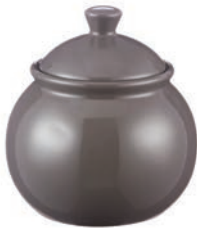
Classic Kitchen Dark Gray Sugar Bowl 11.85 FL. oz. / 0.38 qts, 4.25 x 4 inch Sleeve