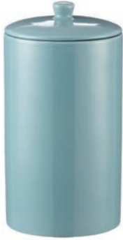
Classic Kitchen Turquoise 9" Storage Jar 9 x 4.75 inch, Label