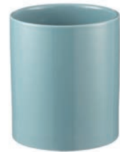
Classic Kitchen Turquoise 5.5" Utensil Jar 5.5 x 5.1 inch, Label