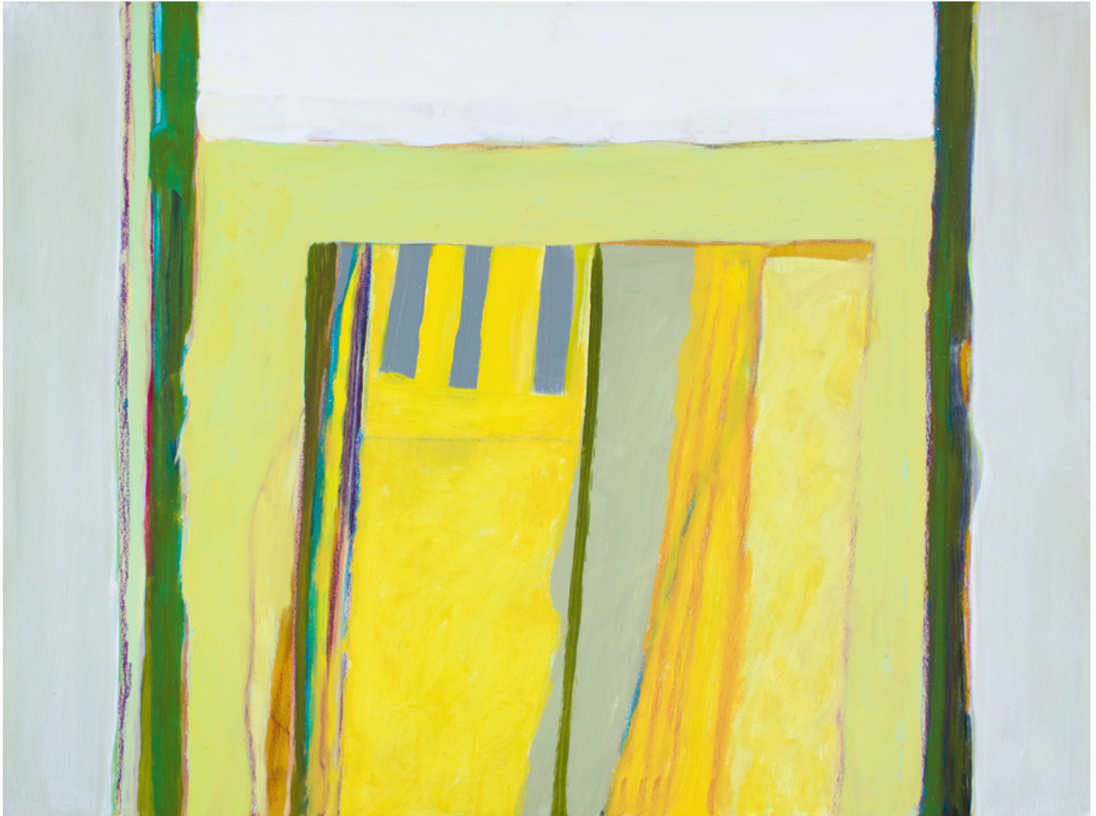
FEBRUARY: VALLEY SUNDAY 2017 Mixed Media on Canvas 30 x 40 inches