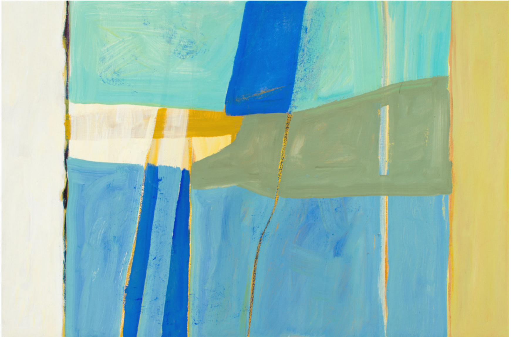
HADLEY: BLUE SPRING 2017 Mixed Media on Canvas 24 x 36 inches