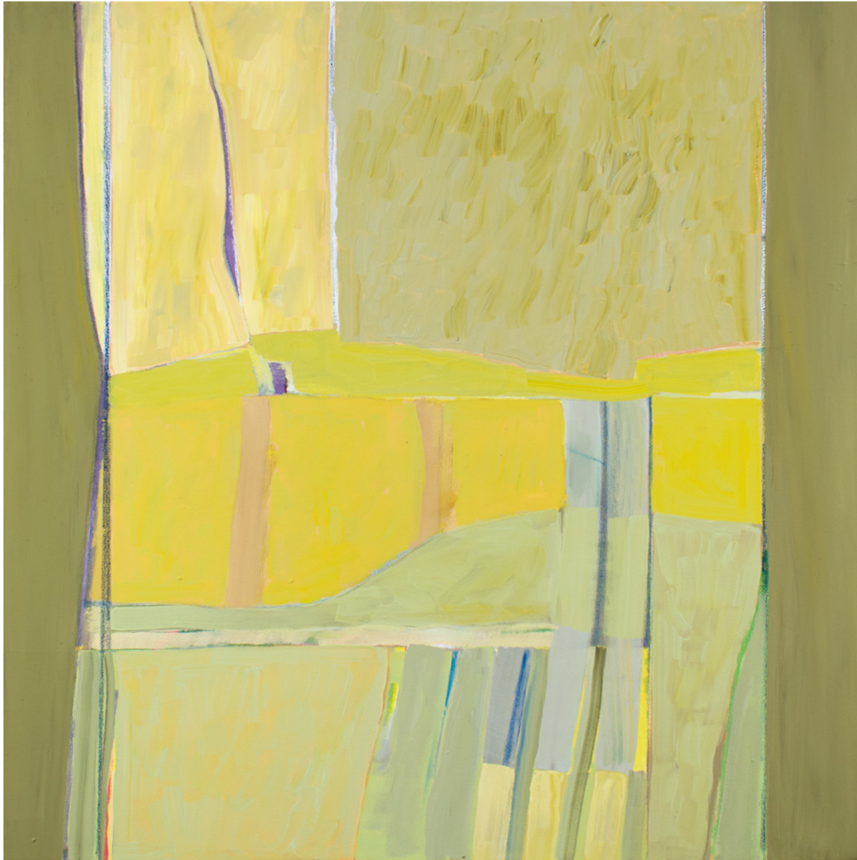
HADLEY: MARCH MORNING 2017 Mixed Media on Canvas 48 x 48 inches