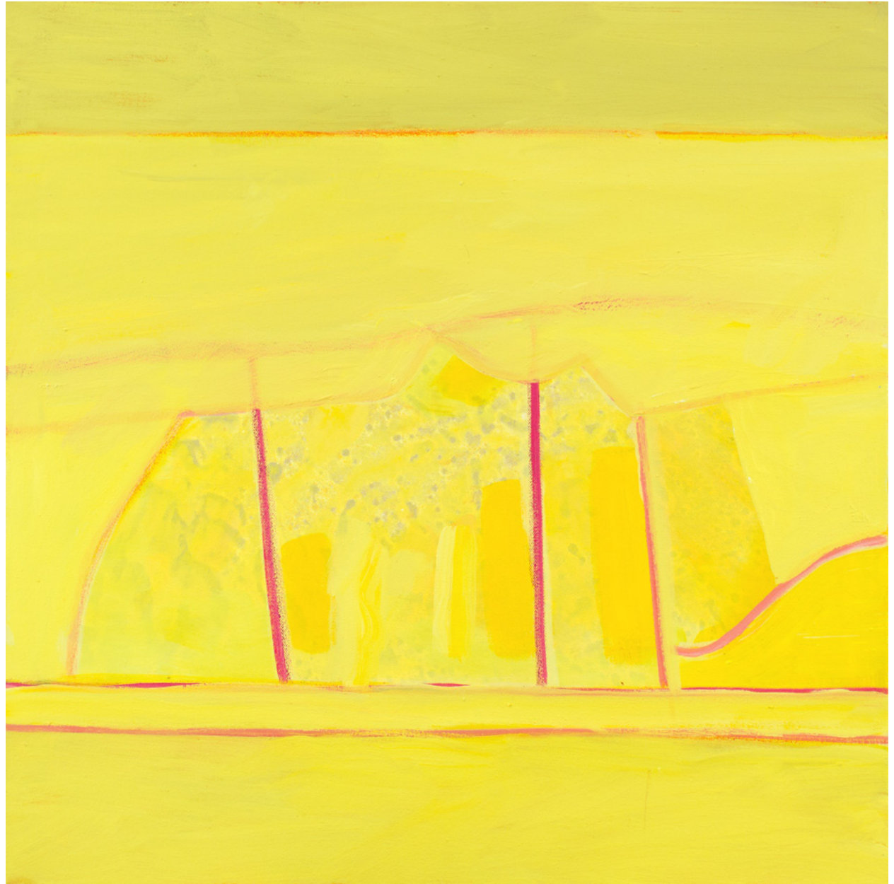
SUN FACADE-MARCH 2017 Mixed Media on Canvas 24 x 24 inches