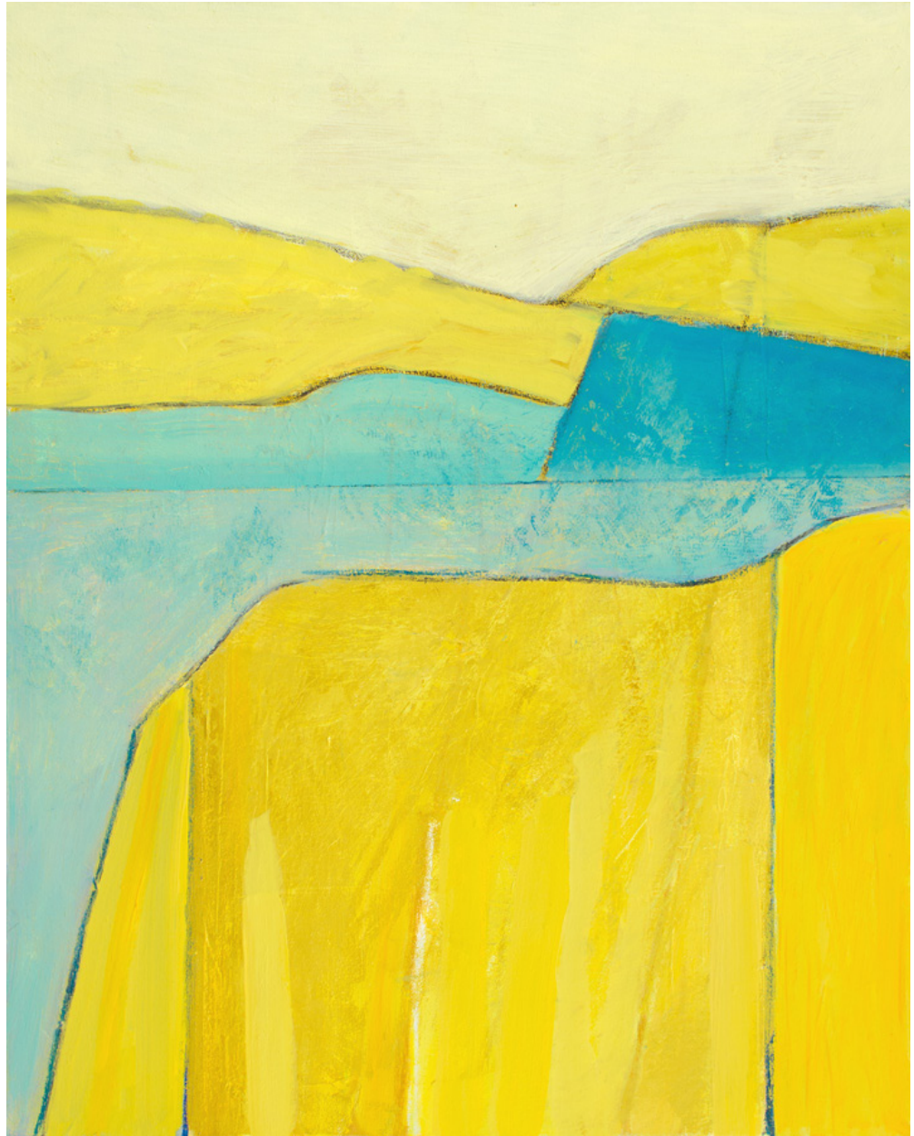
CRETE: VERNAL MORNING MOCHLOS 2017 Mixed Media on Canvas 30 x 24 inches