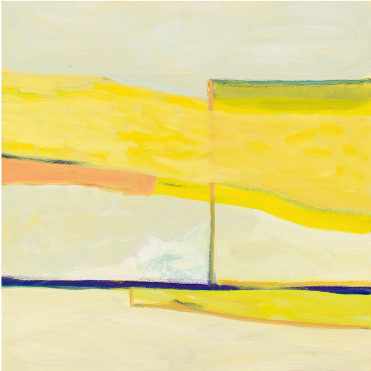
BLUE RIVER BAND 2017 Mixed Media on Canvas 20 x 20 inches