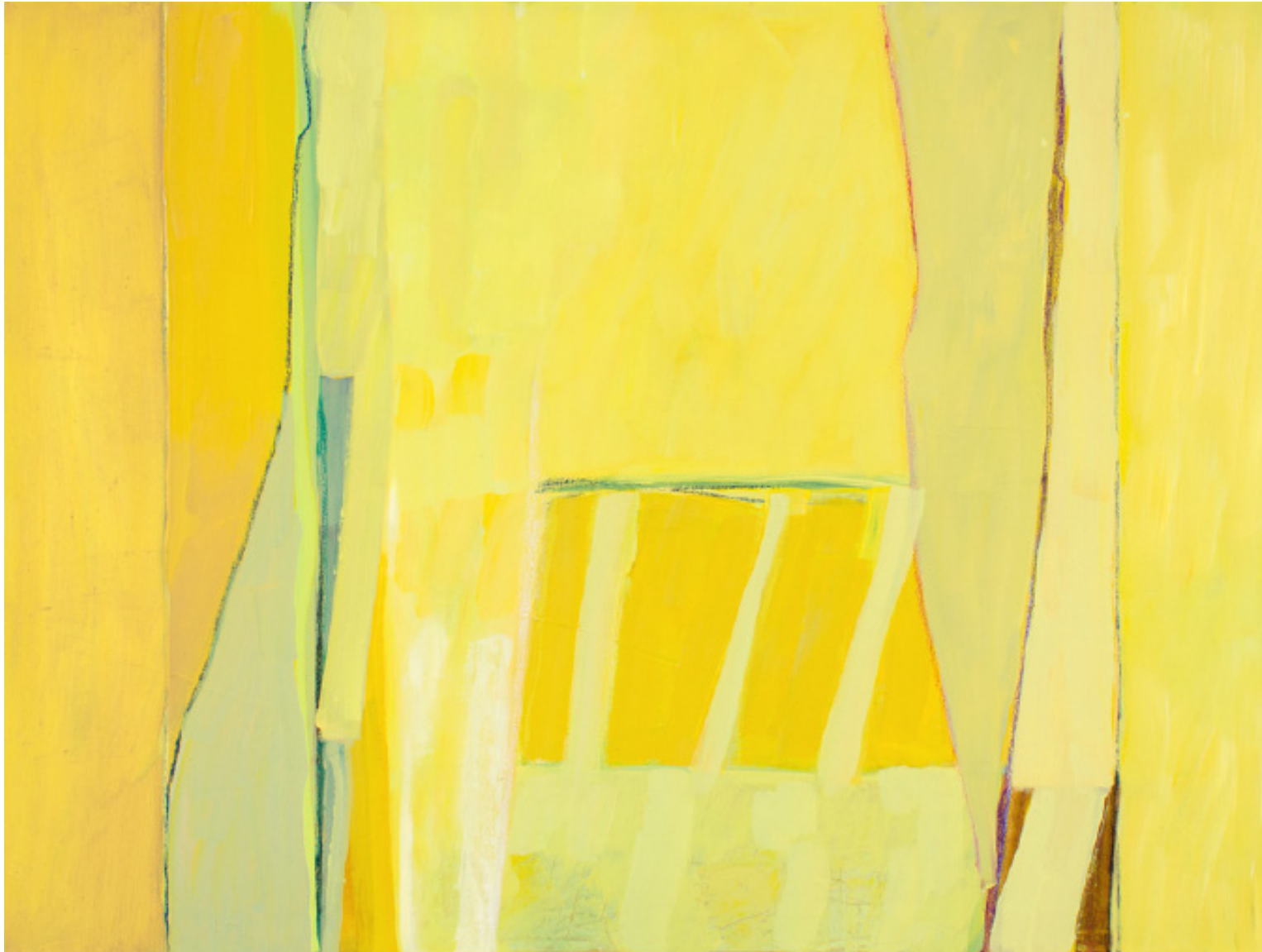
SUNDAY SUN FACADE 2017 Mixed Media on Canvas 30 x 40 inches