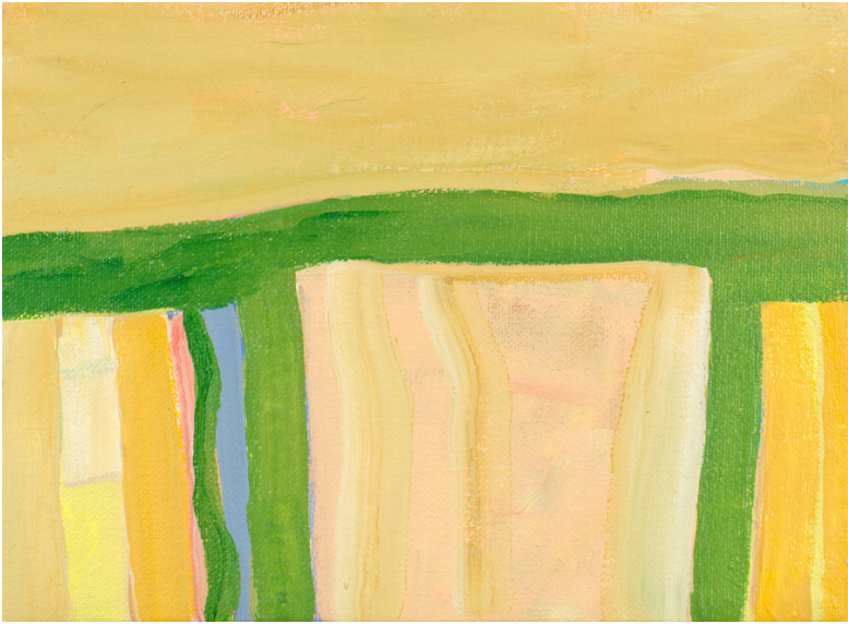
HADLEY STUDY 1 2017 Mixed Media on Canvas 6 x 8 inches