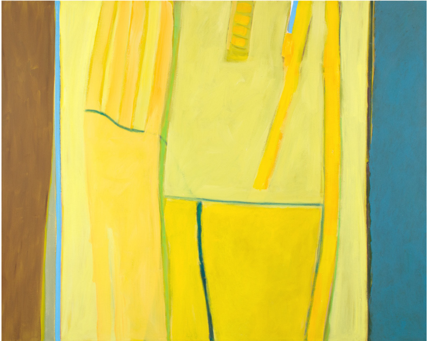
HADLEY: FIELDS 2017 Mixed Media on Canvas 48 x 60 inches