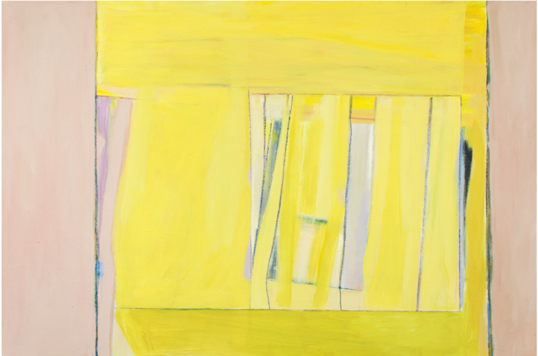
HADLEY: YELLOW SPRING 2017 Mixed Media on Canvas 48 x 72 inches