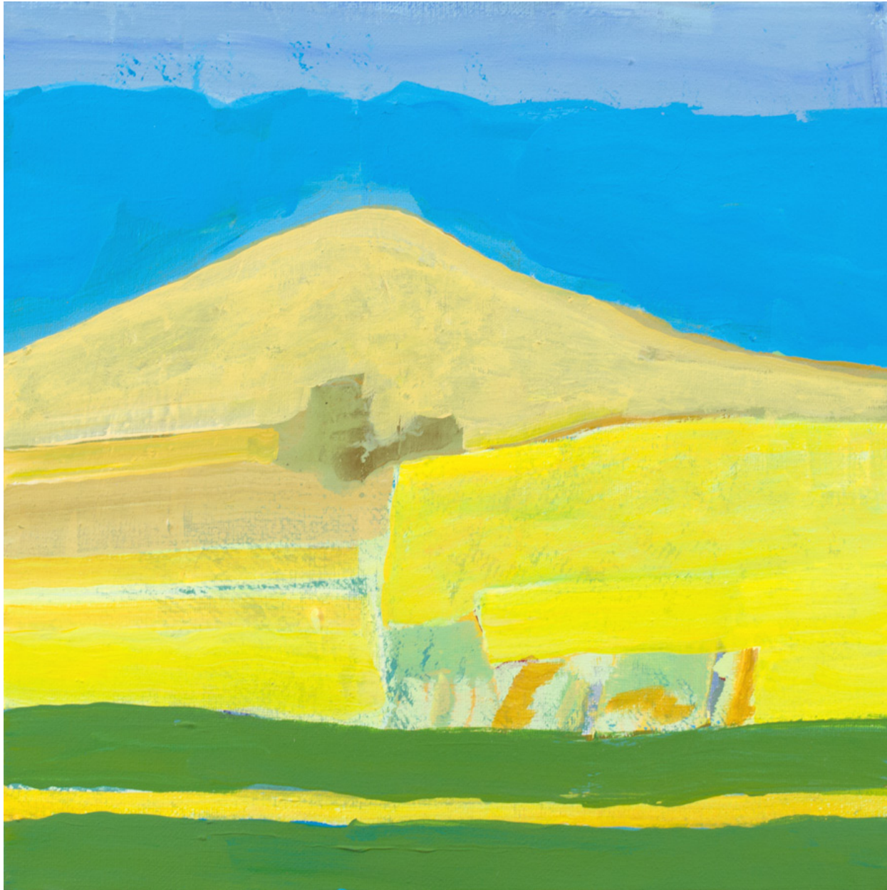
HADLEY MOUNTAIN 2017 Mixed Media on Canvas 12 x 12 inches