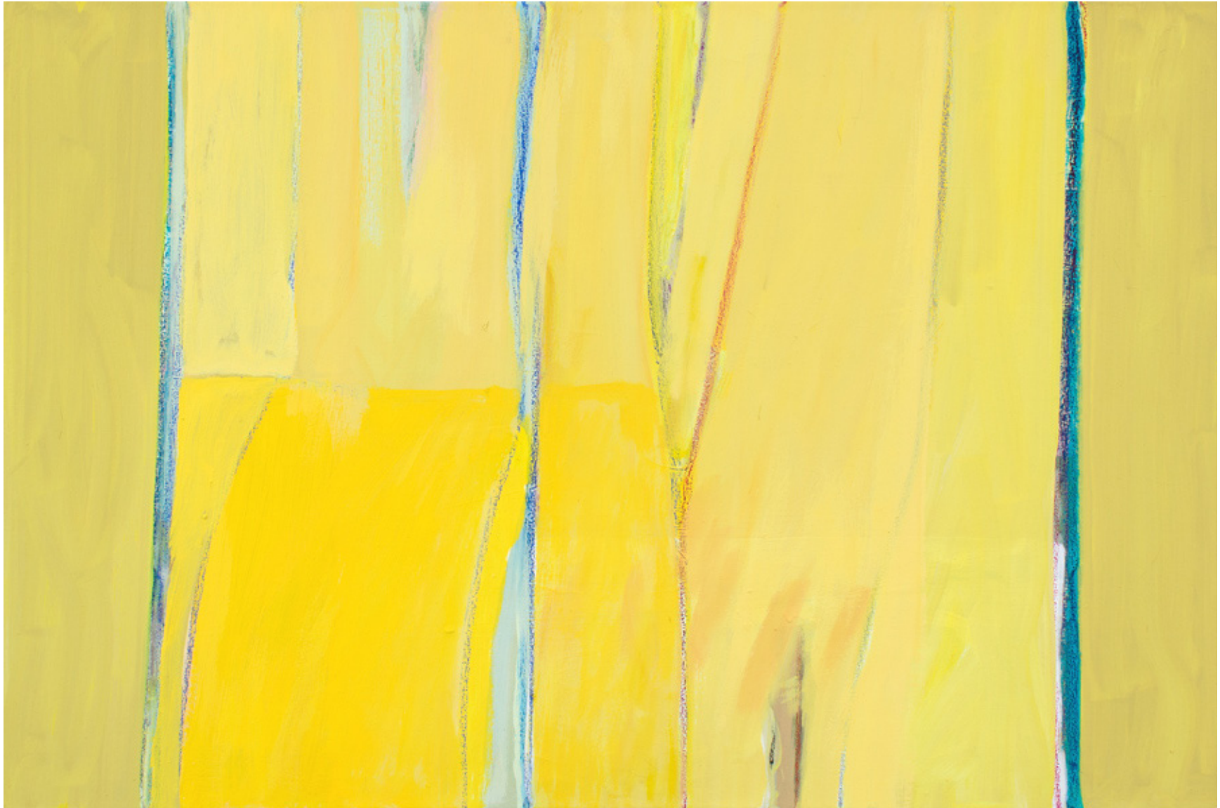
HADLEY SPRING STUDY 2017 Mixed Media on Canvas 24 x 36 inches