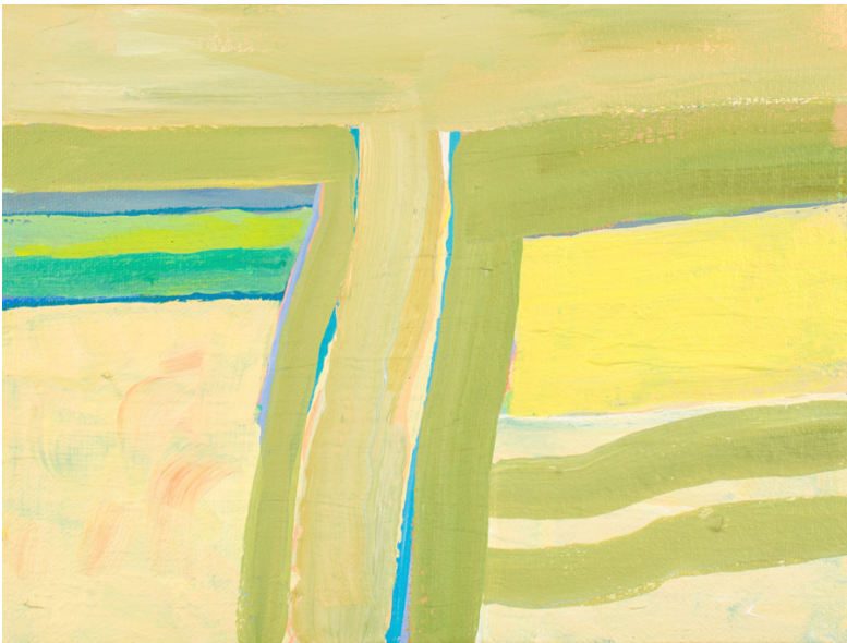
HADLEY STUDY 2 2017 Mixed Media on Canvas 6 x 8 inches