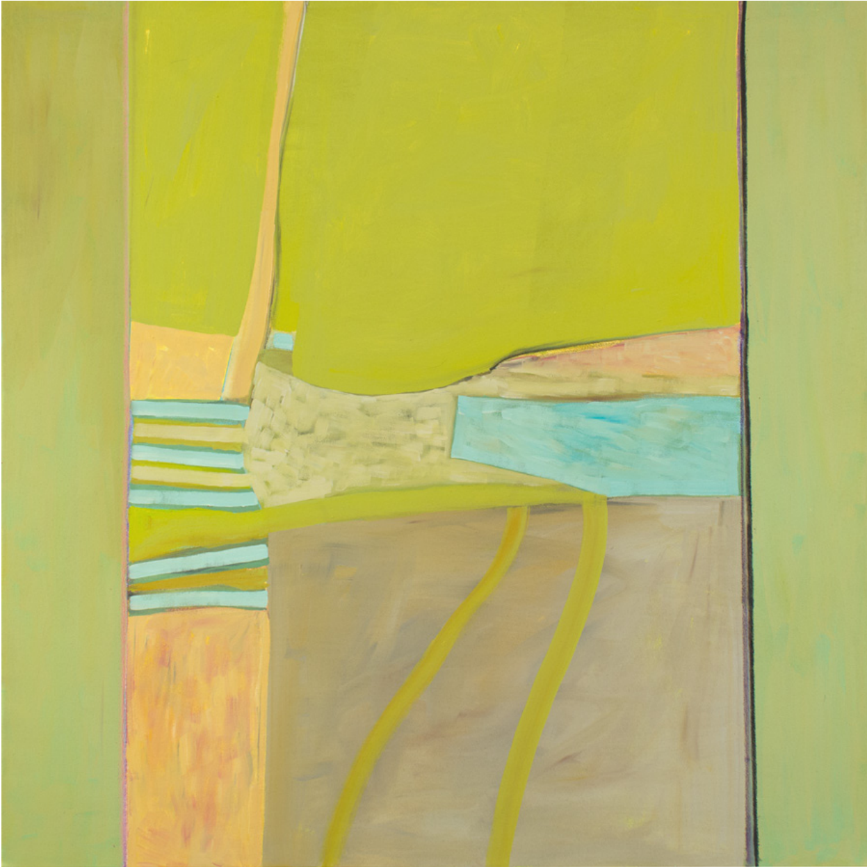
HADLEY: EARLY SUMMER TRACKS 2017 Mixed Media on Canvas 50 x 50 inches