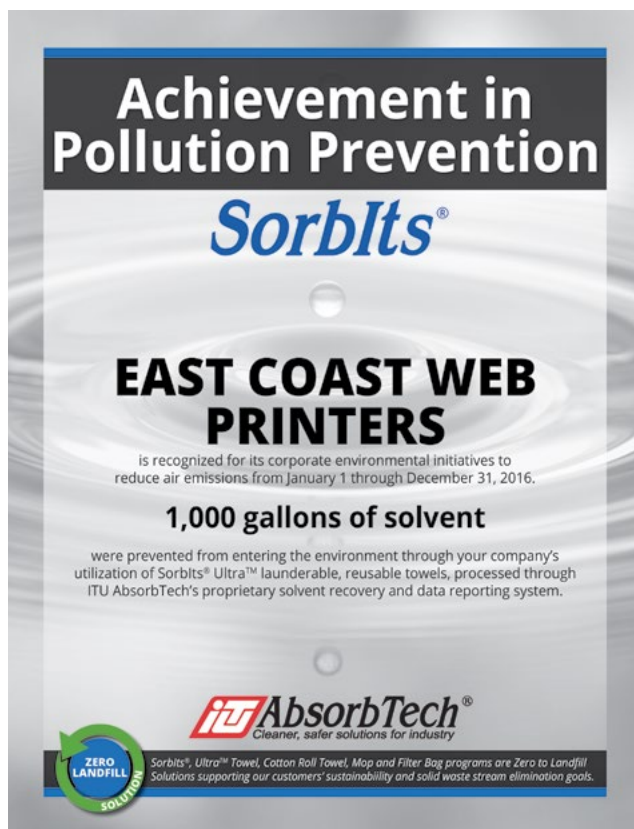
Sample Solvent Recovery Certificate