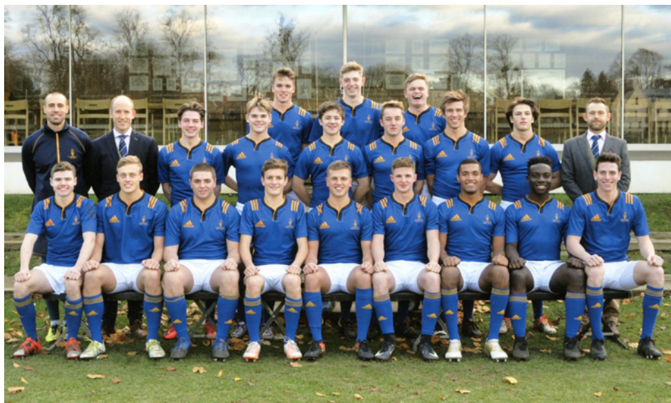
Rugby XV 2017-2018 - 13th in Daily Mail Trophy

Inaugural St Edward's U12 Rugby Festival.