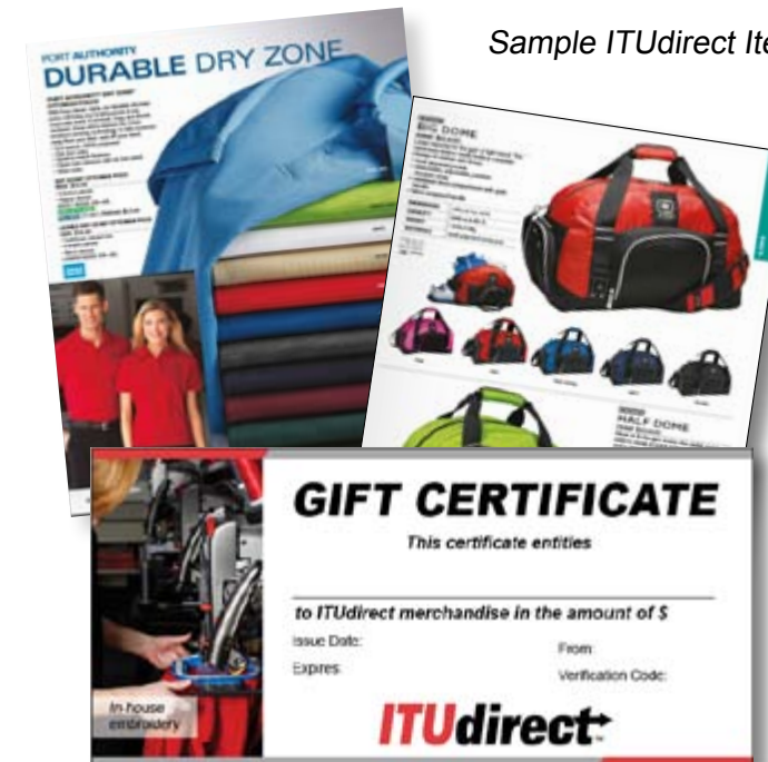
Sample ITUdirect Items

ITUdirect gift certificates can be used to purchase a wide variety of name brand shirts, polos, performance apparel, outerwear, and accessories. Apparel can be embroidered with your company logo.