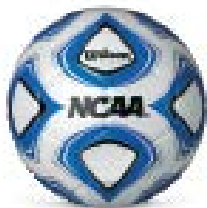
NCAA® FORTE FYBERD™

The distance between your dreams and reality becomes a little shorter with Wilson®. We create soccer equipment with revolutionary technology and unparalleled craftsmanship. That's why we're the Official Match Ball of the NCAA® Championships.